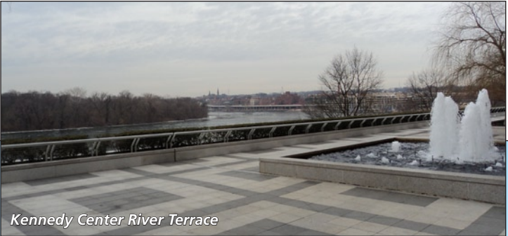
Kennedy Center River Terrace