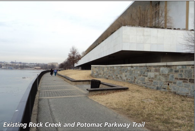
Existing Rock Creek and Potomac Parkway Trail

A public scoping meeting will be held February 22, 2011 . This public scoping meeting will include an “open house” format that will include a brief presentation about the project. Doors will open at 6:00 p.m. NPS and planning staff will be on hand to visit with you and answer questions. The location, time, and date are presented below: