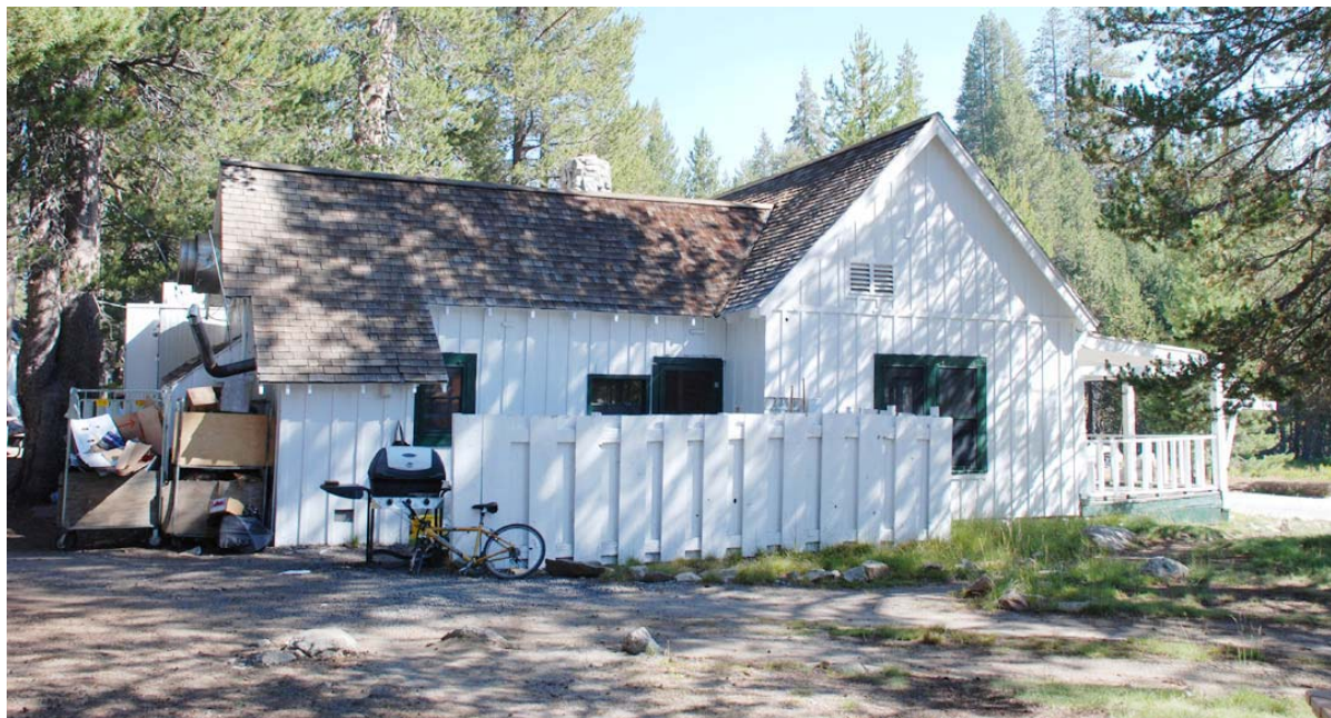
Main Lodge Looking North, September 2010