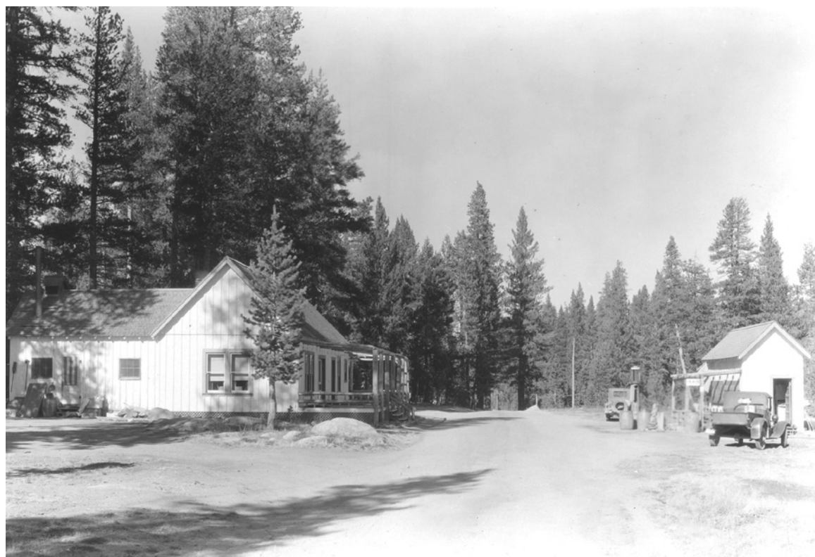
White Wolf Looking North, October 24, 1933