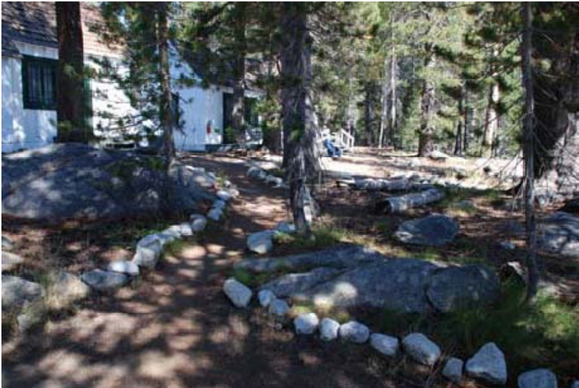
Dirt Path to Cabins