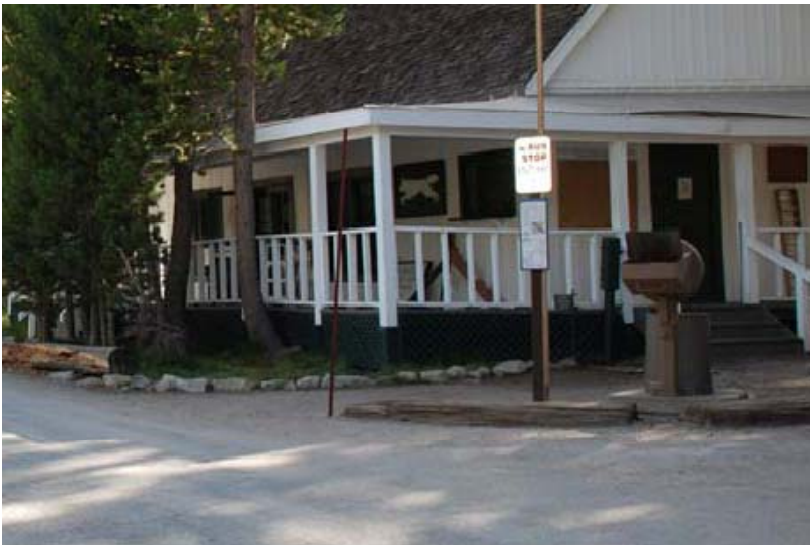
Trees Crowding Foundation and Roofline of the Porch