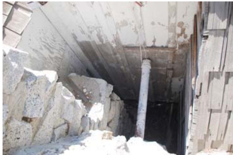
Inaccessible Area Adjacent to Chimney