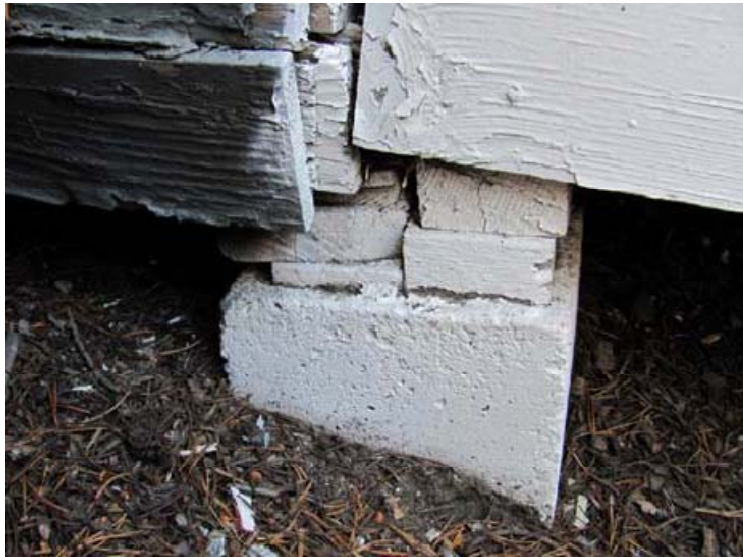
Typical Blocking at Piers