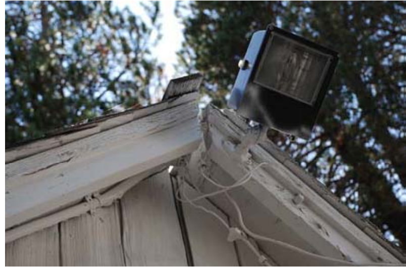
Separation of Structure at North Gable