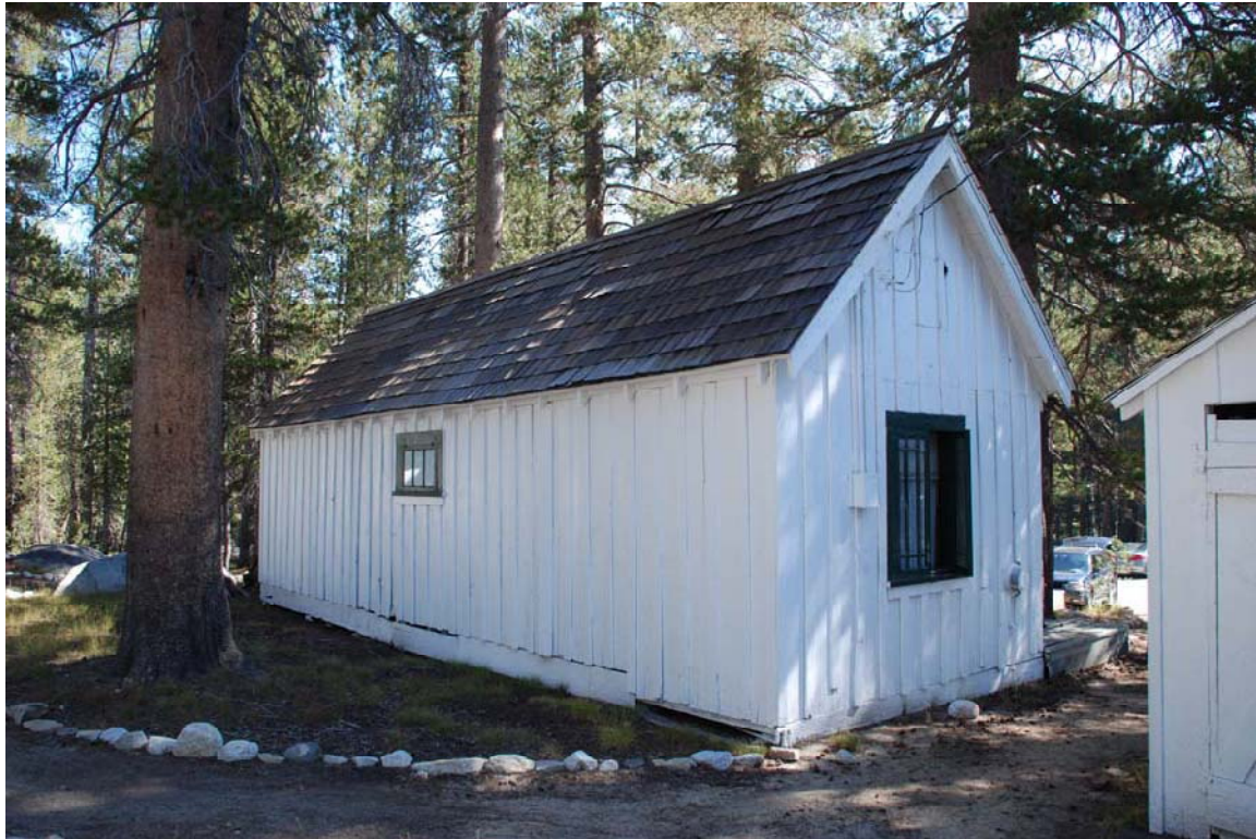
Duplex Cabin 1/2, Looking Northwest