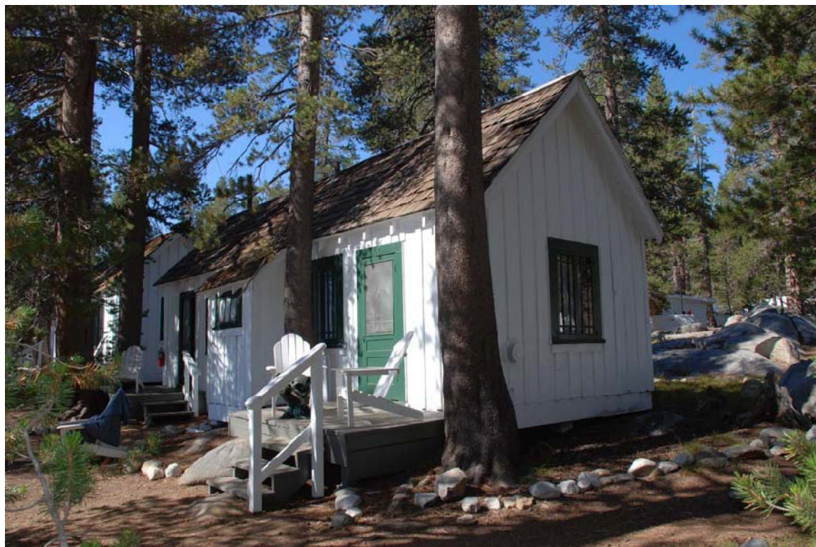
Duplex Cabins 1/2, Looking Southwest