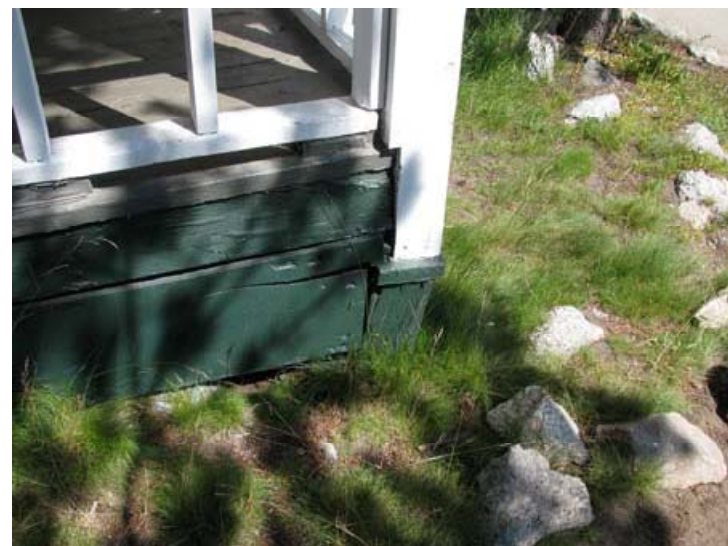
Deteriorated Sill Plate and Column