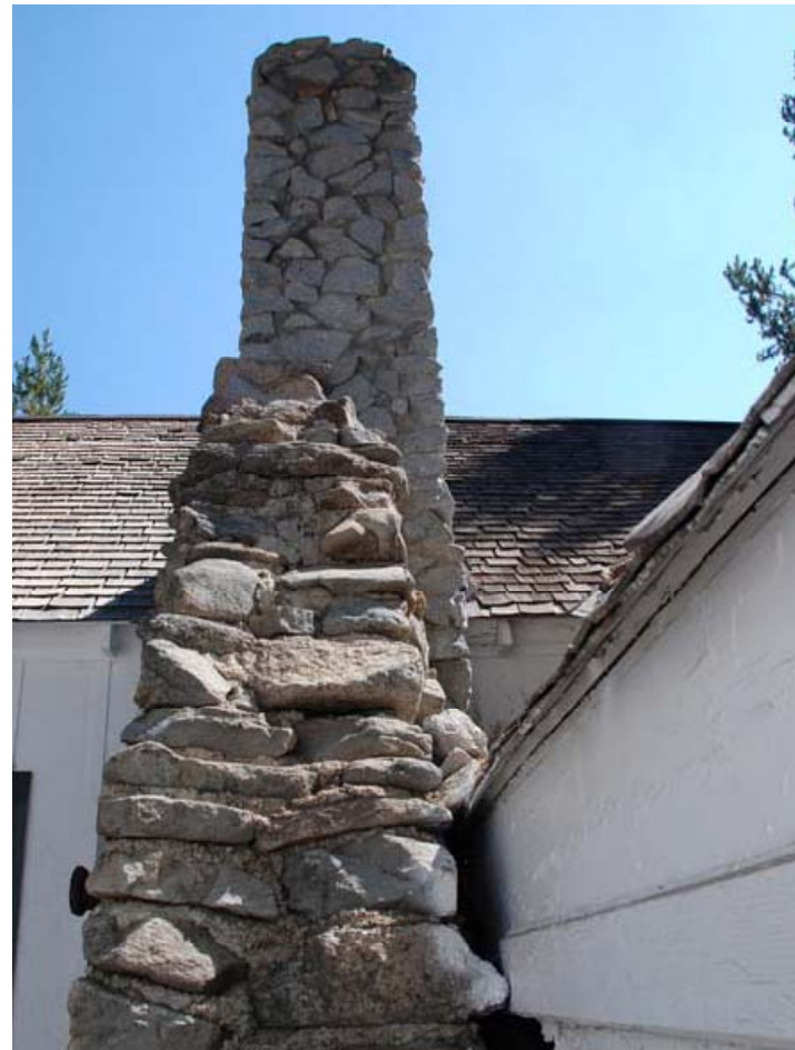
Chimney Looking East up Buttress