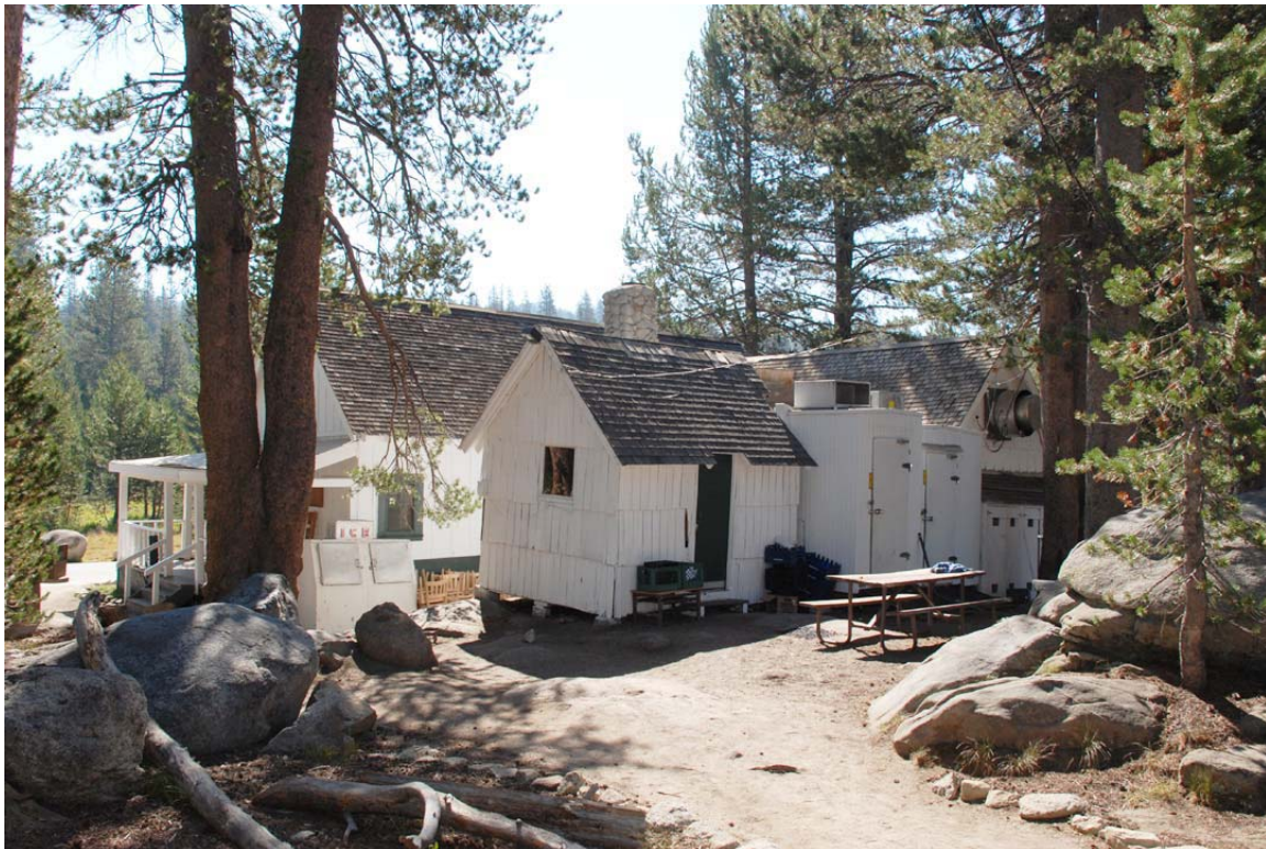
White Wolf Storage Building, Looking Southeast