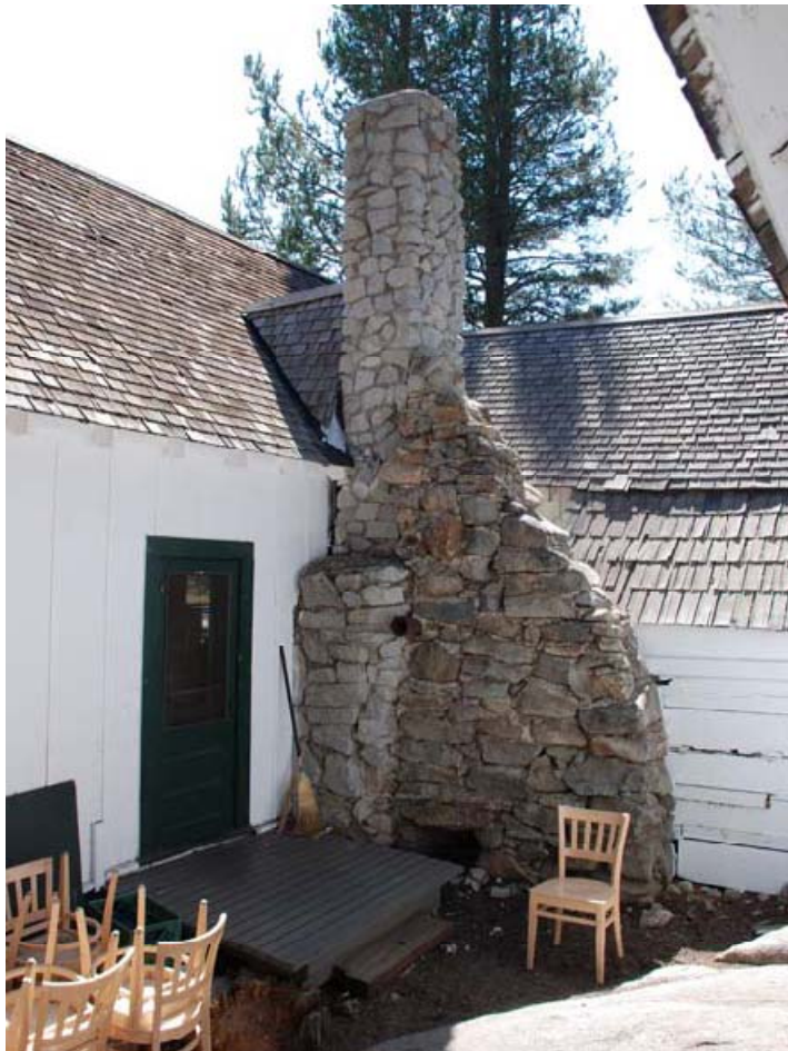
Chimney with Buttress