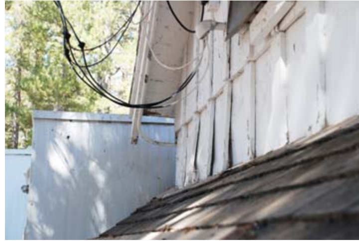
Detached Battens above Storage Space