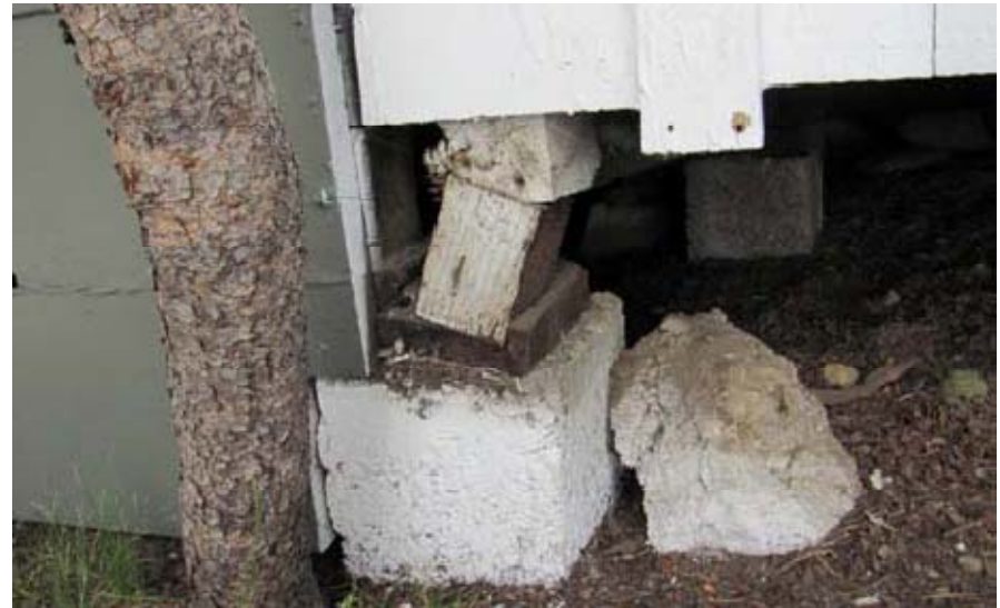
Typical Rotation of at Columns at Piers