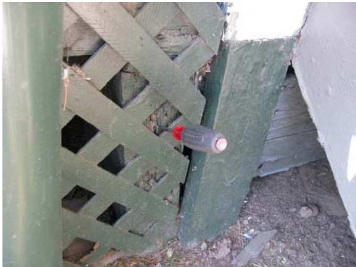
Deterioration of Porch Column