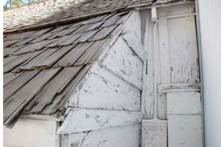
Deterioration of Horizontal Siding, North Shed