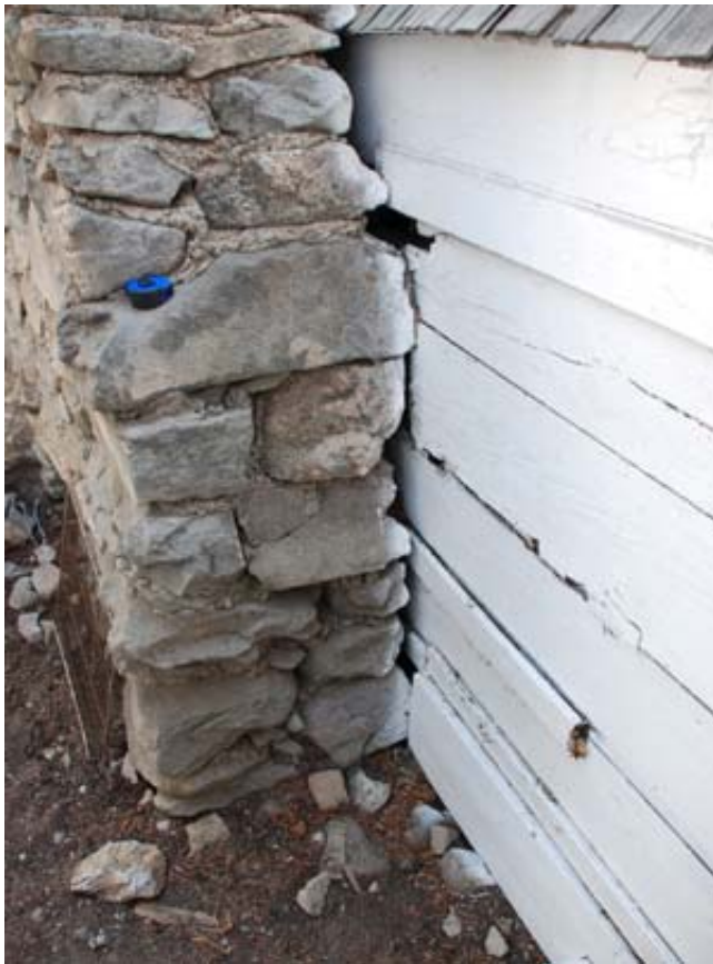
Deterioration of Horizontal Siding, North Shed