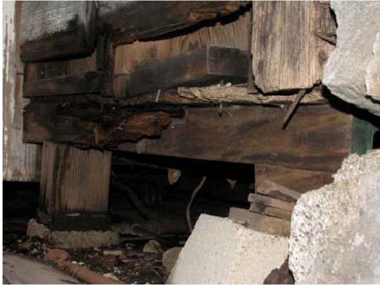
Deterioration of Sill Plate & Wall Studs at North Side of Kitchen