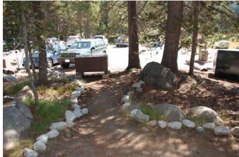
Dirt Path to Parking Lot