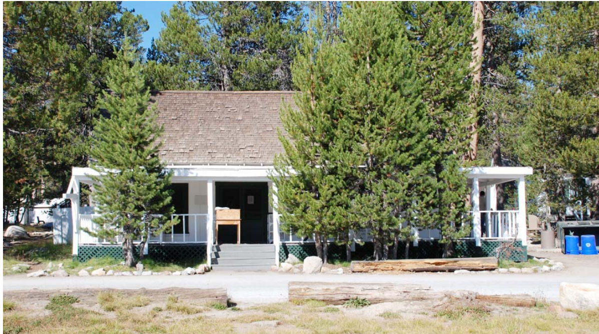
Main Lodge Looking West, September 2010