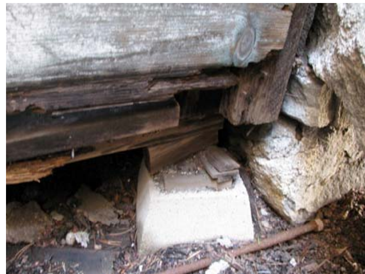
Leaning and Displace Porch Column