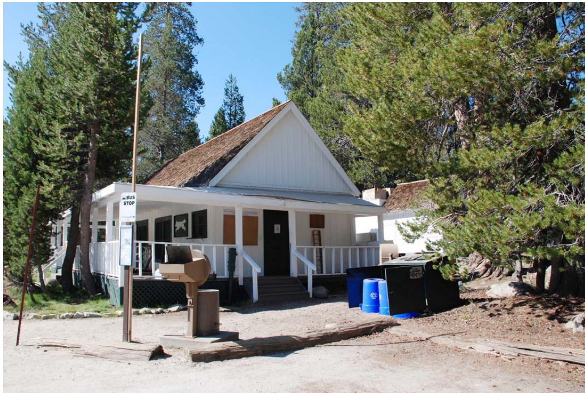
Main Lodge Looking South, September 2010