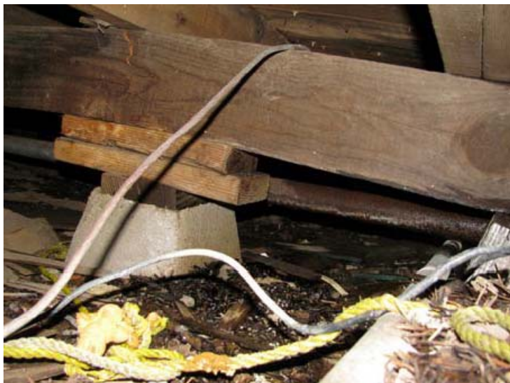
Footing, Shims, and Broken Floor Joists