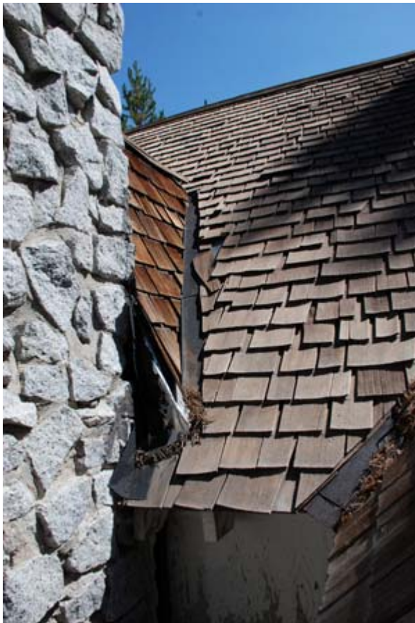
Inadequate Roofing at Chimney