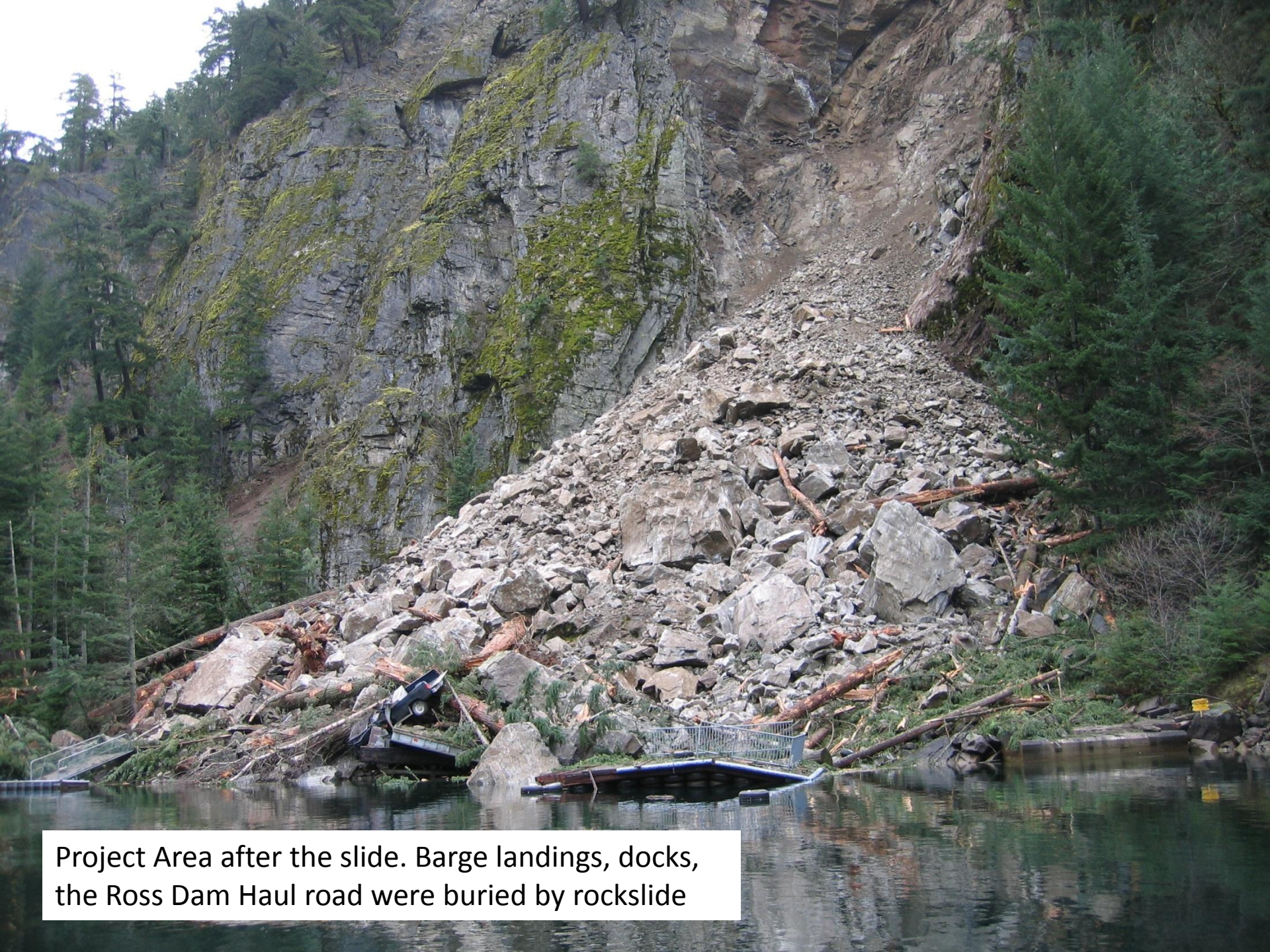
Project Area after the slide. Barge landings, docks, the Ross Dam Haul road were buried by rockslide