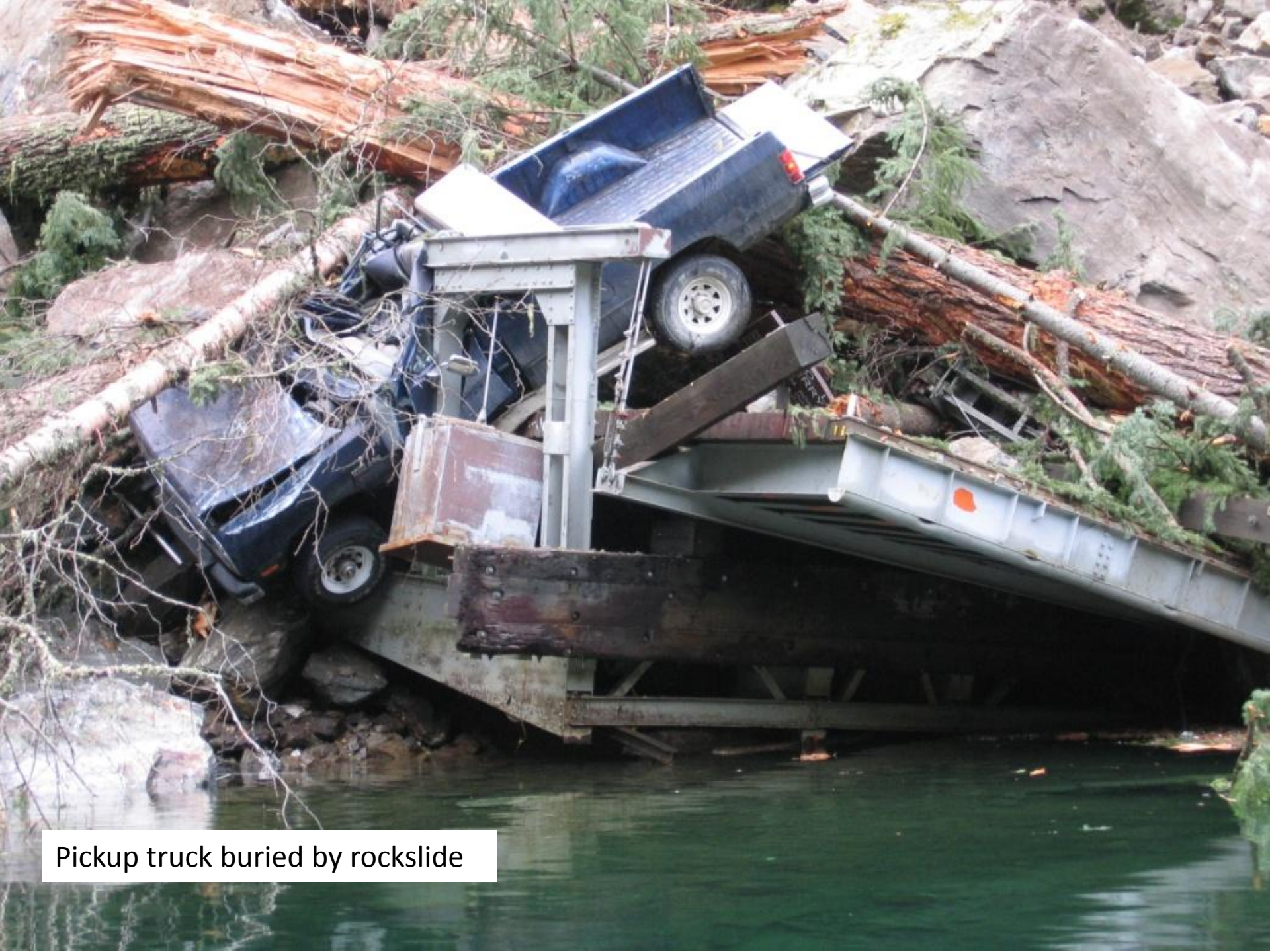
Pickup truck buried by rockslide