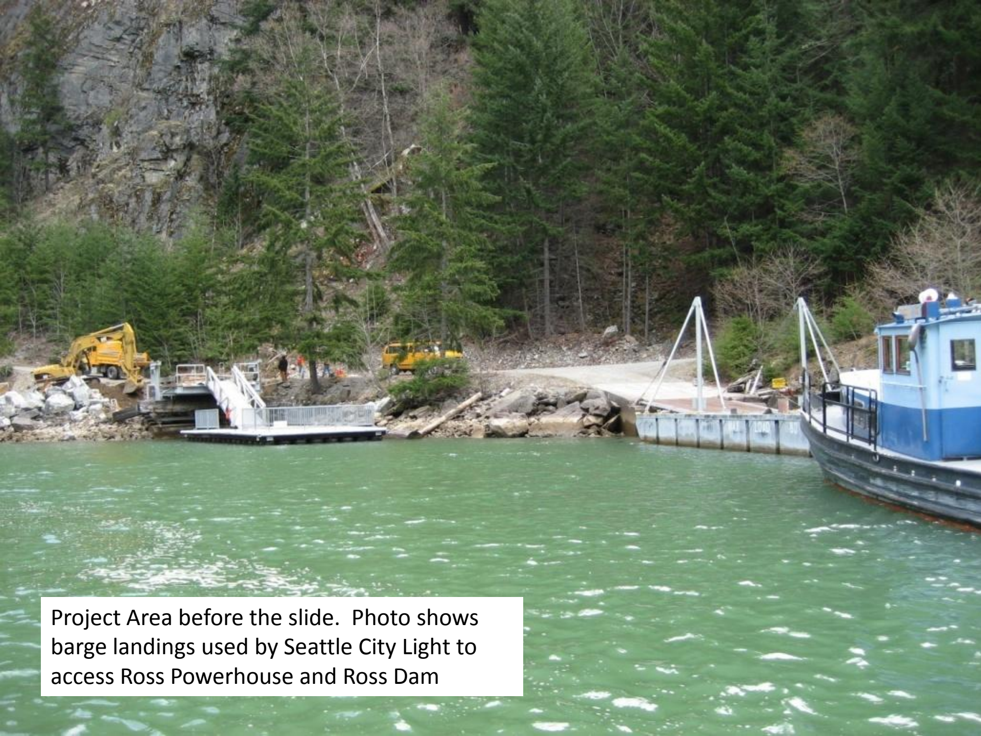
Project Area before the slide. Photo shows barge landings used by Seattle City Light to access Ross Powerhouse and Ross Dam