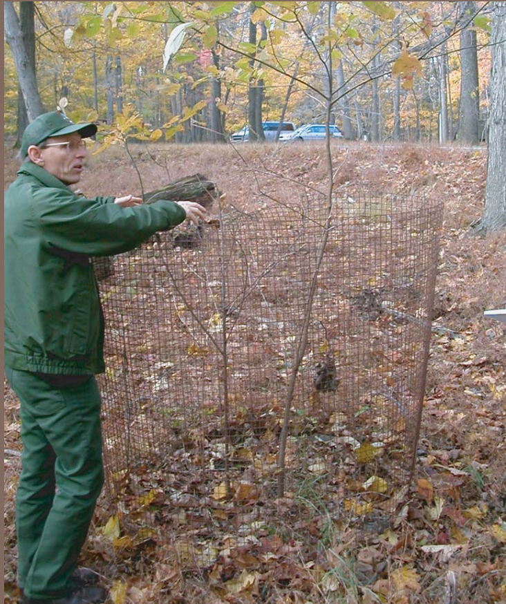
Under all alternatives, NPS will continue to communicate with the public and other organizations on deer management and forest regeneration.