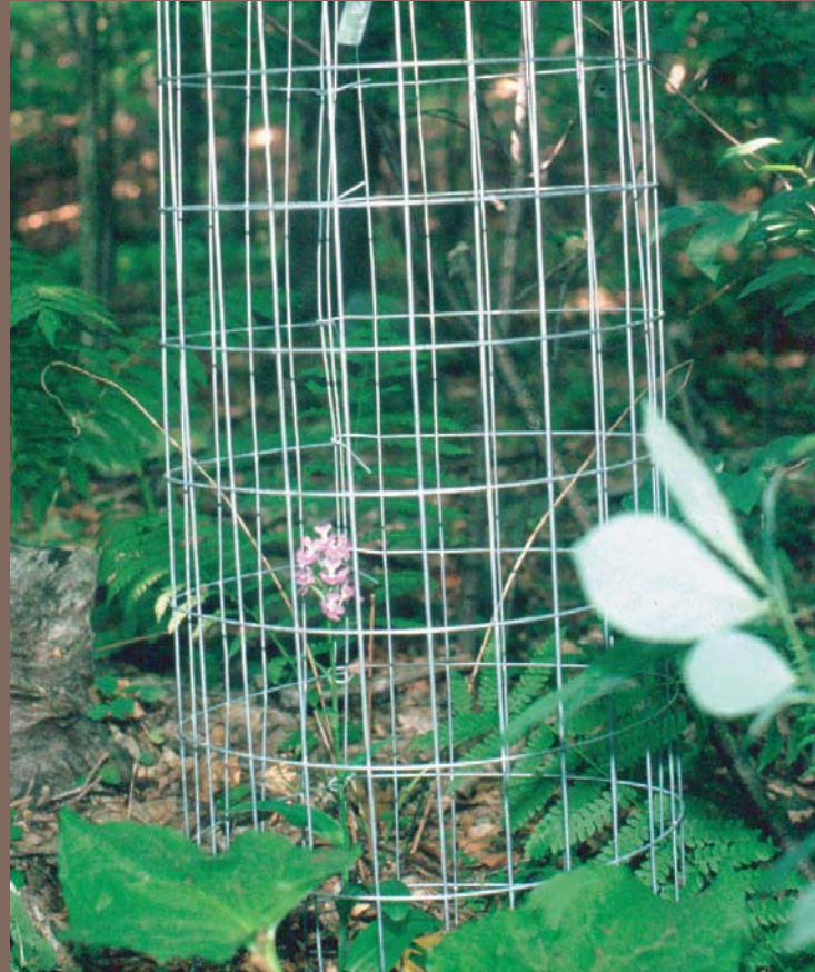
Example of single species fencing currently occurring and common to all alternatives.

The use of reproductive control in does as a standalone alternative was considered, but given the current size and lack of containment of the Catoctin deer population it was decided that this alternative would not meet the plan’s objectives and was more feasible as a component of other alternatives. Research has shown that controlling population growth using current contraceptive technology on populations greater than 200 animals, where deer are not contained, is not feasible. Therefore, in order for this method to be effectively used in achieving the plan’s objectives, the doe population would first need to be reduced to fewer than 100 does in order for treatment to succeed or combined with another alternative to foster forest regeneration (Rudolph et al. 2000).