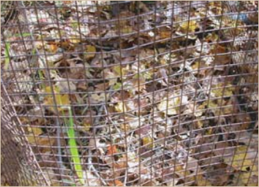
Under Alternative B, fencing would be expanded to include large exclosures in addition to the small exclosures like the one above that protects maple seedlings.

Current methods of reproductive control cannot be effectively implemented for deer herds of more than 200 animals due to current drug availability, efficacy, and application technology.