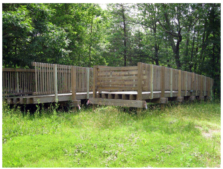
Bridging material for the proposed Ellwood Manor to Wilderness Tavern site bridge