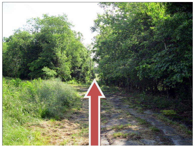
Looking northeast along the asphalt covered old State Route 720 toward Wilderness Run. Trail would follow the road - in the direction of the arrow.