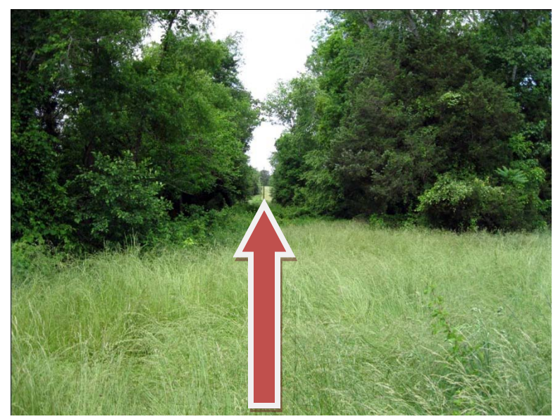
Looking southwest along route of path toward Wilderness Run. Trail would be a mown path following the direction of the arrow.