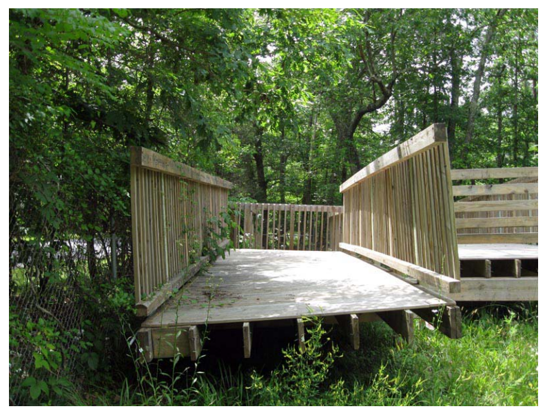
Bridging material for the proposed Ellwood Manor to Wilderness Tavern site bridge