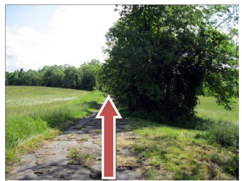
Looking northeast from the original entrance to Ellwood. Trail would follow the asphalt covered old State Route 720 to Wilderness Run - in the direction of the arrow.