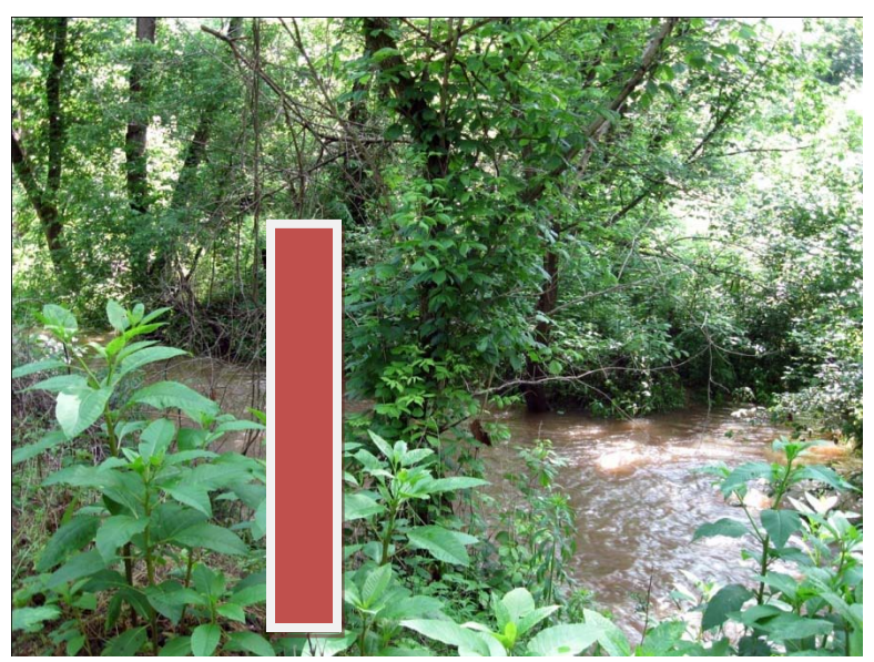
Looking northeast across Wilderness Run. The bridge would be installed where the block is. Vegetation will be cleared for installation of bridge.