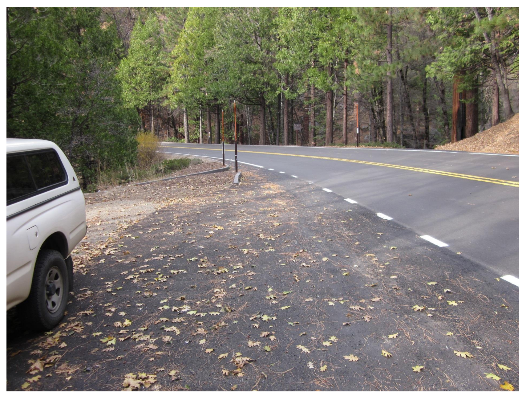
Alder Creek Staging Area – SW of drainage