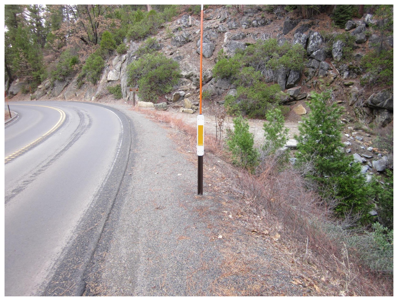
Avalanche Creek Staging Area – NE of drainage Alternatively, there is large pullout NW of drainage.