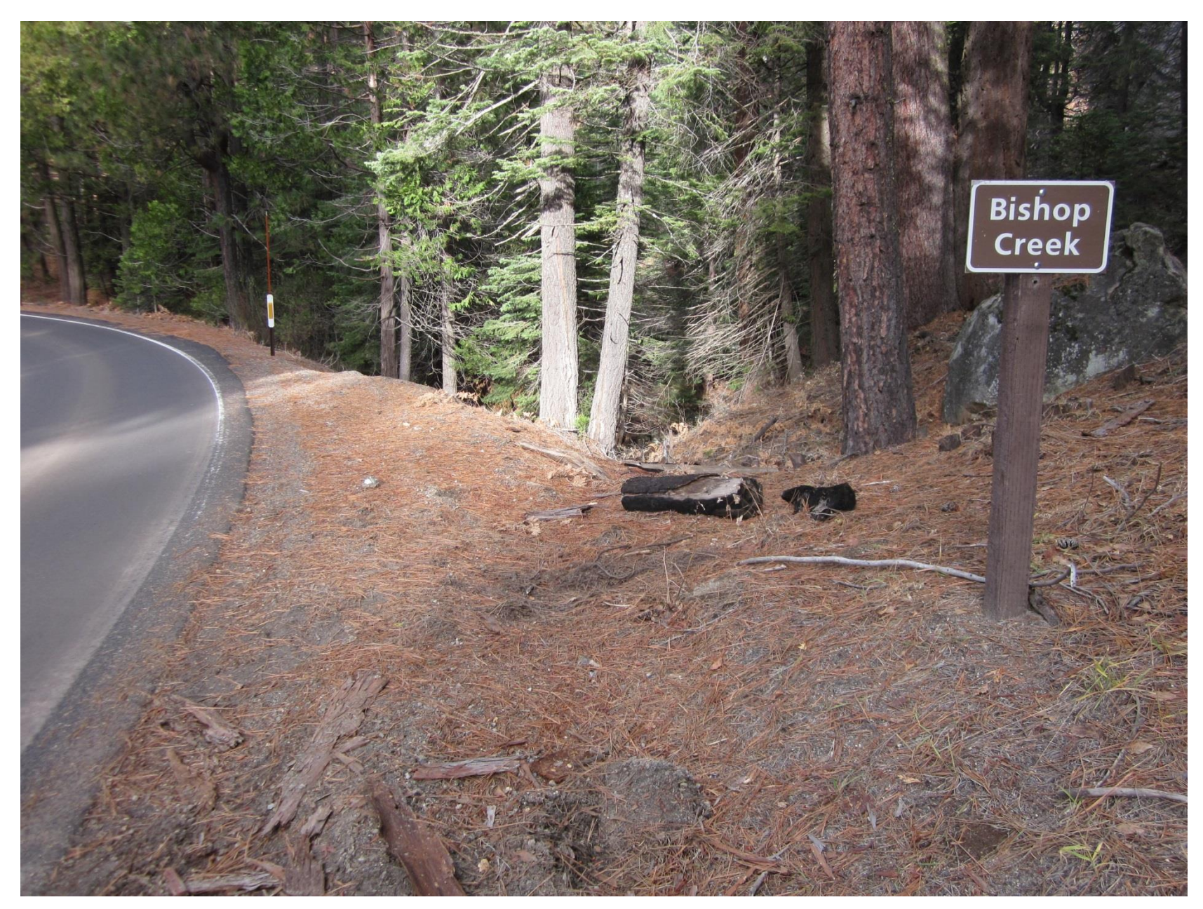
Bishop Creek Staging Area – SE of drainage. Alternatively, there is large pullout NW of drainage.