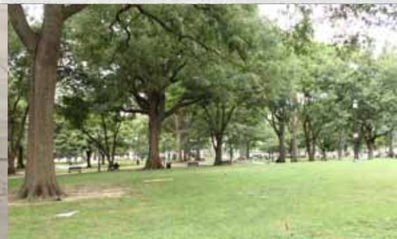
Large areas, such as the central grass areas, are under used and lack adequate programming.