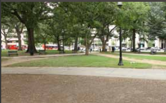
Numerous social trails have formed along the desired walking paths.