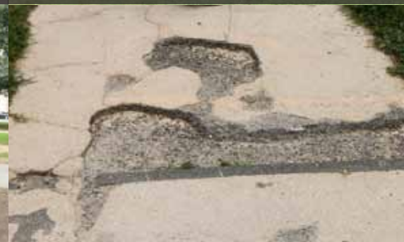
Deterioration of the path pavement results in tripping hazards.