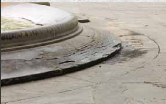
The park's central fountain is deteriorating and requires repair.

In accordance with the National Environmental Policy Act of 1969 (NEPA), the NPS is preparing an Environmental Assessment (EA) to evaluate proposed actions as well as a review of potential impacts to historic park resources through the National Historic Preservation Act Section 106 process.