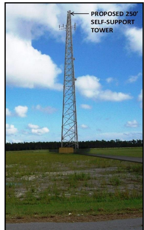
Figure 3. Photo simulation of proposed 250' self-support tower

The Verizon Wireless application states that the proposed WTF are needed to comply with federally mandated E-911 emergency requirements and would provide convenience and safety to Verizon Wireless subscribers and park visitors. In the event of a natural disaster or safety issue, all wireless subscribers in the coverage area, regardless of whose service they use, would be able to make a 911 emergency call on the Verizon system. The application also states that the proposed WTF are needed to provide wireless communications service along the Main Park Road (State Road 9336) from the Ernest F. Coe