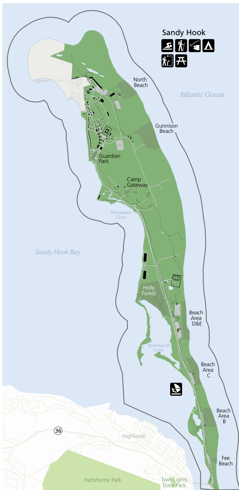
Figure 1-2. Sandy Hook Unit.