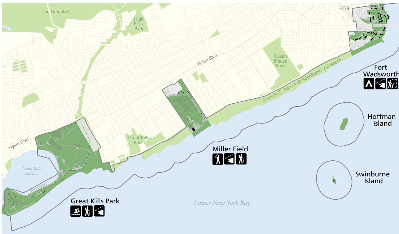
Figure 1-4. Staten Island Unit.