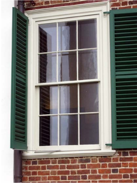
Exterior view of window at James Madison's Montpelier. The window has an interior storm window. FRSP proposes to use similar storm windows.