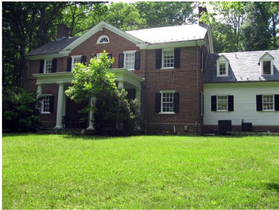
Superintendent's House - rear (south) facade