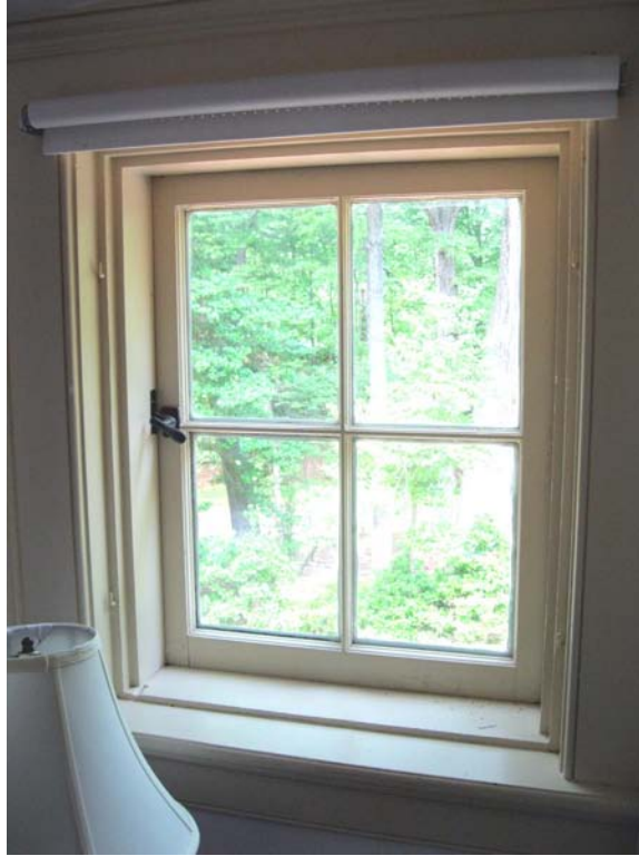
Typical casement window in the Superintendent's House. FRSP proposes to install an interior storm window.