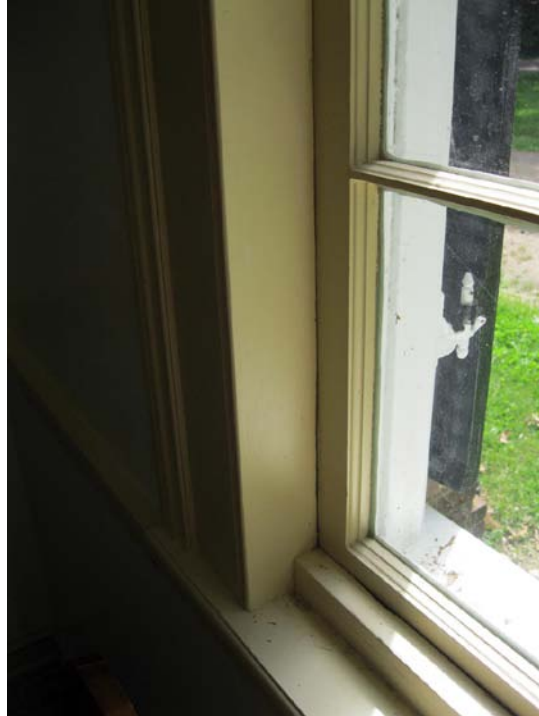
Detail of frame for typical double hung sash window in the Superintendent's House. FRSP proposes to install an interior storm window.