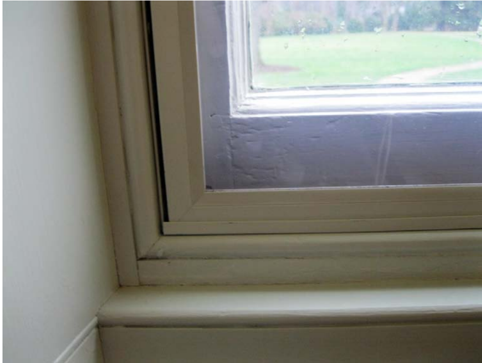
Interior view of window at James Madison's Montpelier. The window has an interior storm window. Detail of magnetic attachment. FRSP proposes to use similar storm windows.