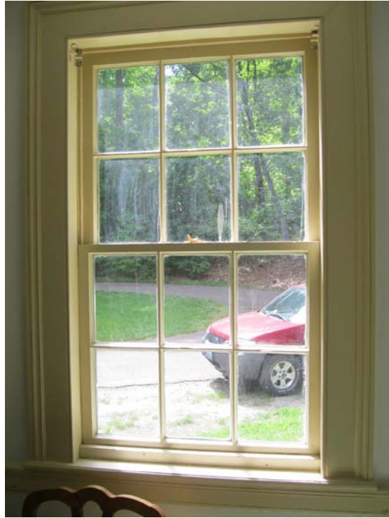
Typical double hung sash window in the Superintendent's House. FRSP proposes to install an interior storm window.