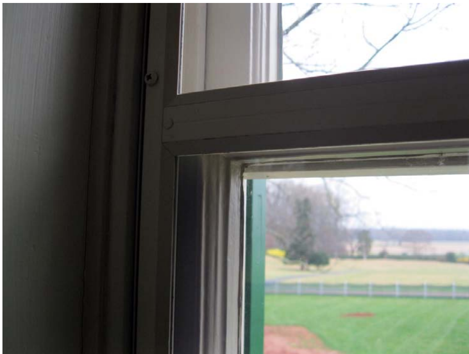
Interior view of window at James Madison's Montpelier. The window has an interior storm window. Detail of magnetic attachment. FRSP proposes to use similar storm windows.