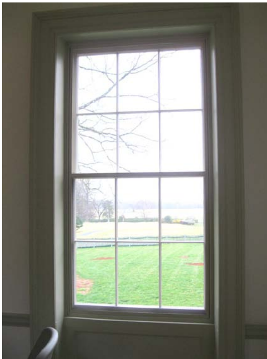
Interior view of window at James Madison's Montpelier. The window has an interior storm window. FRSP proposes to use similar storm windows.