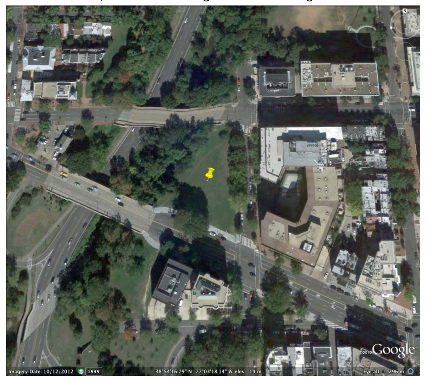
NCPC Site 46 – bounded by Rock Creek Park, Pennsylvania Avenue, 26th & M Streets, NW, at the eastern edge of historic Georgetown