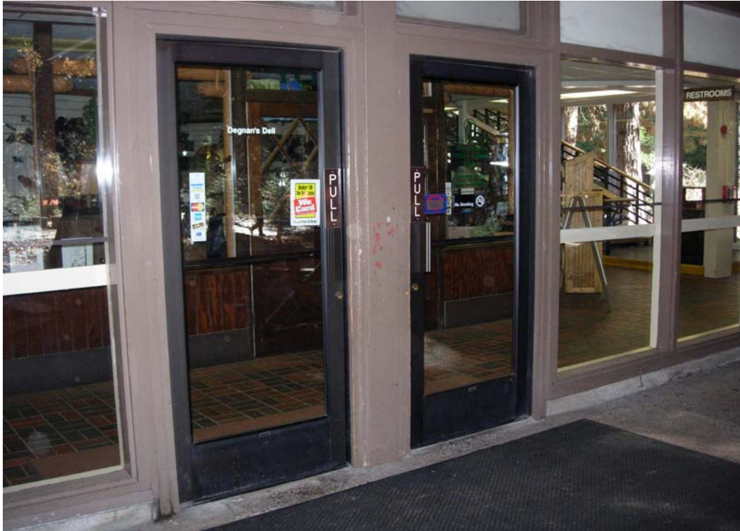
Degnan's Deli Entrance Doors – Exterior