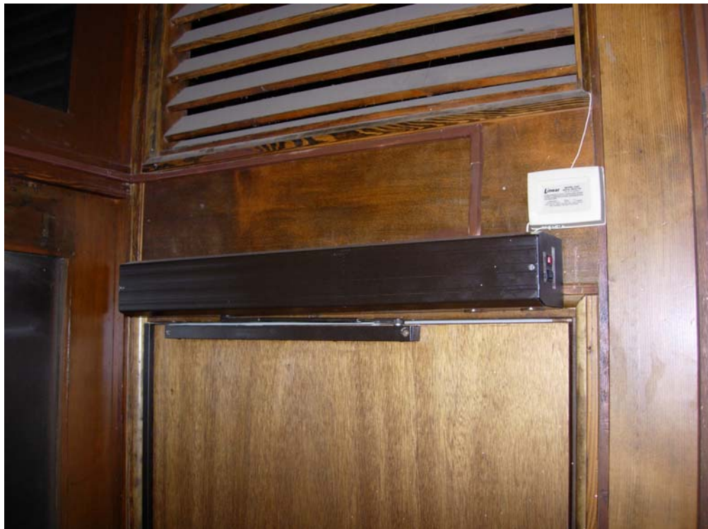
Curry Village Pavilion Restroom Doors