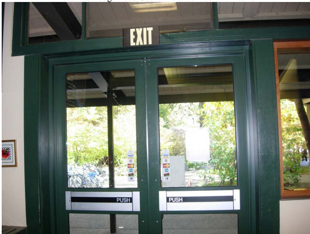
Yosemite Lodge Food Court Entrance Doors – Interior