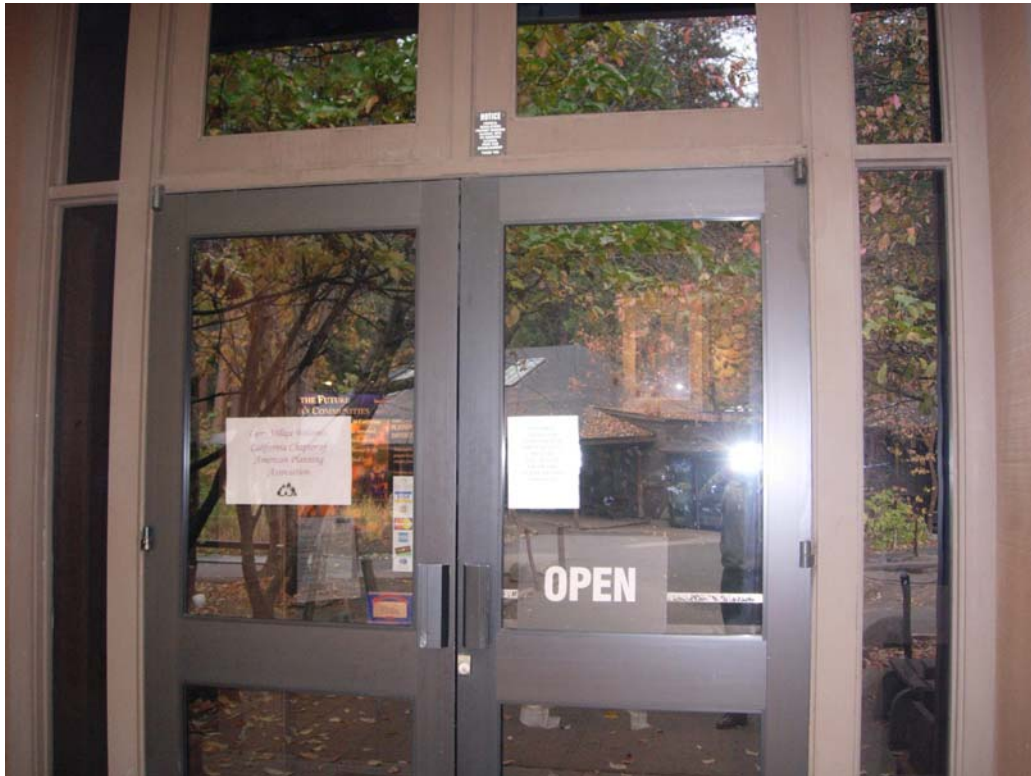
Curry Village Pavilion Main Entrance Doors – Exterior