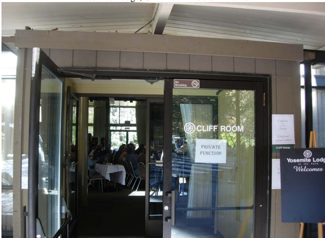
Yosemite Lodge, Cliff Room Doors - Exterior