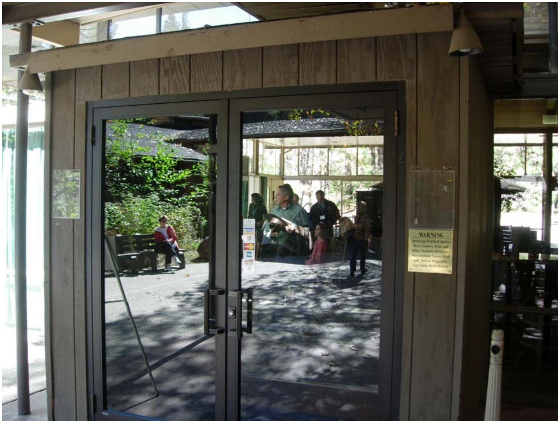
Yosemite Lodge Bar Doors – Exterior