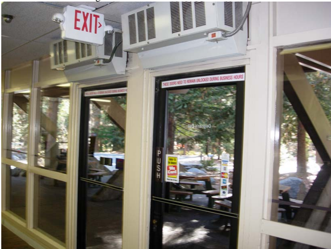
Degnan's Deli Entrance Doors – Interior