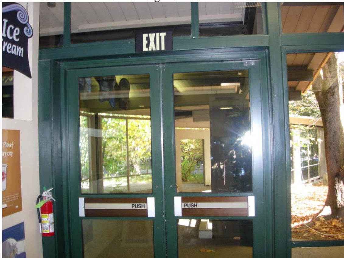
Yosemite Lodge, Food Court Exit Doors – Interior