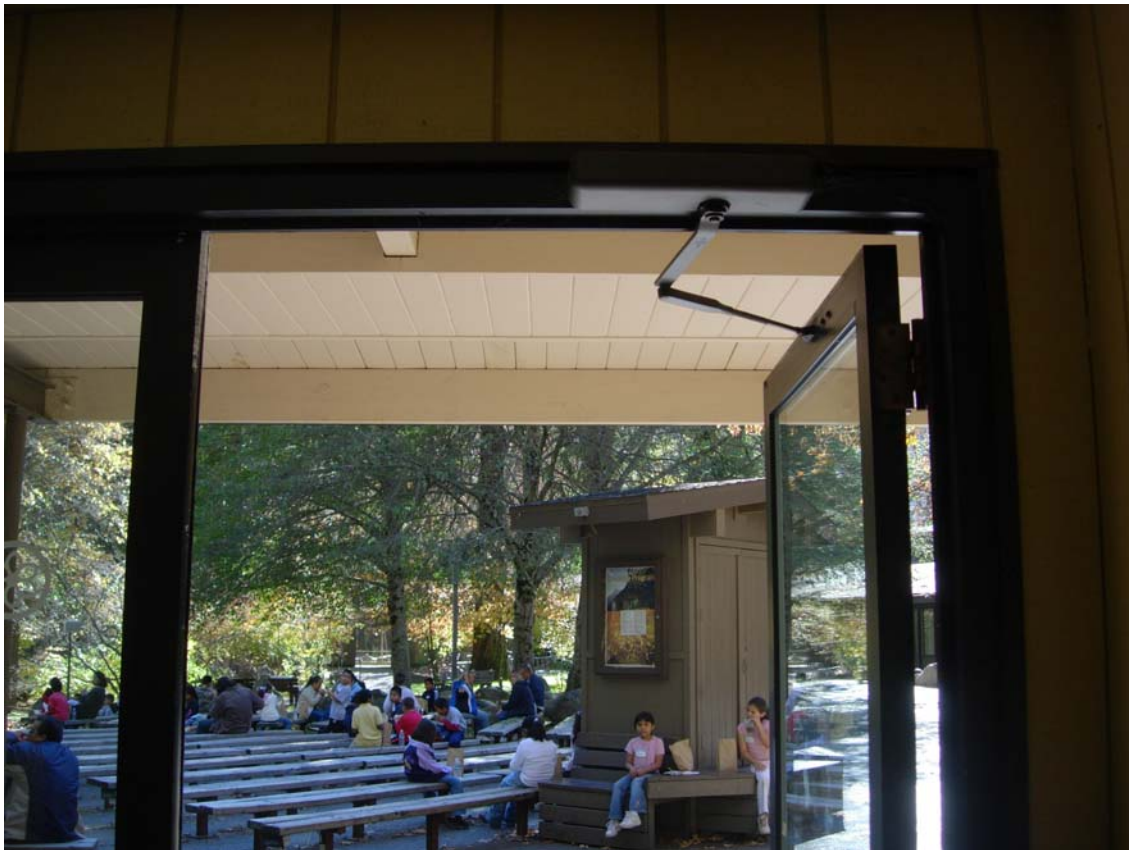
Yosemite Lodge, Cliff Room Doors – Interior