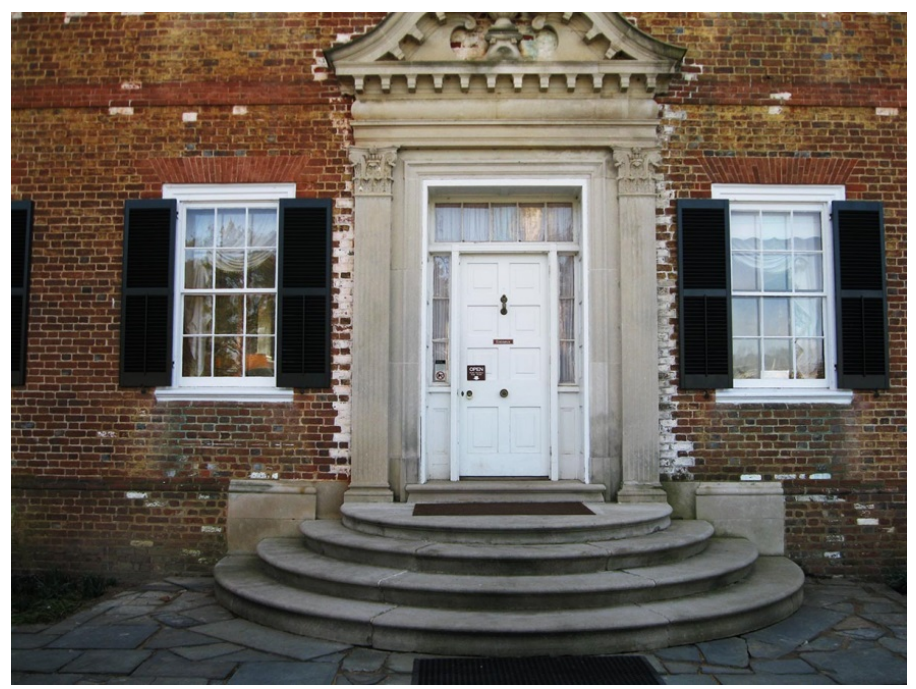
East entrance to Chatham Manor and elliptical steps.