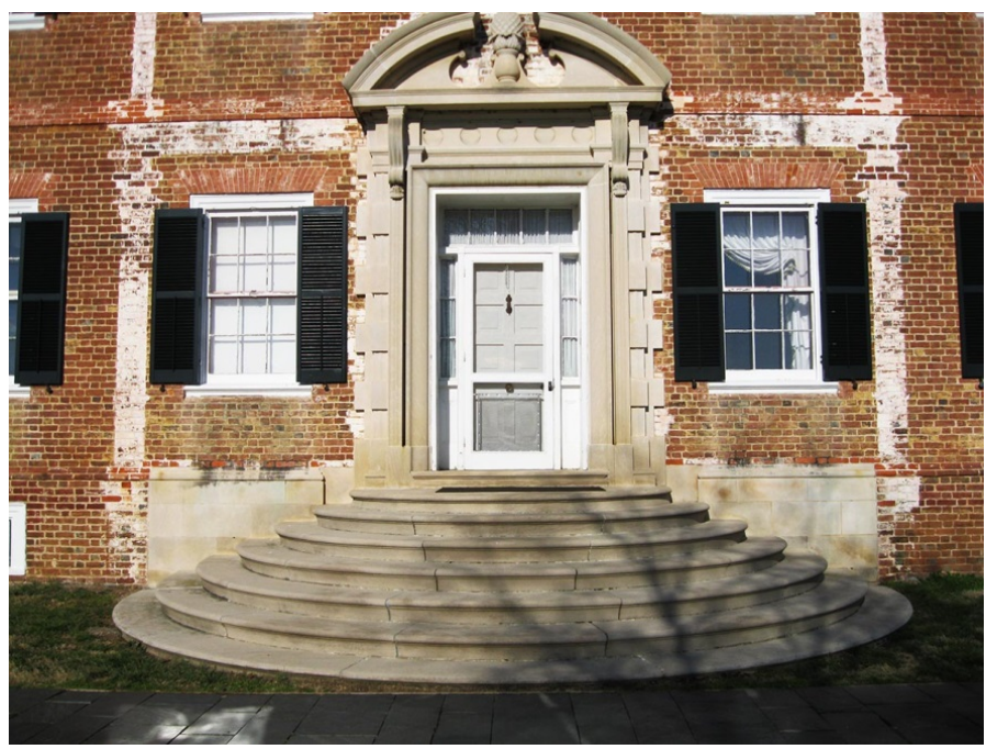
West entrance to Chatham Manor and elliptical steps.