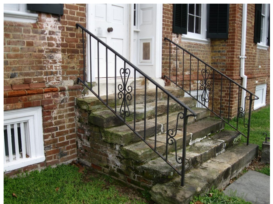
Existing railings on a west entrance to Chatham Manor. These railings date from the mid-20<sup>th</sup> century. This entrance is not open to the public, as it accesses park office space.