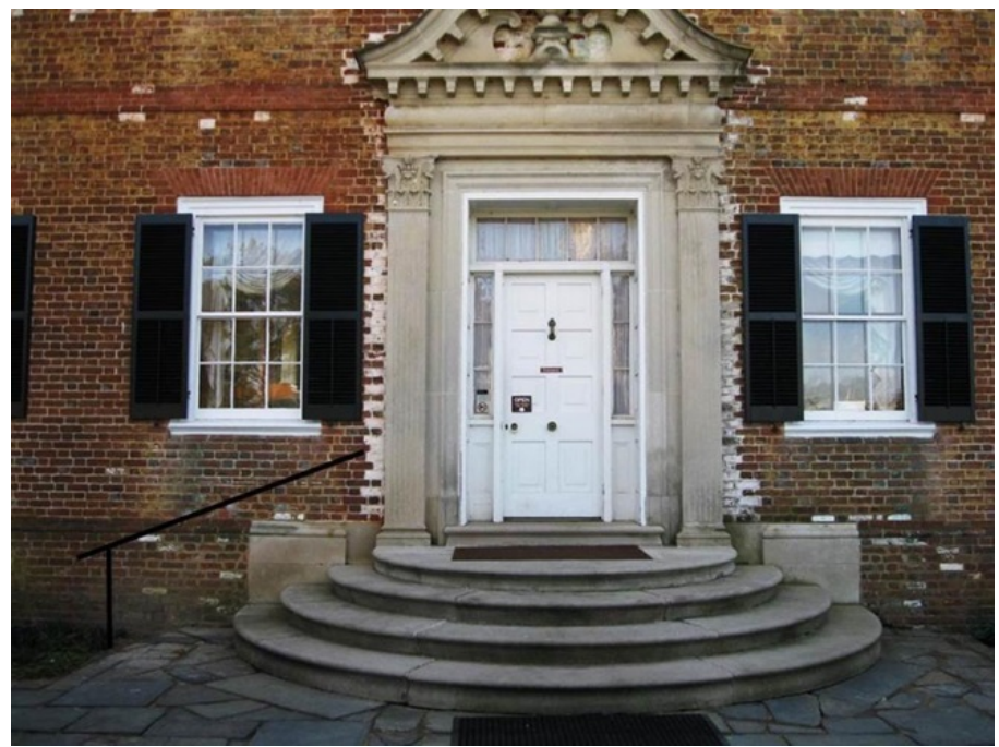
East entrance to Chatham Manor. Black lines to the left of the door represent proposed railing attached to the exterior wall.