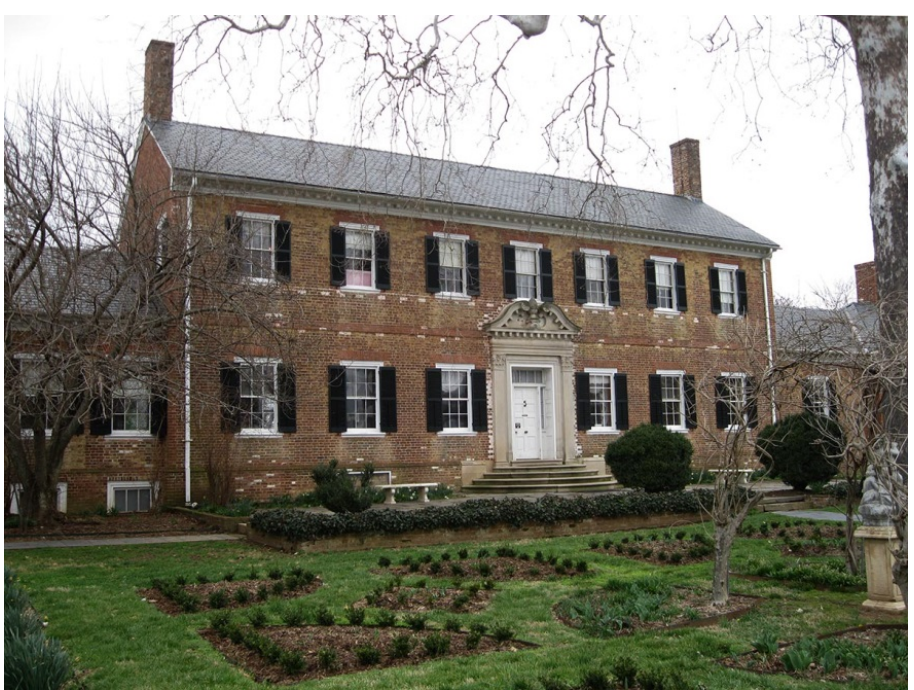
East façade of Chatham Manor