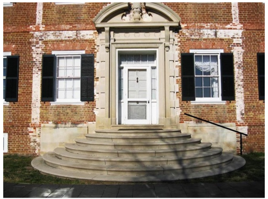
West entrance to Chatham Manor. Black lines to the right of the door represent proposed railing attached to the exterior wall.