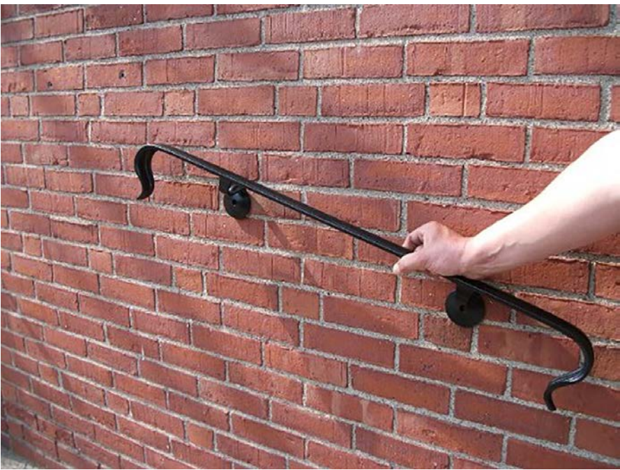
Example of a handrail similar to what is being proposed.