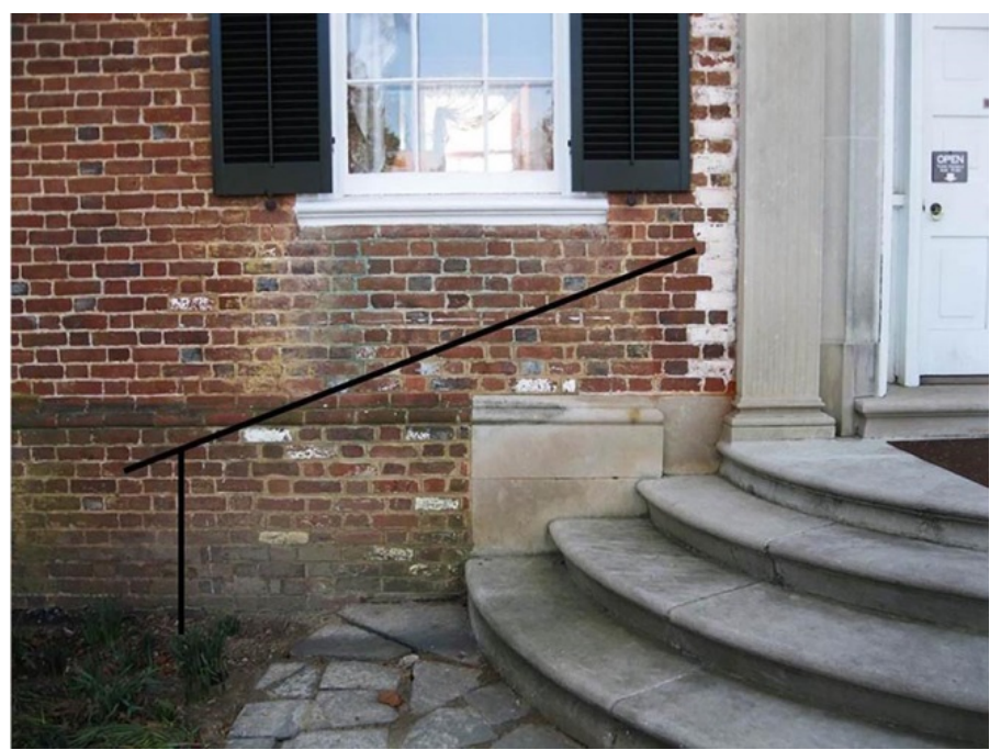
Close up of east entrance to Chatham Manor. Black lines to the left of the door represent proposed railing attached to the exterior wall.