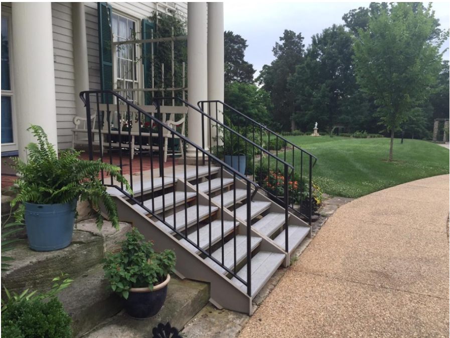
The removable slip-over steps in use at the Gari Melchers Home and Studio Belmont. This alternative would create additional safety concerns at Chatham Manor, plus it is not compatible with the elliptical steps at Chatham.