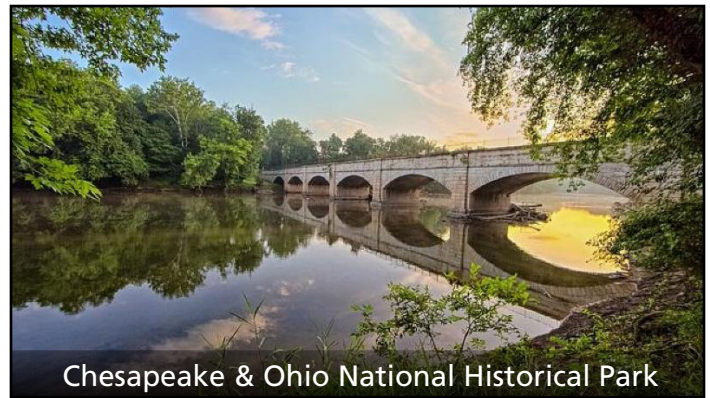
Chesapeake & Ohio National Historical Park