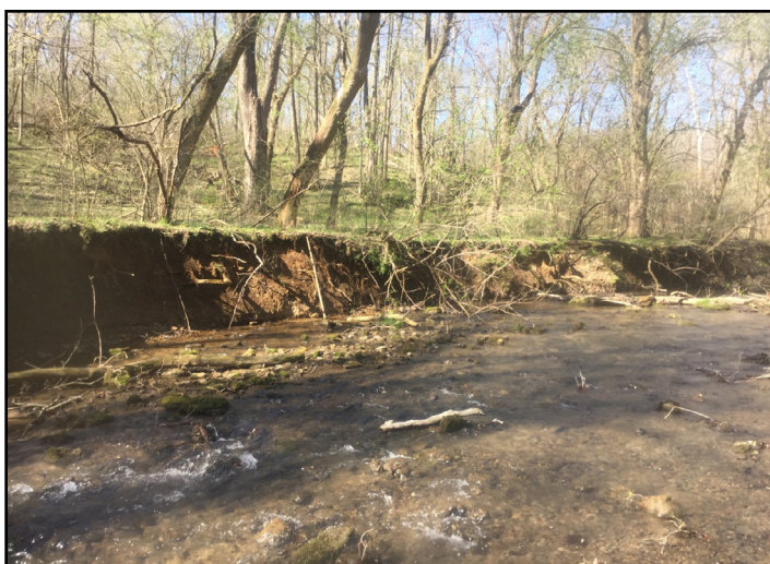
Streambank erosion restoration site proposed for stabilization at Harpers Ferry National Historical Park