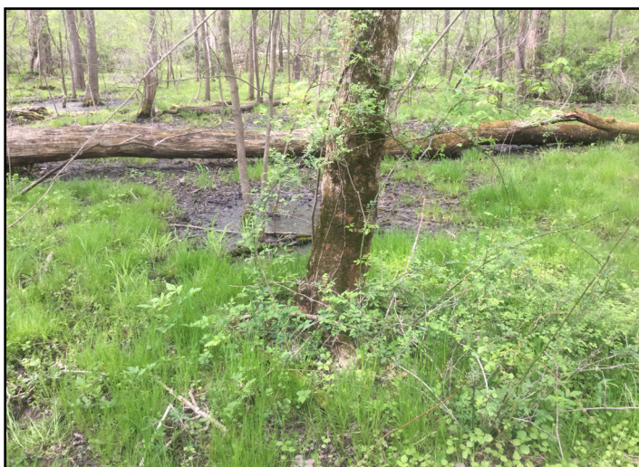
Potential wetland restoration site at C&O Canal National Historical Park currently dominated by invasive species