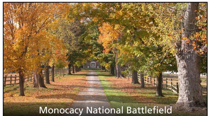
Monocacy National Battlefield