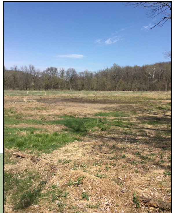
Potential wetland restoration site within Monocacy National Battlefield currently impacted from agricultural practices