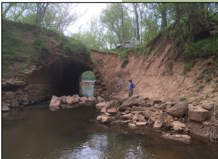
Potential streambank restoration site at C&O Canal National Historical Park