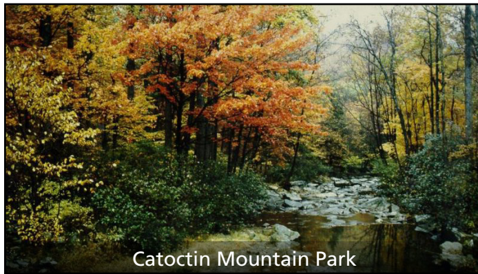
Catoctin Mountain Park

An Environmental Assessment is being prepared to evaluate potential impacts of the proposed project on the natural resources, cultural resources, and visitor experience at the four NCR parks, in accordance with National Environmental Policy Act.