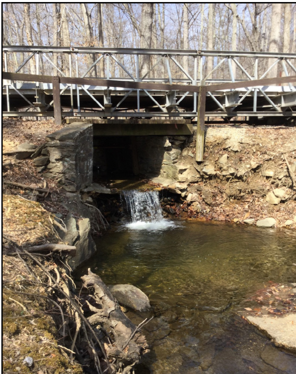
Potential fish passage stream restoration site near the Catoclin Mountain Park Visitor Center

The purpose of the WRAP is to provide a comprehensive approach to restoring, enhancing, and/or protecting wetlands, waterways, and stream habitats at the four NCR parks. The approach would prioritize specific areas within the parks and provide specific restoration actions for these areas to deal with degraded natural resource conditions or deficiencies.