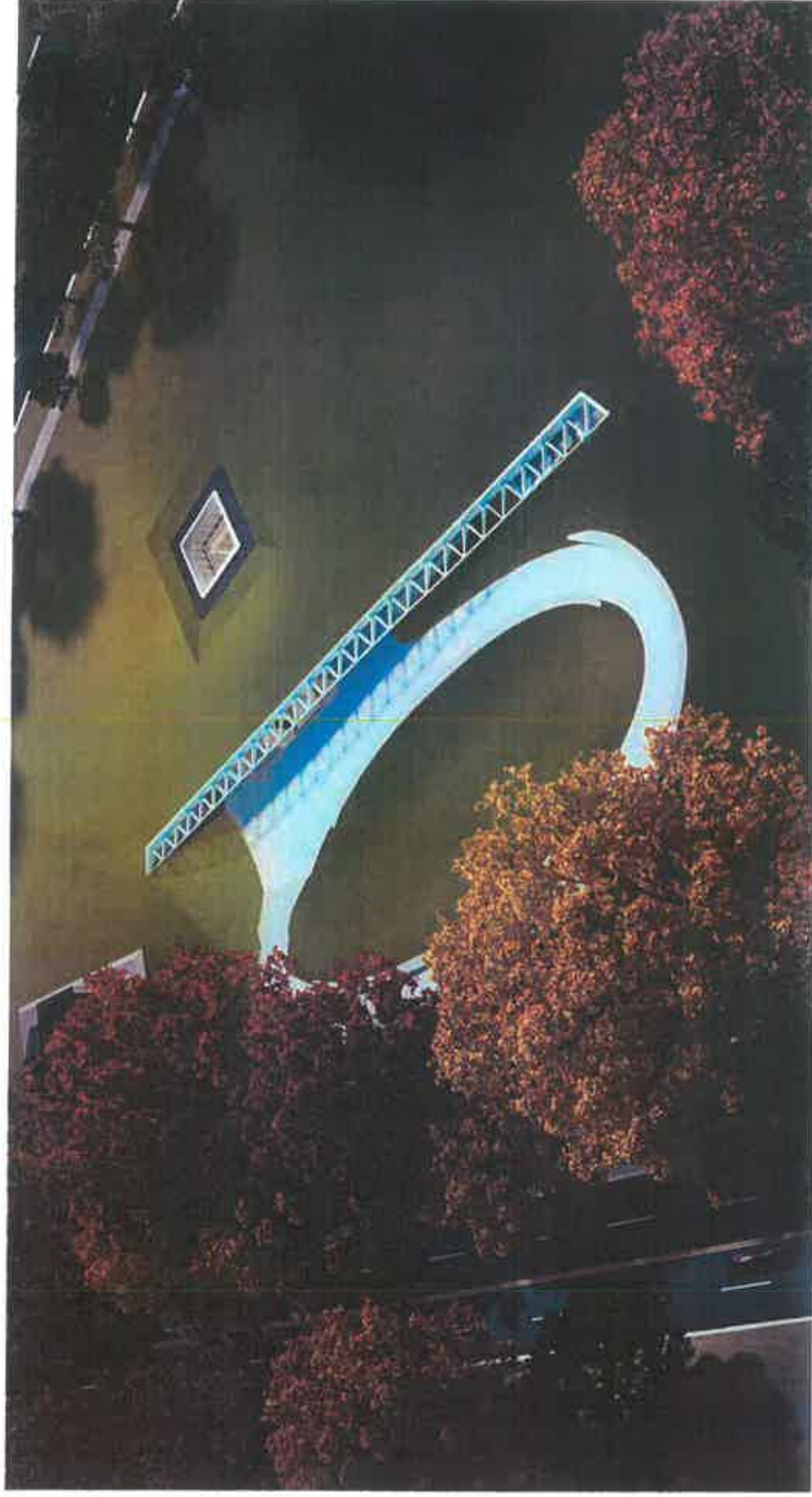
Education Center at The Wall ENNEAD ARCHITECTS 08.08.14