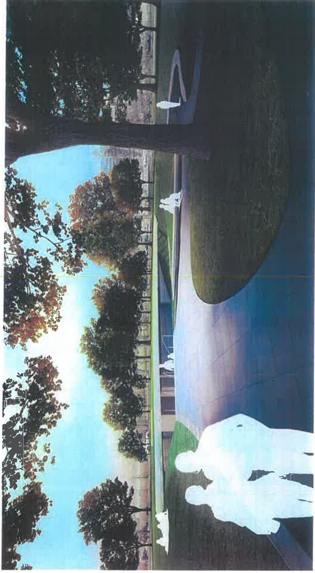
Education Center at The Wall ENHEAD ARCHITECTS 09.09.14