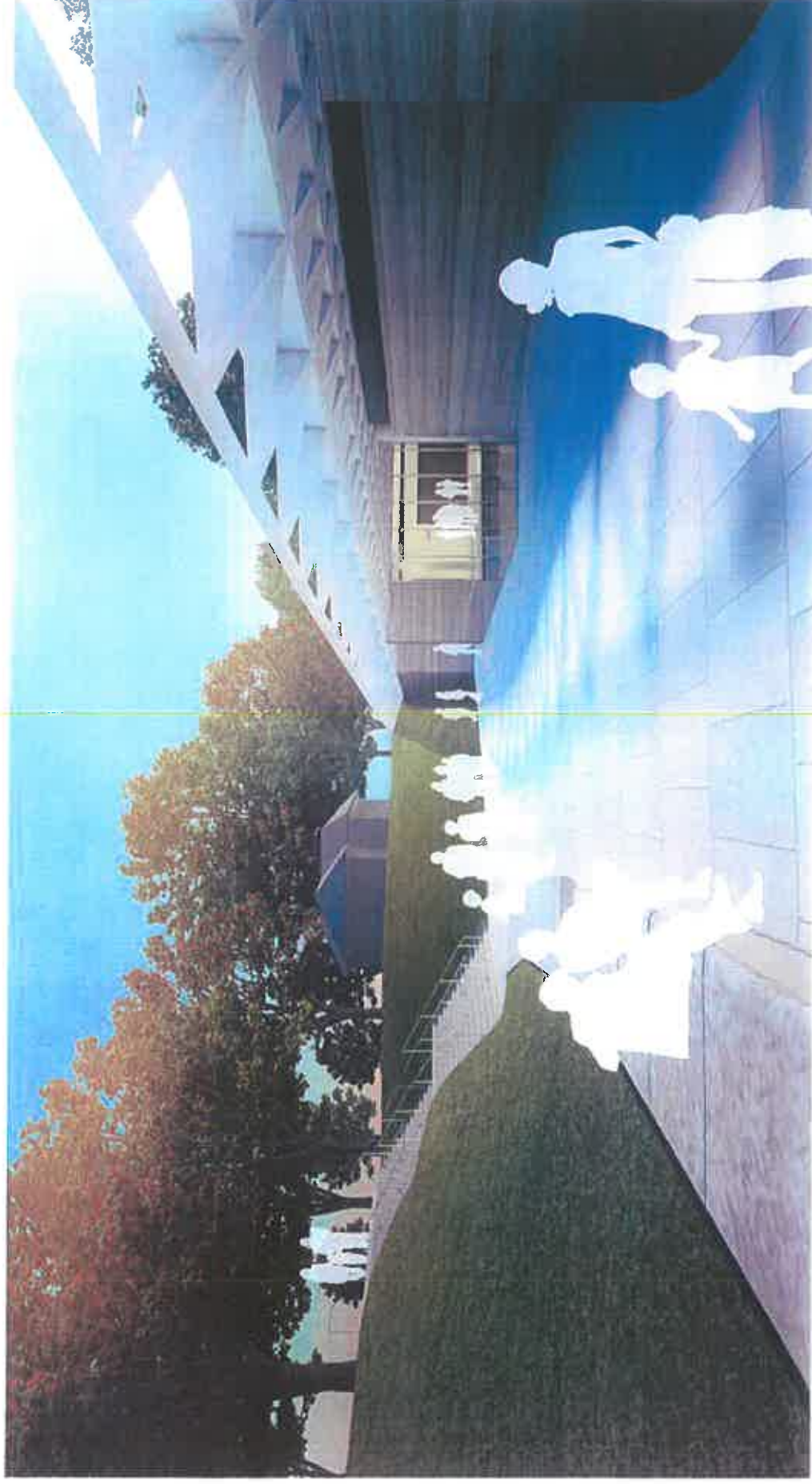
Education Center at The Walt Disney World © 2014