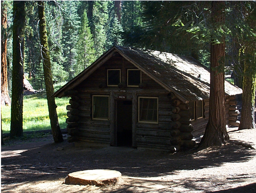
Photo 1 The Mariposa Grove Comfort Station, before Log Replacement and Repair