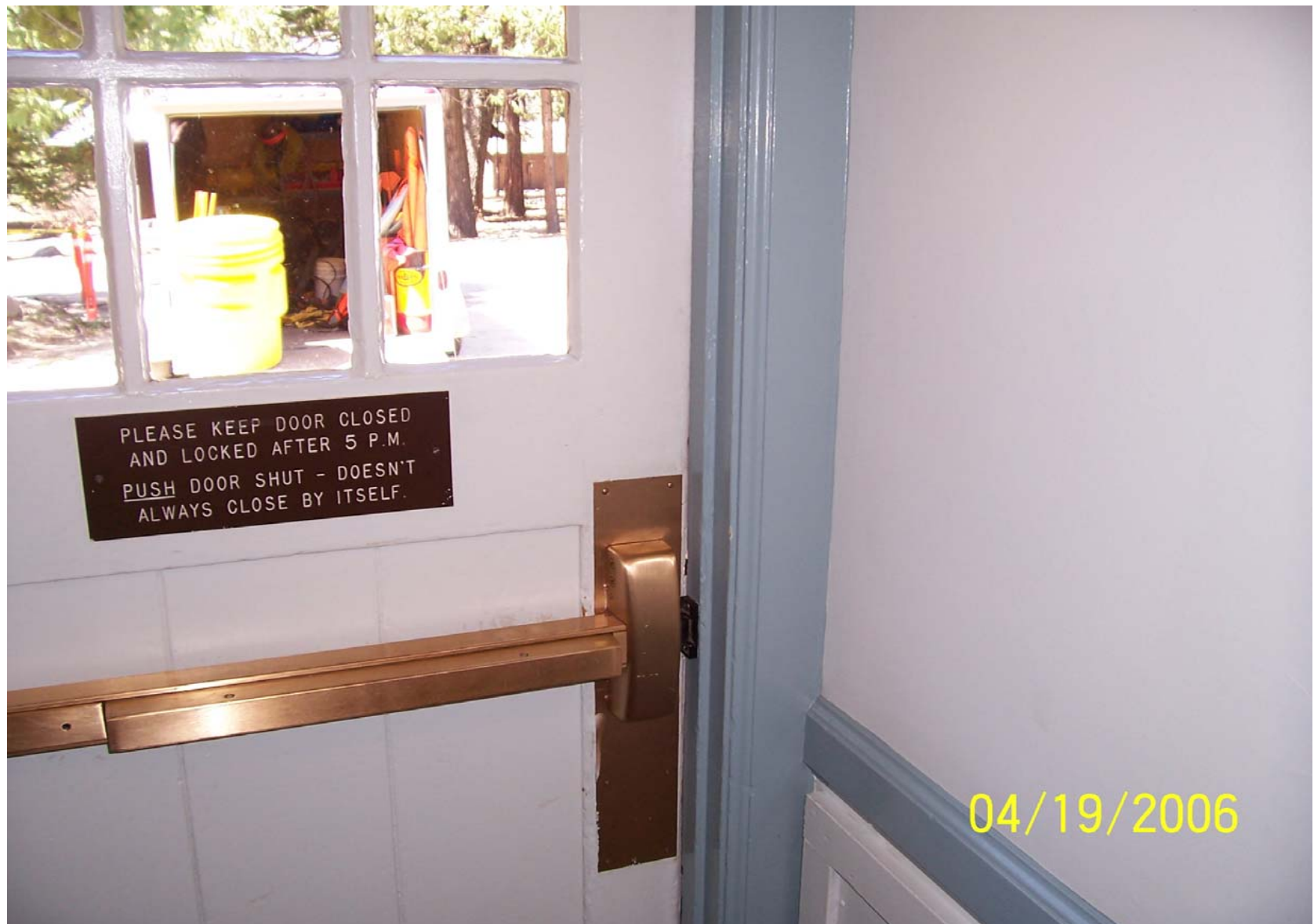
West Interior Door