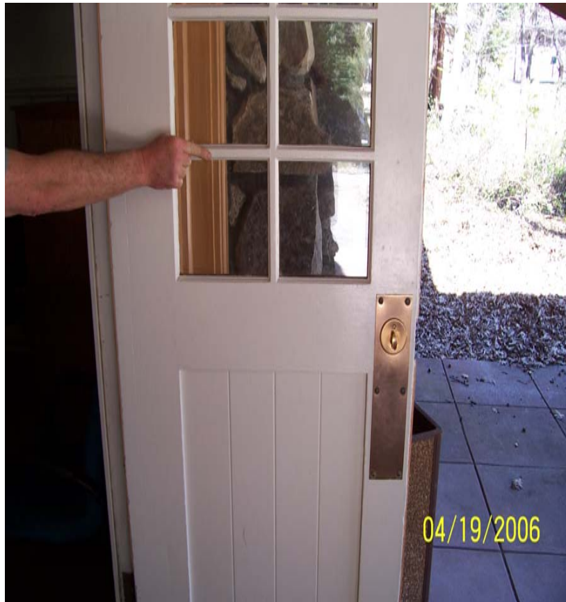
East Exterior Door