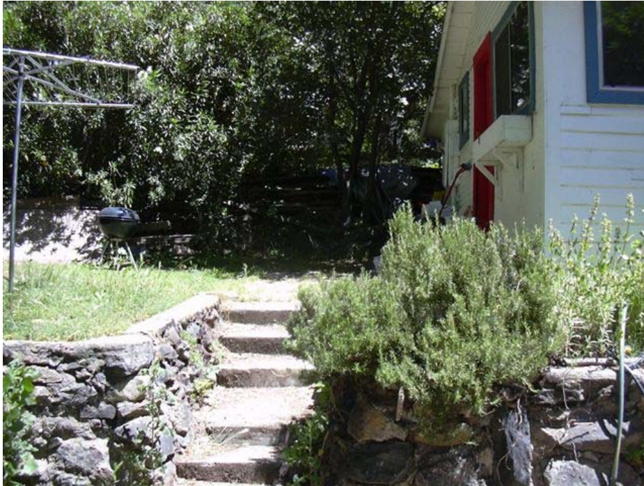
Photo 1 Area of proposed addition, west of existing residence (right side of photo; note steps and clothesline)