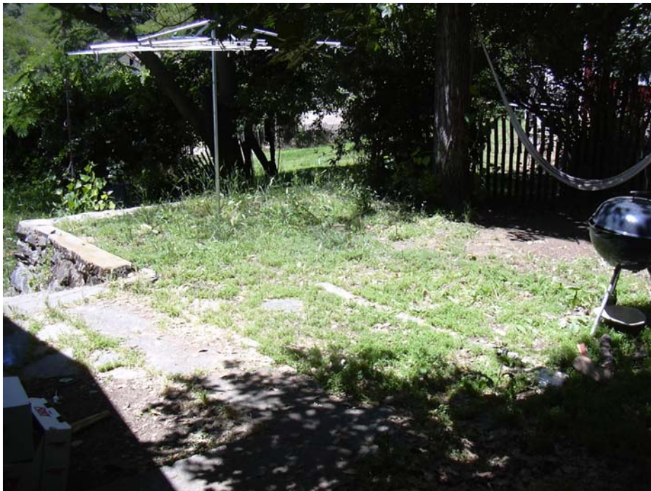
Photo 2 Area of proposed addition, with shadow of existing residence in lower left corner (note steps and clothesline)