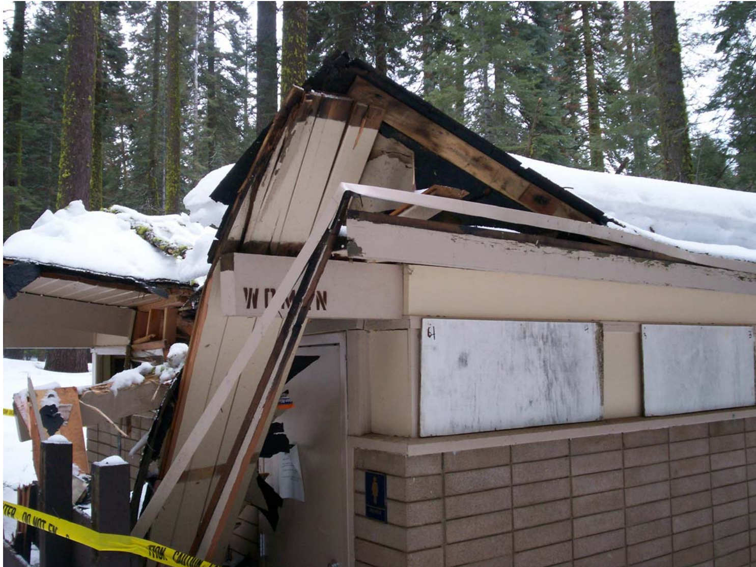
Photo 2 Damaged Restroom