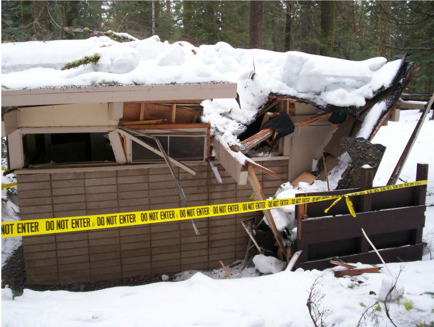
Photo 1 Damaged Restroom