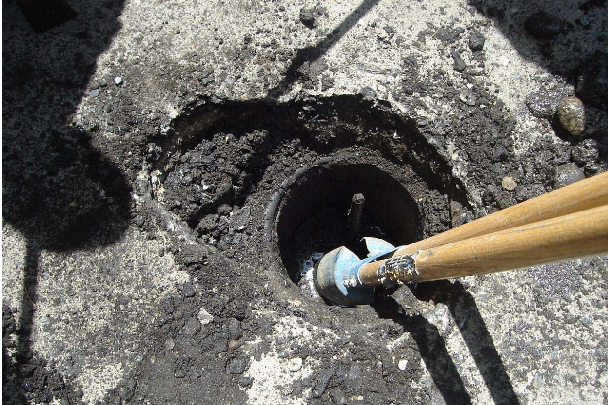
Photo 1 Removal of covering asphalt, showing abandoned hydraulic lift.