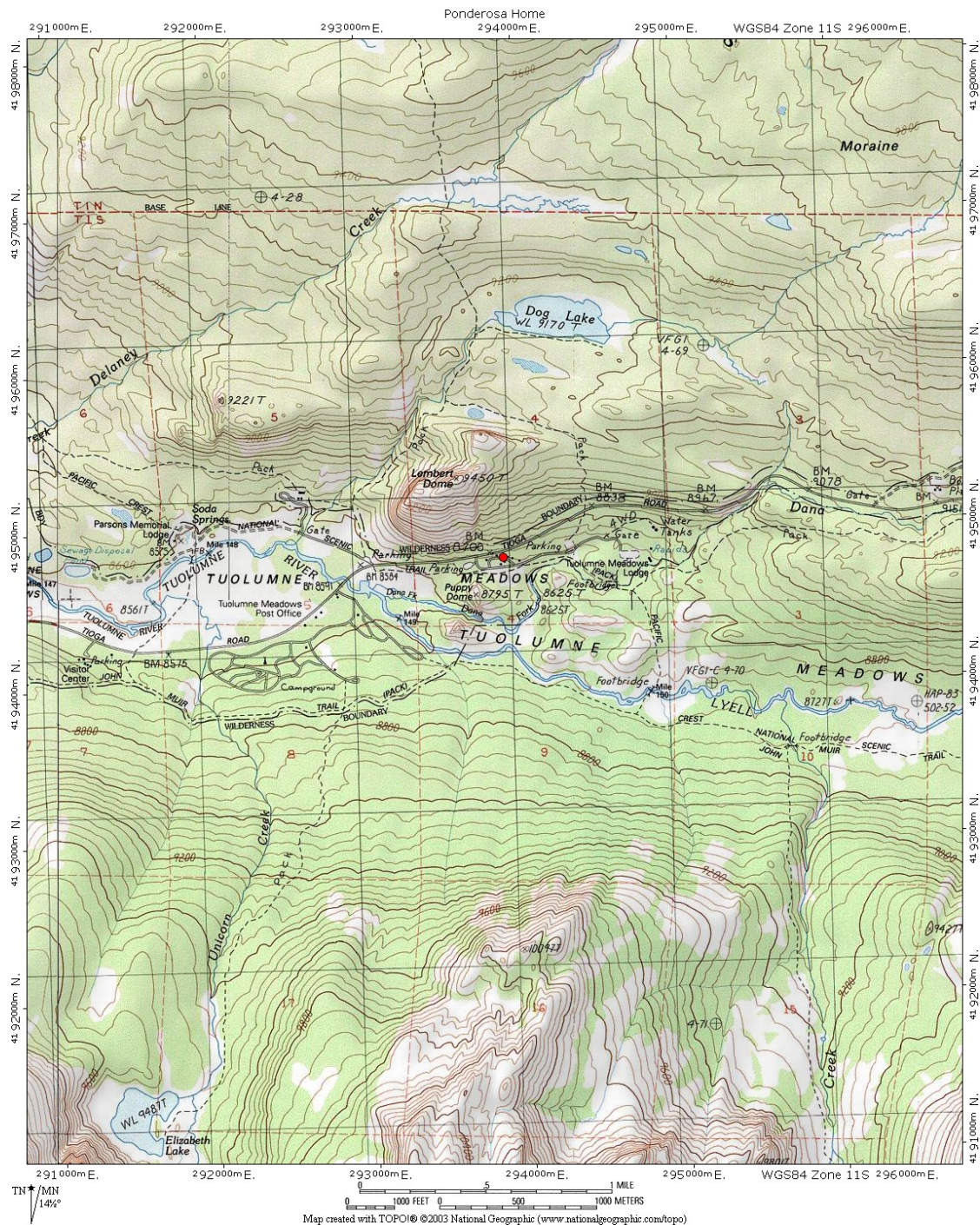
Map 1 - Tuolumne Meadows Vicinity