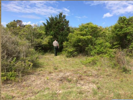
Location 1 400 feet to pond