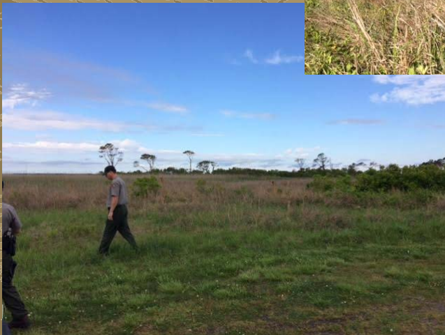
Location 3 200 feet to pond