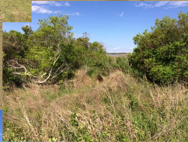
Location 2 175 feet to pond