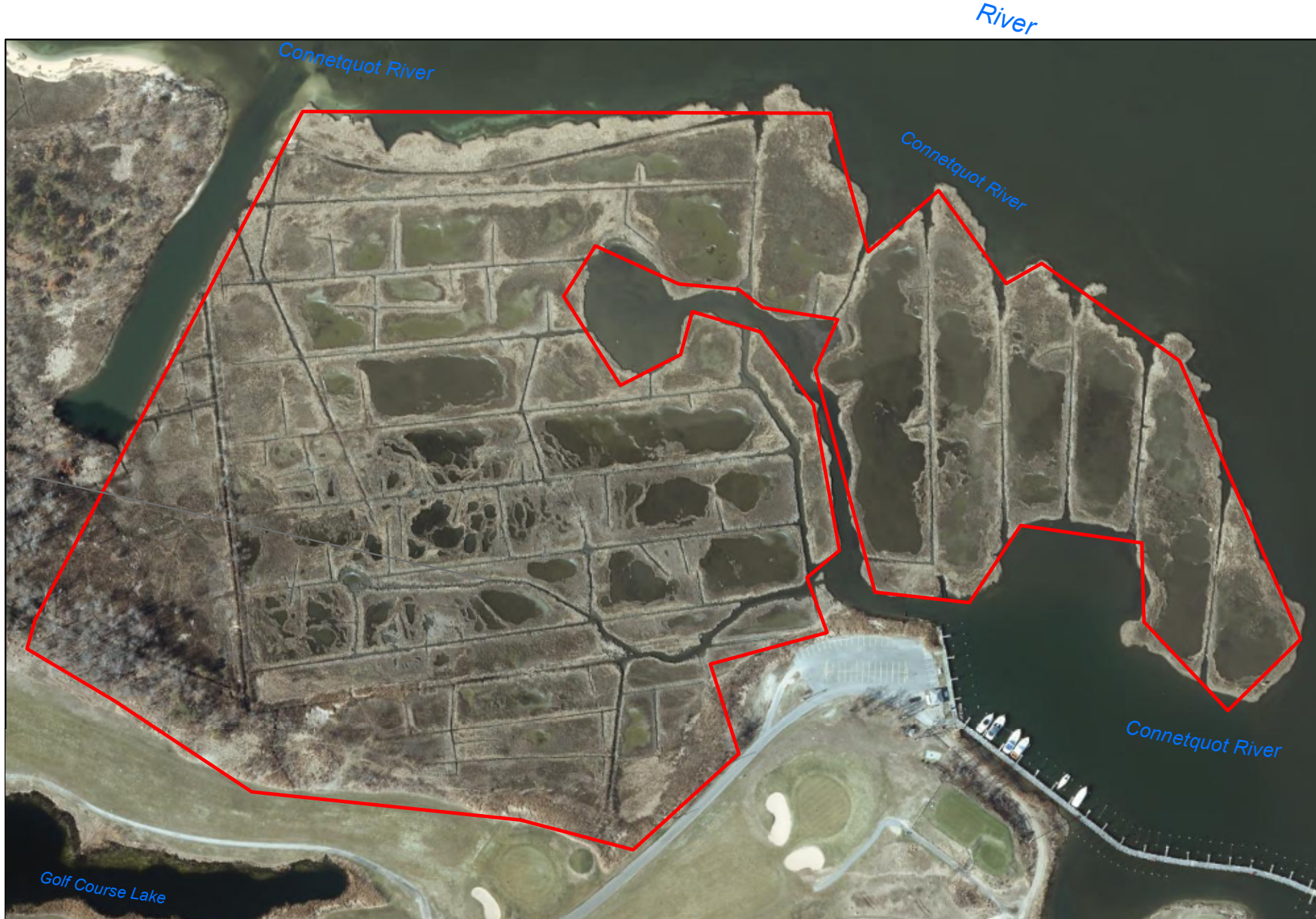
FIGURE TIMBER POINT AERIAL MAP

Scale: 1 inch = 200 feet