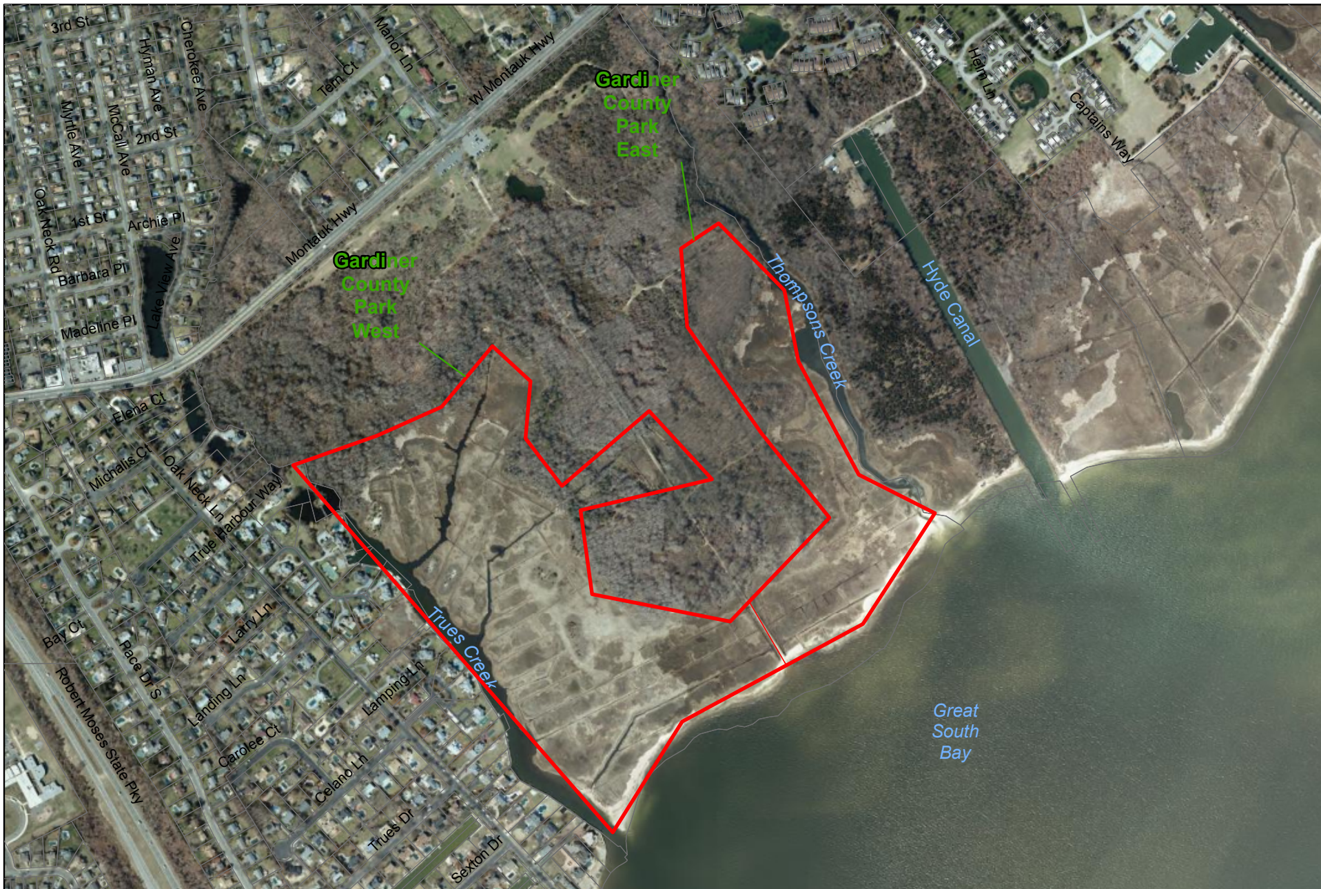
FIGURE GARDINER COUNTY PARK AERIAL MAP

Scale: 1 inch = 750 feet