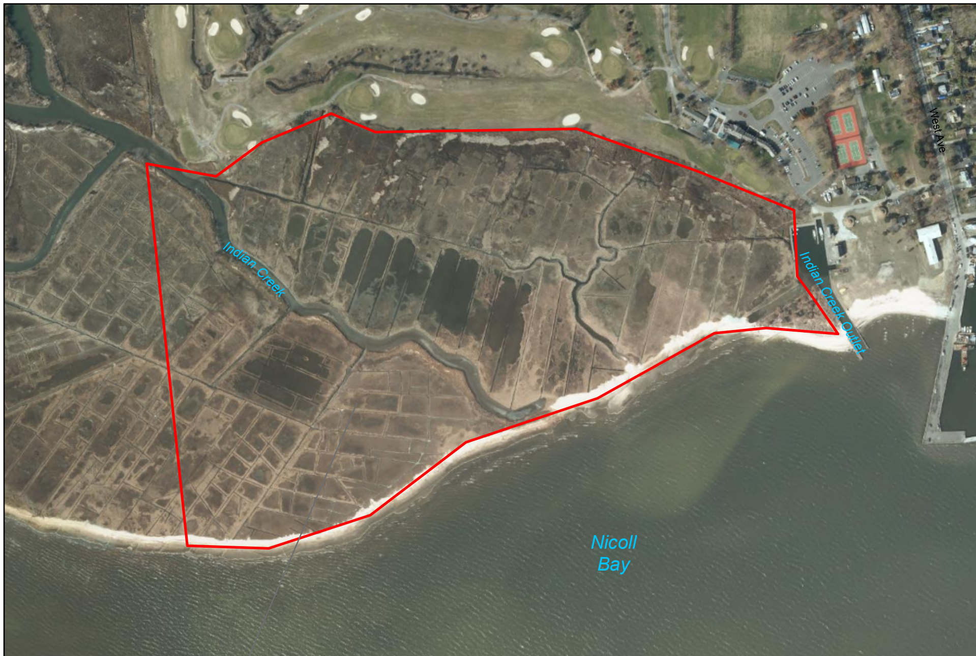
FIGURE WEST SAYVILLE AERIAL MAP

Scale: 1 inch = 400 feet