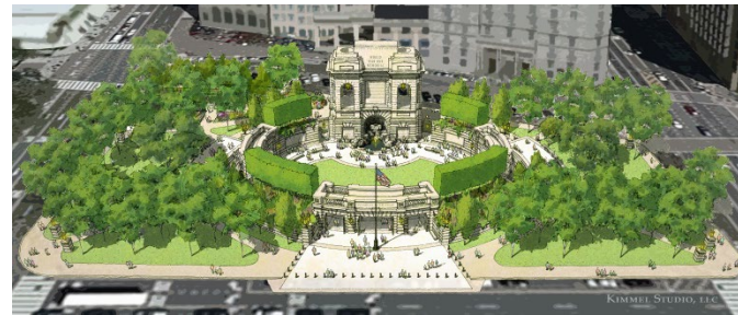
Figure 4: Grotto of Remembrance

The Grotto of Remembrance alternative would create a neoclassical commemorative ellipse at the center of the site ( Figure 4 ). Three entrance plazas would surround the east, west, and south edges of the ellipse. A granite tower with an arched grotto and reflecting pool with an eternal flame at its base would be located at the north edge of the ellipse. This alternative would alter the site in a way that would threaten Pershing Park's NRHP eligibility and would not provide the desired experience or program. Therefore, this alternative was dismissed from further consideration.