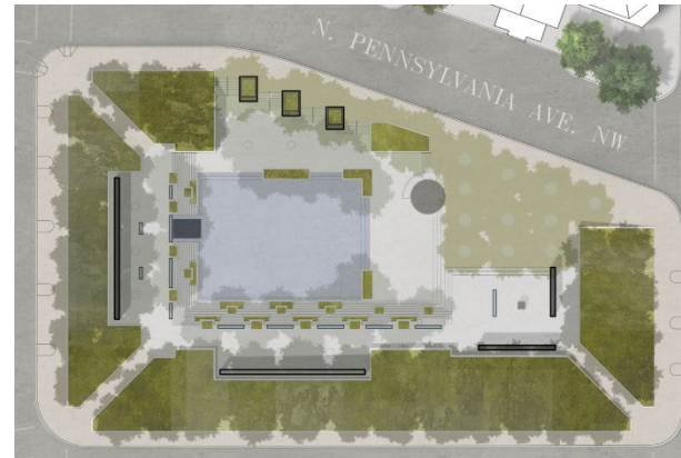
Figure 7: Upper Walkway