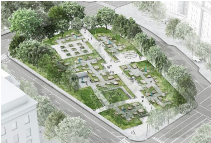
Figure 1: An American Family Portrait Wall in the Park

The An American Family Portrait Wall in the Park alternative would re-organize the site to a northwest-southeast axis, add large format photographs in framed cases across the site, and also place six large-scale statues across the site ( Figure 1 ). This alternative was dismissed from further consideration because it would alter the site in a way that would threaten Pershing Park's eligibility for listing in the NRHP, raised maintenance concerns, and would not provide the desired experience or program.