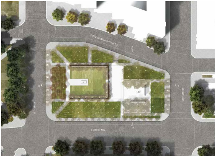
Figure 5: The Weight of Sacrifice

The Weight of Sacrifice would replace the existing cascade fountain and pool with a lawn featuring a central sculptural element, flanked on three sides with a bas relief wall ( Figure 5 ). The berms would be altered, and the General Pershing Commemorative Work would be reconfigured to align with new walkways. This alternative would alter the site in a way that would threaten Pershing Park's NRHP eligibility and would not provide the desired experience or program. Therefore, this alternative was dismissed from further consideration.