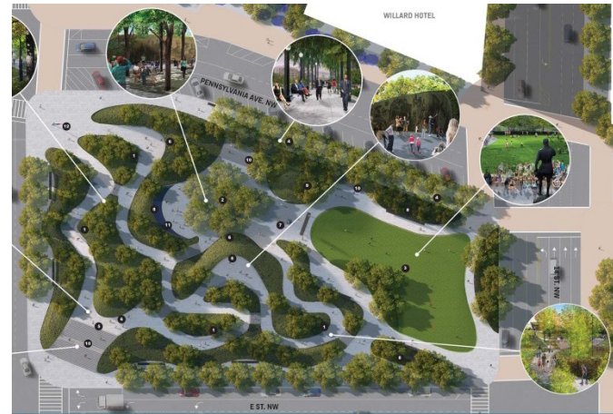
Figure 2: Heroes' Green

The Heroes' Green alternative would create meandering paths through landforms across the site creating several elevation changes, embed five surface walls with historic imagery in the landforms, add an open lawn and plaza, and create a memorial tree garden composed of 116 trees ( Figure 2 ). The alternative raised security and surveillance concerns, would alter the site in a way that would threaten Pershing Park's NRHP eligibility, and would not provide the desired experience or program. Therefore, this alternative was dismissed from further consideration.