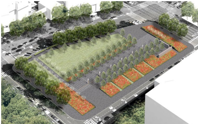
Figure 3: Plaza to a Forgotten War

The Plaza to a Forgotten War alternative would place a linear, east-west oriented plaza with inground fiber-optic lights and sculptural pillars supporting inscribed monoliths into the site ( Figure 3 ). Allees of trees would frame the plaza. A lawn bordered by trees would be located in the northern half of the site. This alternative was dismissed from further consideration because it would alter the site in a way that would threaten Pershing Park's NRHP eligibility and would not provide the desired experience or program.