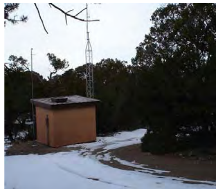
FIGURE 7. ADMINISTRATIVE ZONE

This zone is primarily to support management and administration of the park or other mandated activities such as the Closed Basin Project. This zone does not occur in wilderness.