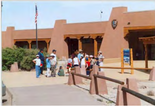
FIGURE 1. FRONT COUNTRY ZONE