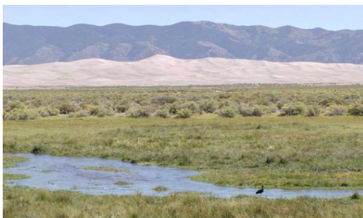
FIGURE 4. GUIDED LEARNING ZONE

Protecting sensitive resources is the focus of this zone. Learning about these resources is important and protection is provided by guiding or escorting visitors. This zone occurs in wilderness or nonwilderness.