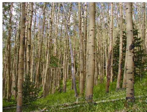
FIGURE 6. NATURAL / WILD ZONE

This is the wildest zone. It protects natural resources and provides opportunities for physical challenge, adventure, and solitude. This zone occurs in wilderness or nonwilderness.