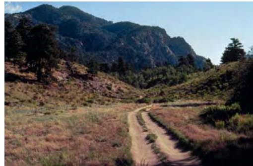
FIGURE 3. BACKCOUNTRY ACCESS ZONE

This zone provides access to backcountry adventure or natural/wild zones by providing vehicle travel routes and/or trailheads. This zone does not occur in wilderness.