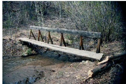
FIGURE 5. BACKCOUNTRY ADVENTURE ZONE

campsites defined, water bars and privies installed) to protect resources from negative impacts. Resources may be manipulated when necessary to restore damaged areas, to preserve or maintain cultural resources, or to direct visitor use to avoid resource impacts. Alterations are designed to blend with the natural landscape.