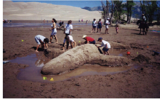
FIGURE 2. DUNES PLAY ZONE

These are natural areas for visitor enjoyment of the dunes and Medano Creek, two of the park's prime resources. This zone occurs primarily in wilderness.