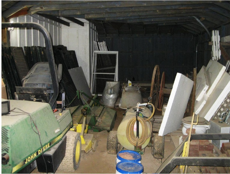
Interior of the “boathouse” section of the Carriage House and Stable – currently used for storage, the space will be cleared and the two compressor units will be installed in this area