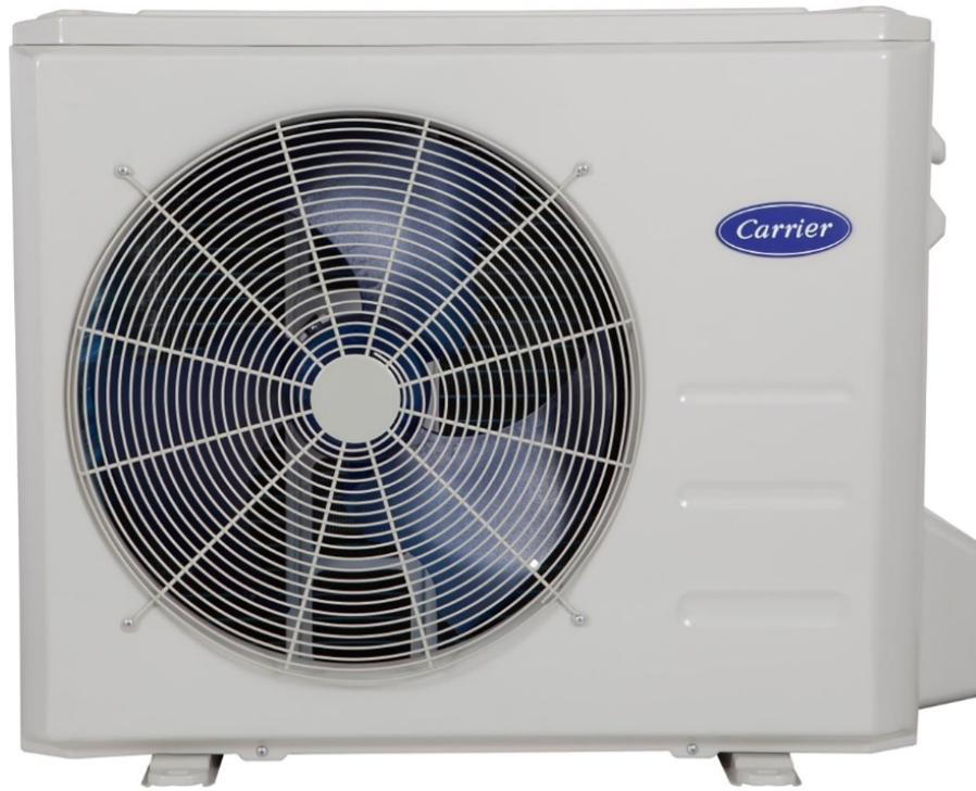
Example of the compressor unit