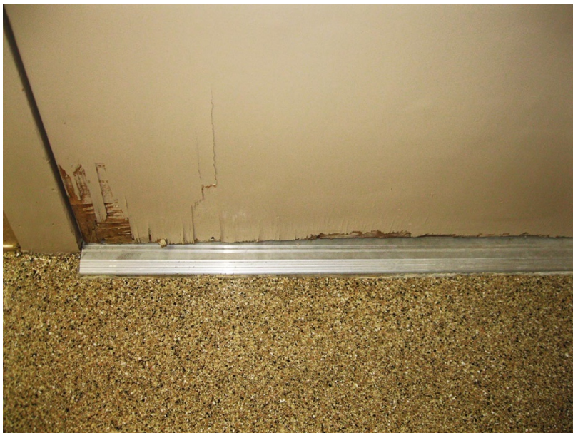
Visible damage to the bottom of the door for the public Men's Restroom – will be replaced with a metal door