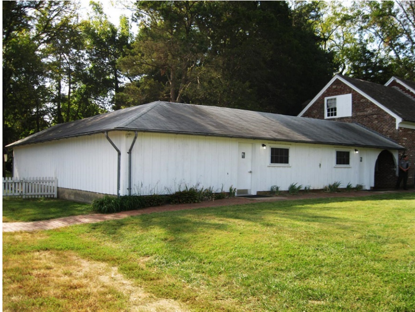
Chatham Carriage House and Stable – converted to public restrooms in 1981