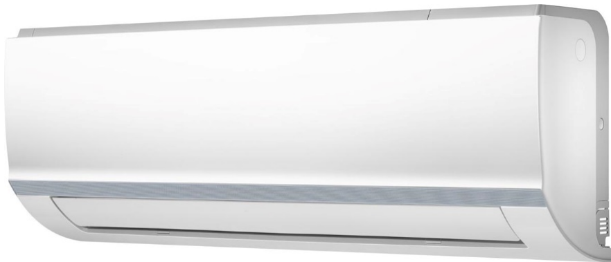
Example of the wall mounted HVAC head/fan coil unit

The openings of the “boathouse” section of the Carriage House and Stables are covered with slats, which will allow for air circulation – the compressor units will be hidden from view inside the structure