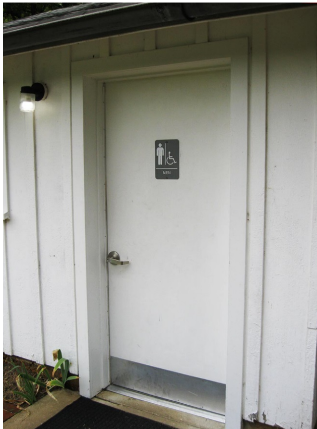
Door for public Men's Restroom – will be replaced with a metal door