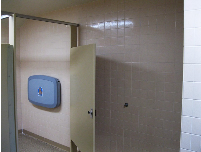
Interior wall of the public Men's Restroom – head/fan coil until will be mounted on the wall