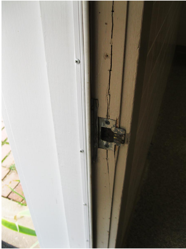
Visible damage to the door frame of the public Men's Restroom