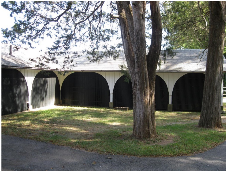
Exterior view of the “boathouse” section of the Carriage House and Stable – the compressor units will be hidden from view inside the structure