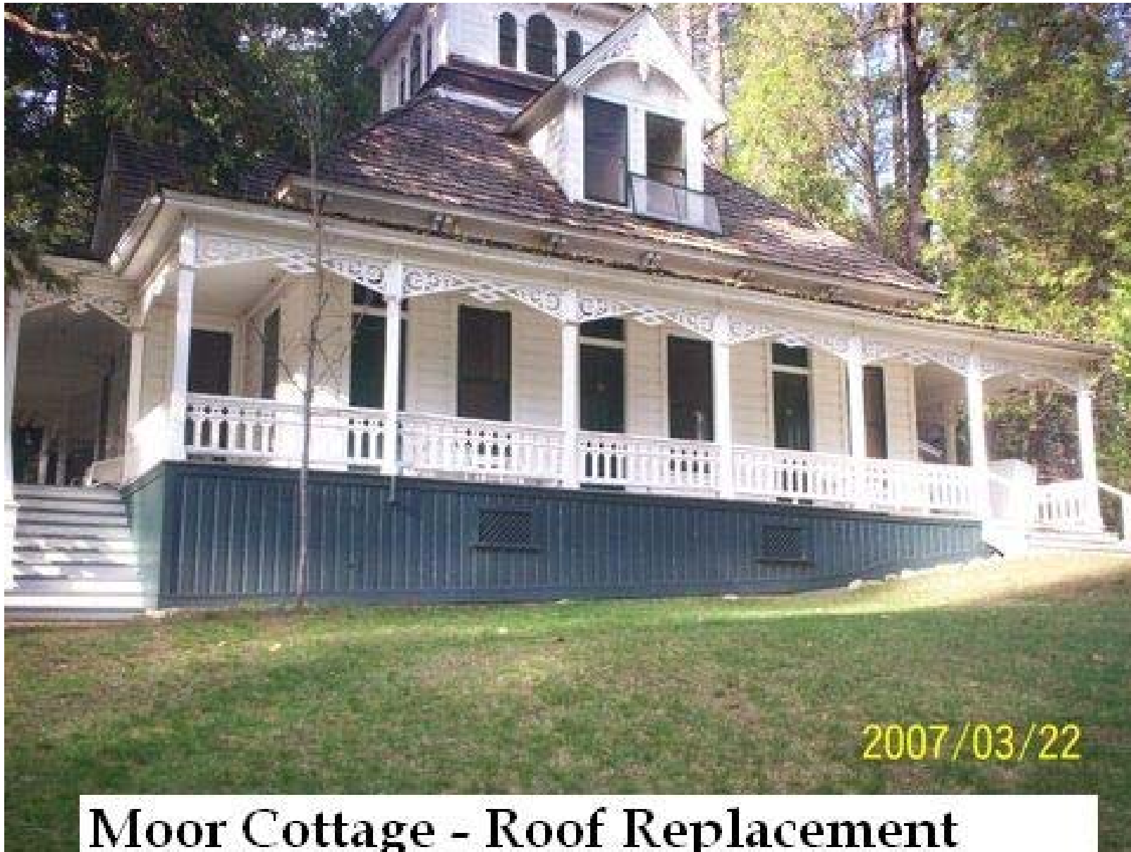
Moor Cottage - Roof Replacement