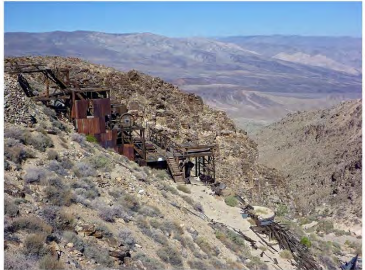
Figure 1 – Remaining structures at the Site

Skidoo Historic District is listed on the National Register of Historic Places and is a popular visitor destination. The tanks, mercury tables, and a large portion of the mill operations are well preserved and visible.