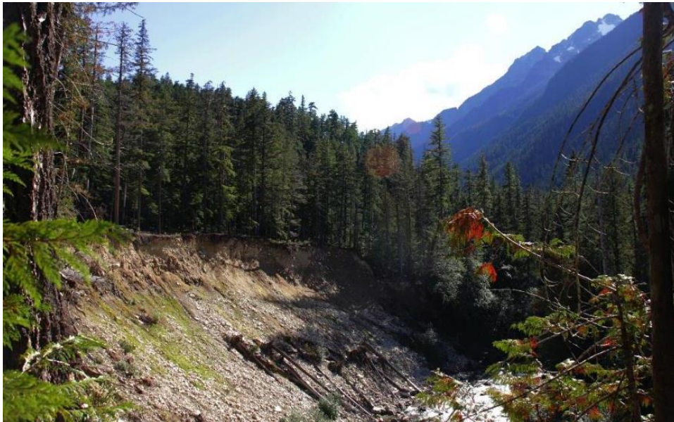
Figure 2. Photo showing the eroding bluff above Thunder Creek in the vicinity of the McAllister camps. The trail follows the edge of the bluff on the middle left side of the photo.

Recreation along Thunder Creek Trail and camping within the designated camps is increasing in popularity. All camps in lower Thunder Creek have seen year-over-year increases in recreational use. From 2007 to 2017 backcountry overnight use along Thunder Creek increased from 430 to 1,100 visitor use nights per year at McAllister Hiker Camp, an increase of 155%. The NPS Trail Crew often occupies McAllister and Junction Stock camps when conducting annual trail maintenance work, often for weeks at a time. This results in competition with the public for camp space in the valley.