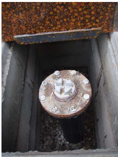
View of water valve interior of vault box