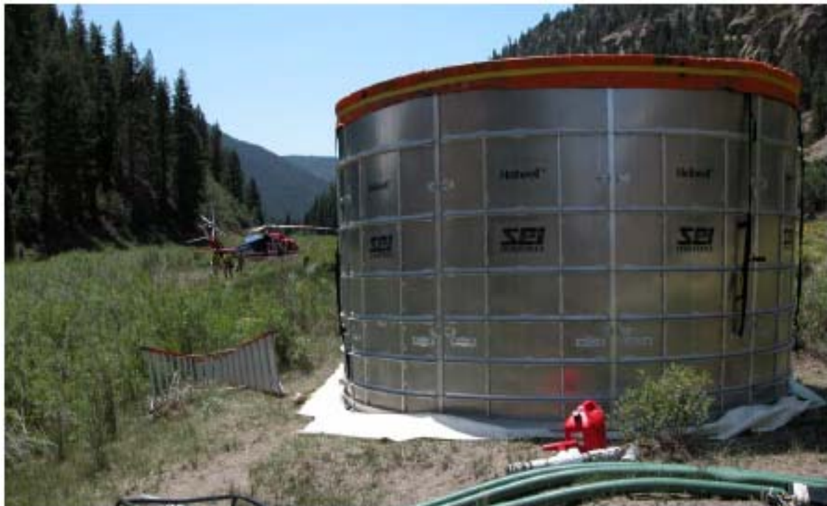
Example of Helliwell Tank