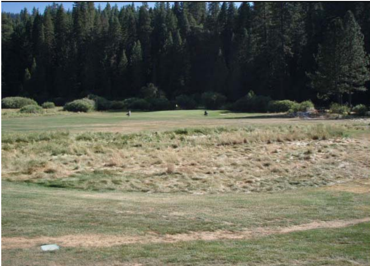
Proposed Tank Location