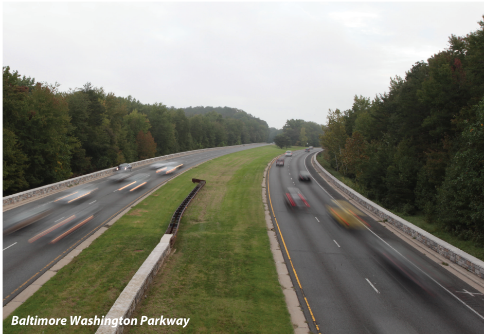
Baltimore Washington Parkway