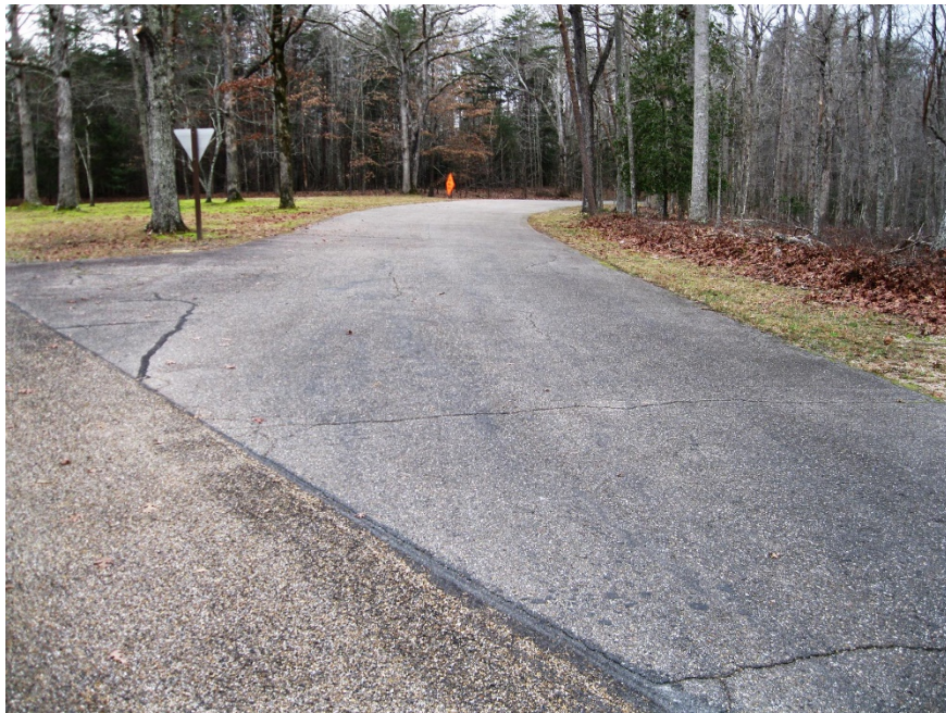
Slocum Drive on the Chancellorsville Battlefield. The majority of Slum Drive already has a chip seal/micro surfacing overlay, but this small stretch that connects with Stuart Drive is currently paved with asphalt. This small stretch of road will receive a chip seal/micro surfacing overlay