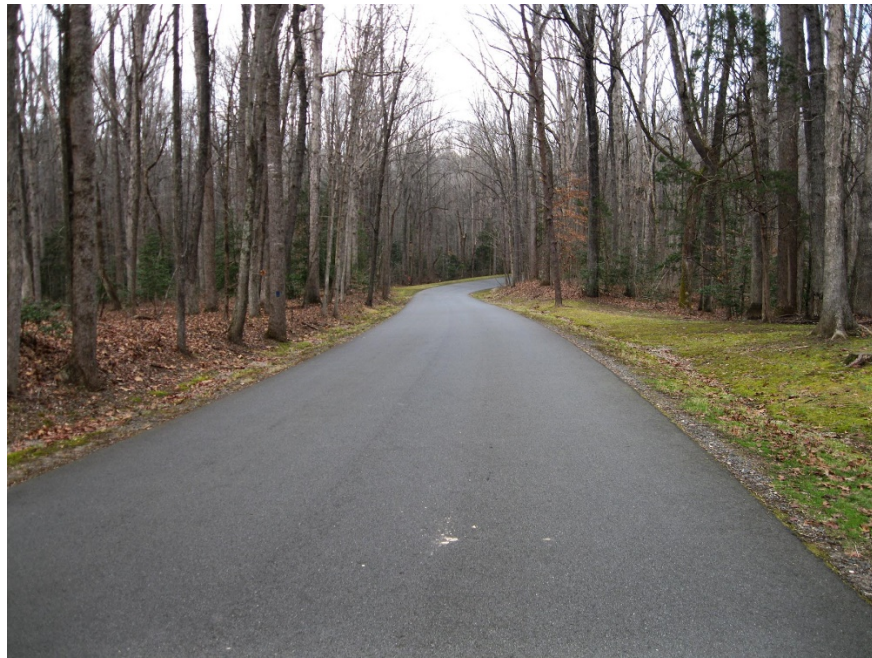
Grant Drive on the Spotsylvania Battlefield. Currently paved with asphalt, the road will receive a chip seal/micro surfacing overlay