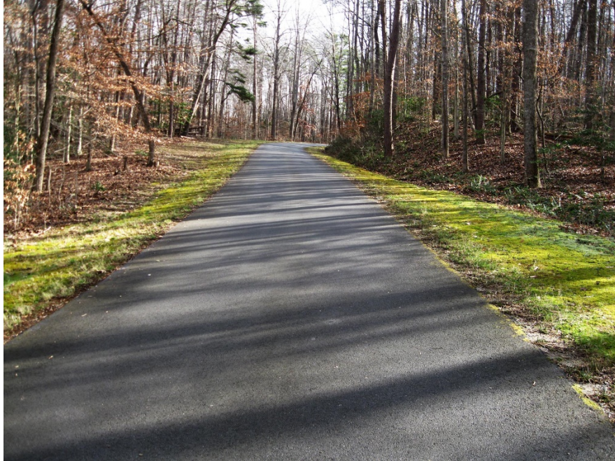
Burnside Drive on the Spotsylvania Battlefield. Currently paved with asphalt, the road will receive a chip seal/micro surfacing overlay