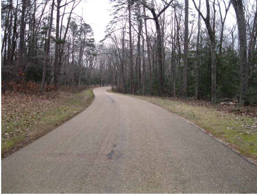
Hill-Ewell Drive on the Wilderness Battlefield. The road currently has a chip seal/micro surfacing overlay. That overlay will be retained and rehabbed.