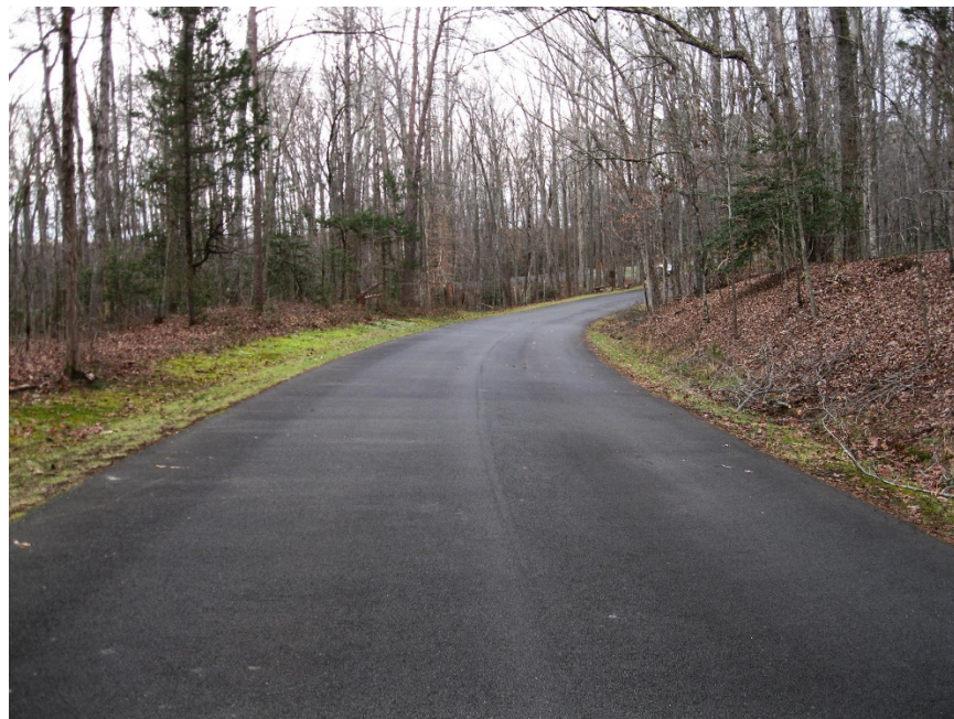
Berry-Paxton Drive on the Chancellorsville Battlefield. Currently paved with asphalt, the road will receive a chip seal/micro surfacing overlay