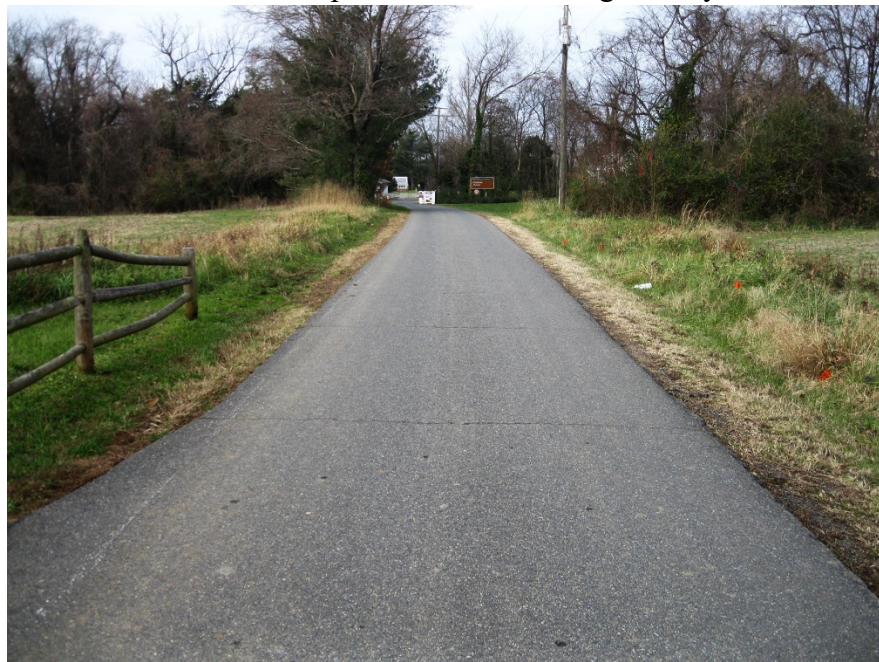
Chatham Lane at Chatham Manor. Currently paved with asphalt, the road will receive a chip seal/micro surfacing overlay