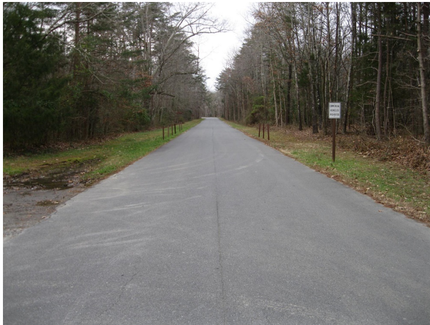
Furnace Road on the Chancellorsville Battlefield. Currently paved with asphalt, the road will receive a chip seal/micro surfacing overlay