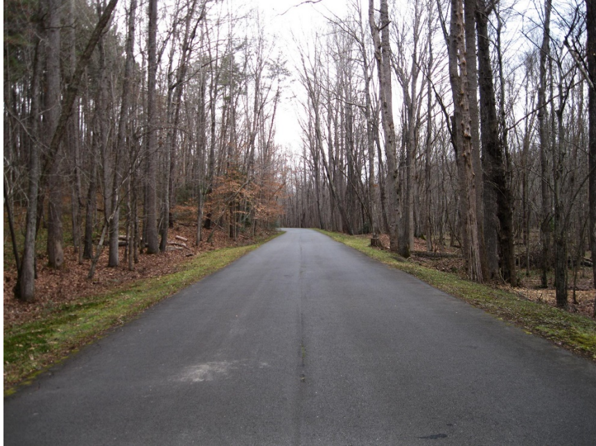
Sickles Drive on the Chancellorsville Battlefield. Currently paved with asphalt, the road will receive a chip seal/micro surfacing overlay