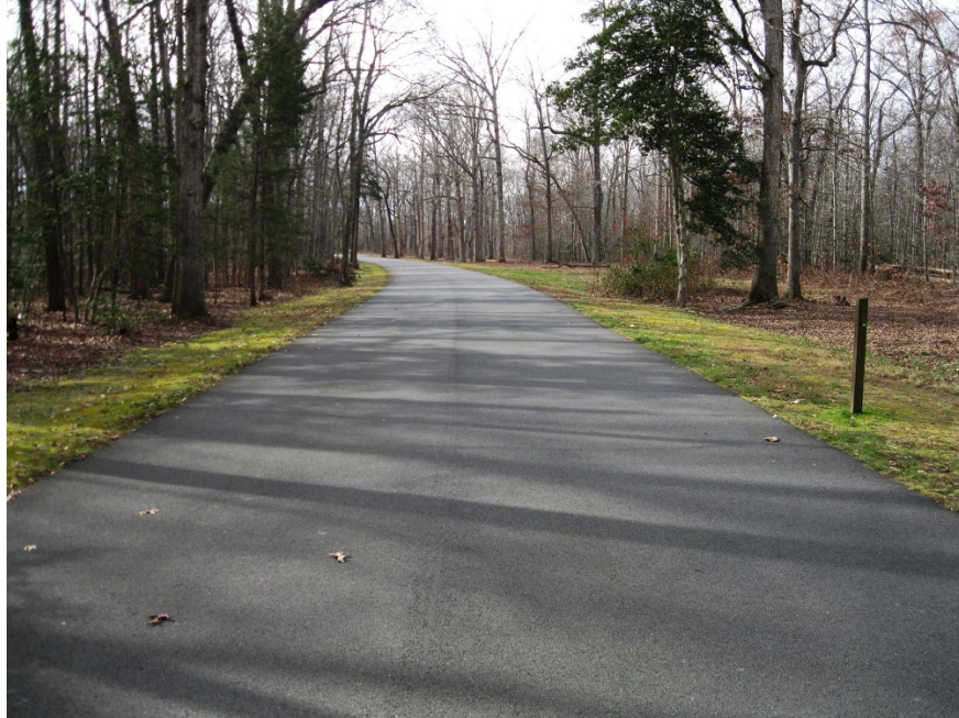
Anderson Drive on the Spotsylvania Battlefield. Currently paved with asphalt, the road will receive a chip seal/micro surfacing overlay