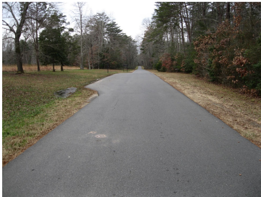
Bullock Road on the Chancellorsville Battlefield. Currently paved with asphalt, the road will receive a chip seal/micro surfacing overlay