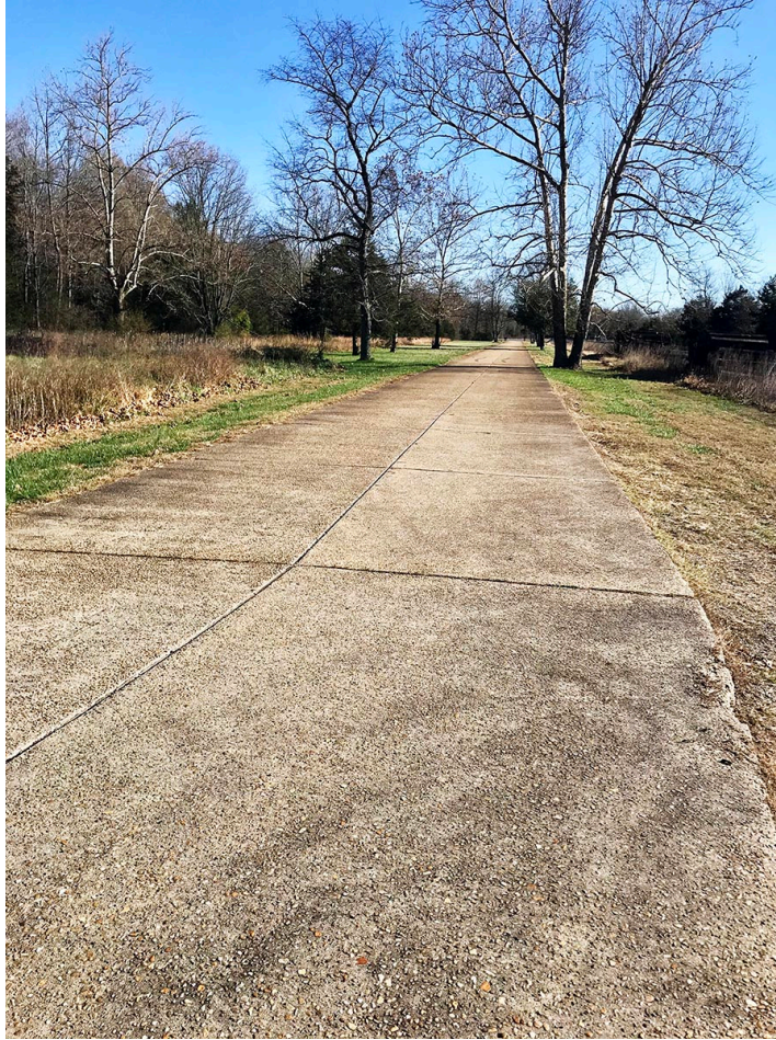
Entrance Road at the Stonewall Jackson Death Site. The existing exposed aggregate surface will be rehabbed by having the existing joint filler between the panels removed, the joints cleaned of dirt and loose debris, backer rods installed and the joints filled with an elastomeric sealant.