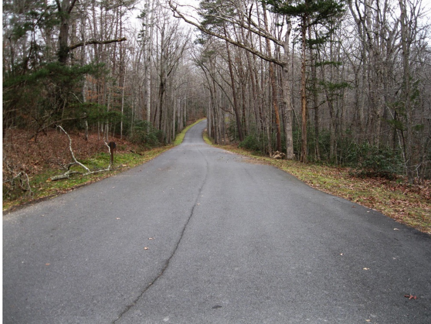
Stuart Drive on the Chancellorsville Battlefield. Currently paved with asphalt, the road will receive a chip seal/micro surfacing overlay