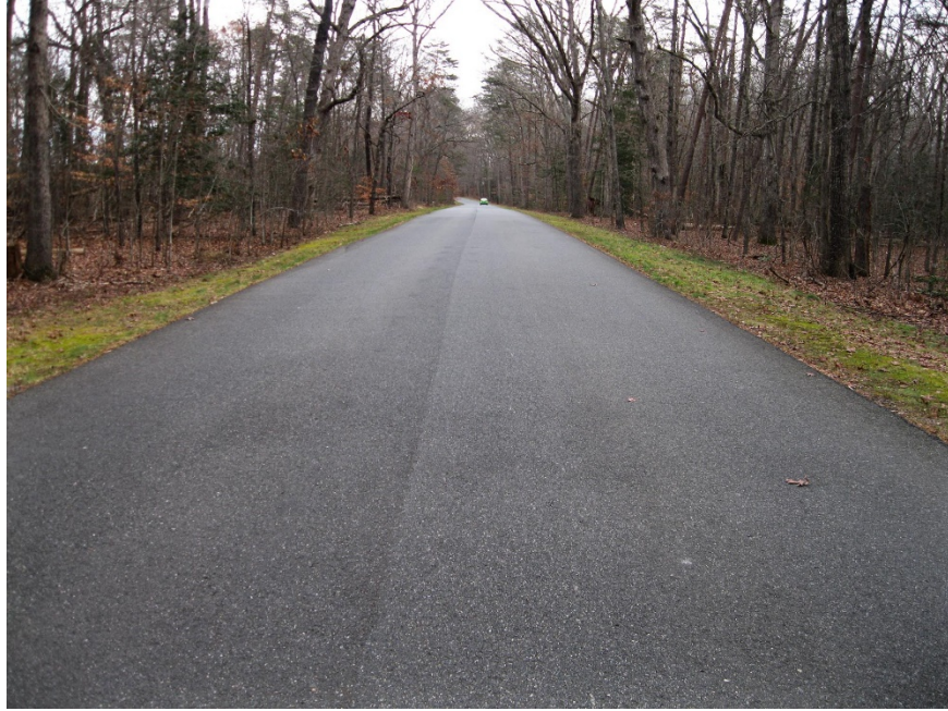
McLaws Drive on the Chancellorsville Battlefield. Currently paved with asphalt, the road will receive a chip seal/micro surfacing overlay