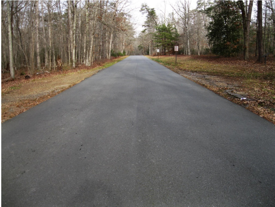
Hooker Drive on the Chancellorsville Battlefield. Currently paved with asphalt, the road will receive a chip seal/micro surfacing overlay