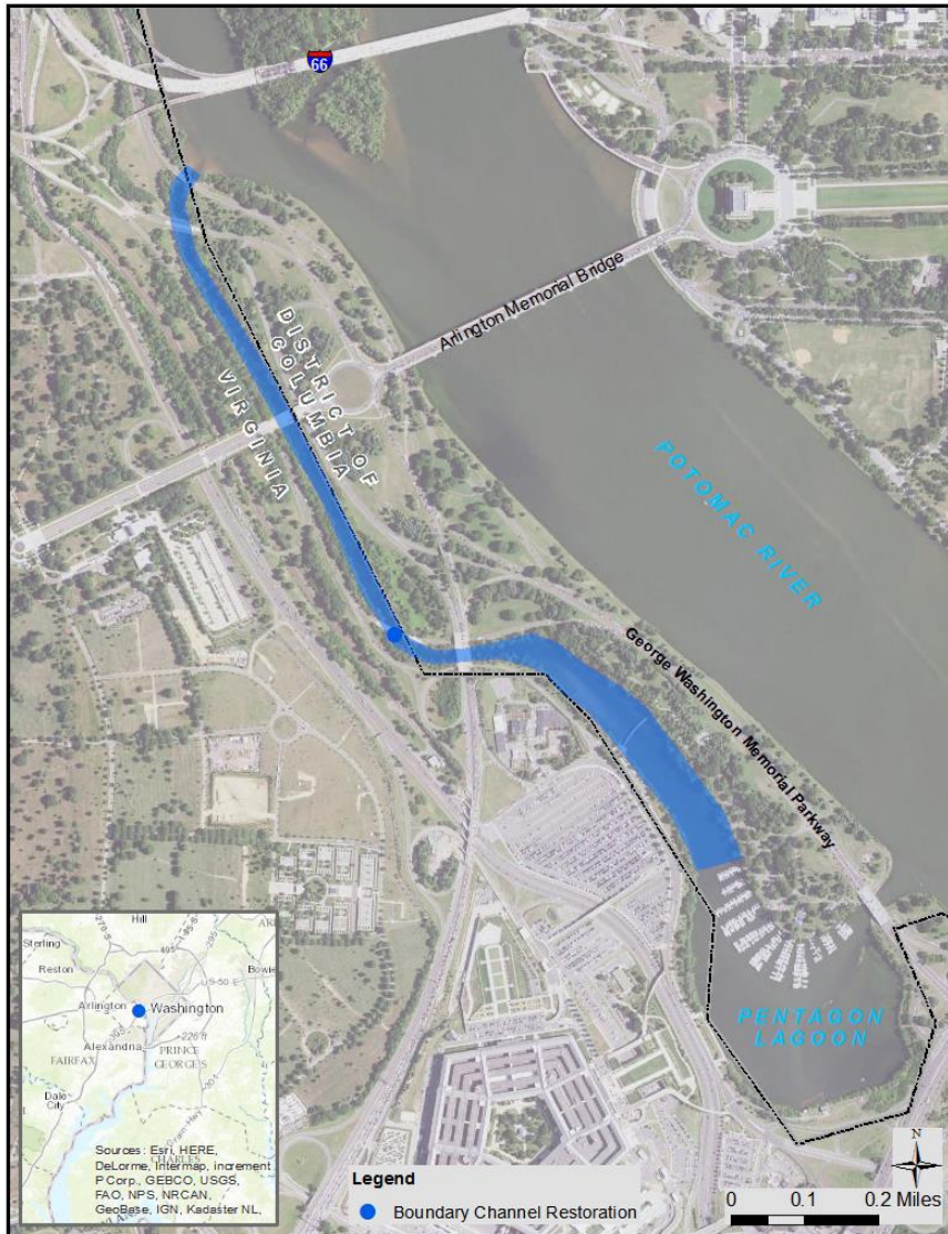
Figure 2. Location of Potomac River Boundary Channel Restoration Project Arlington, Virginia (DARP/ECA October 2018).

A settlement agreement reached on October 4, 2018, among the Trustees and the parties responsible for the spill, resolved claims for resource damages. The settlement included a total payment of $376,532 to the Trustees for the following: $156,500 for the Boundary Channel Restoration Project, $170,032 for O&M of the stormwater outfall trash cage, and $50,000 for administrative costs associated with restoration planning, implementation, and monitoring.