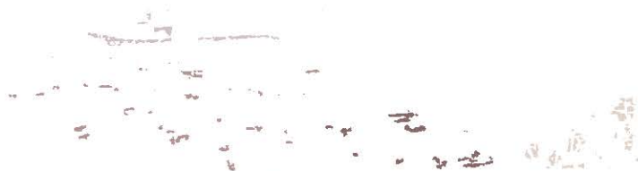
Photo 15: Hawksnest Beach Rooms (Rooms 106-109, 118-121), Photo by TJC