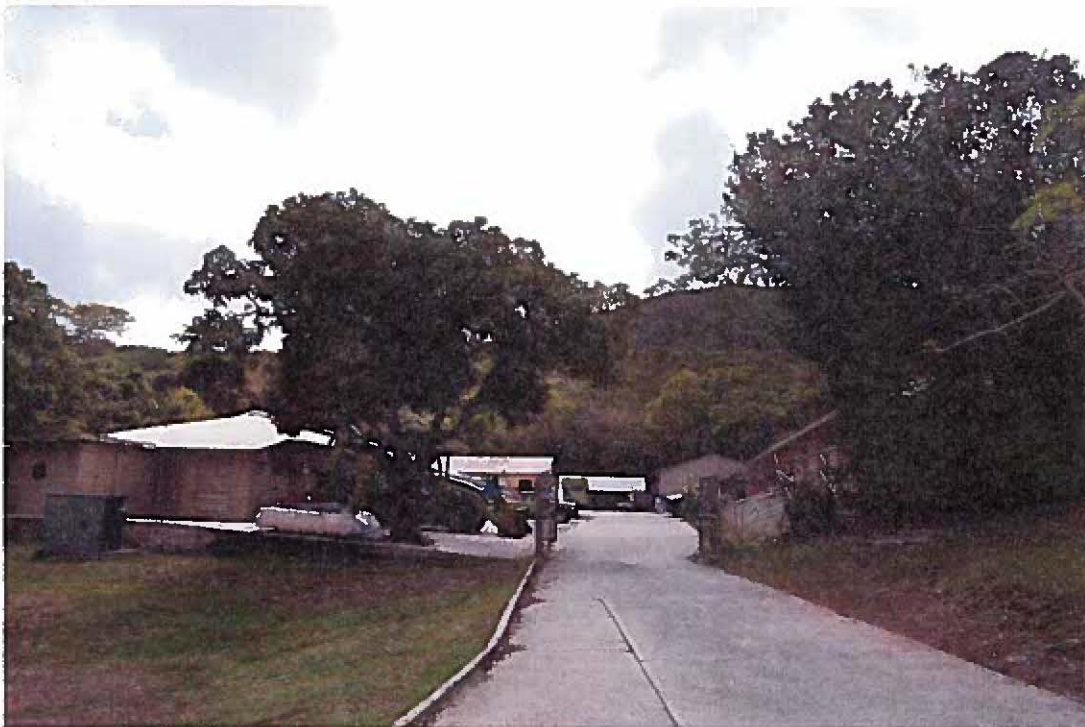
Photo 22: View of the courtyard created by Carpenter Shop, Engineering Warehouse, Motor Pool, Engineering Storage, and Facilities Office, Photo by TJC.