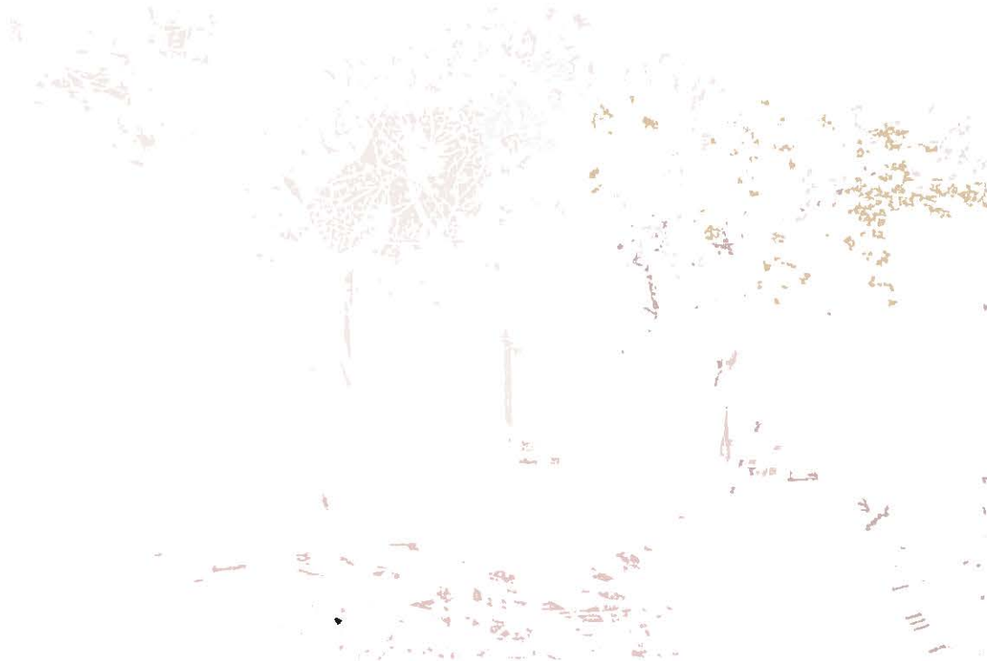
Photo 11: Turtle Bay Beach Rooms (Rooms 87-92, 93-98)

St. John, Virgin Islands County and State