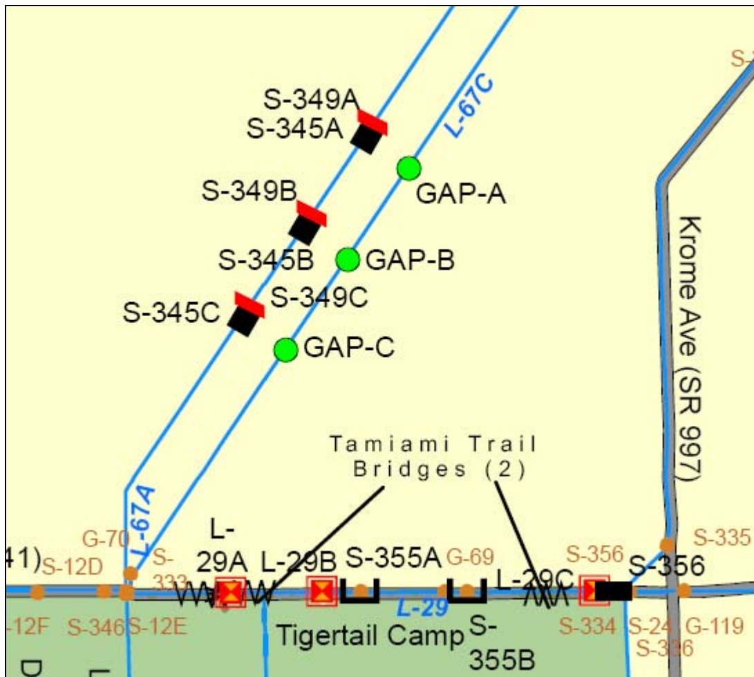
FIGURE A-2: CONVEYANCE AND SEEPAGE CONTROL FEATURES (IMAGE SHOWS THE 2005 PLAN FOR TAMIAMI TRAIL)