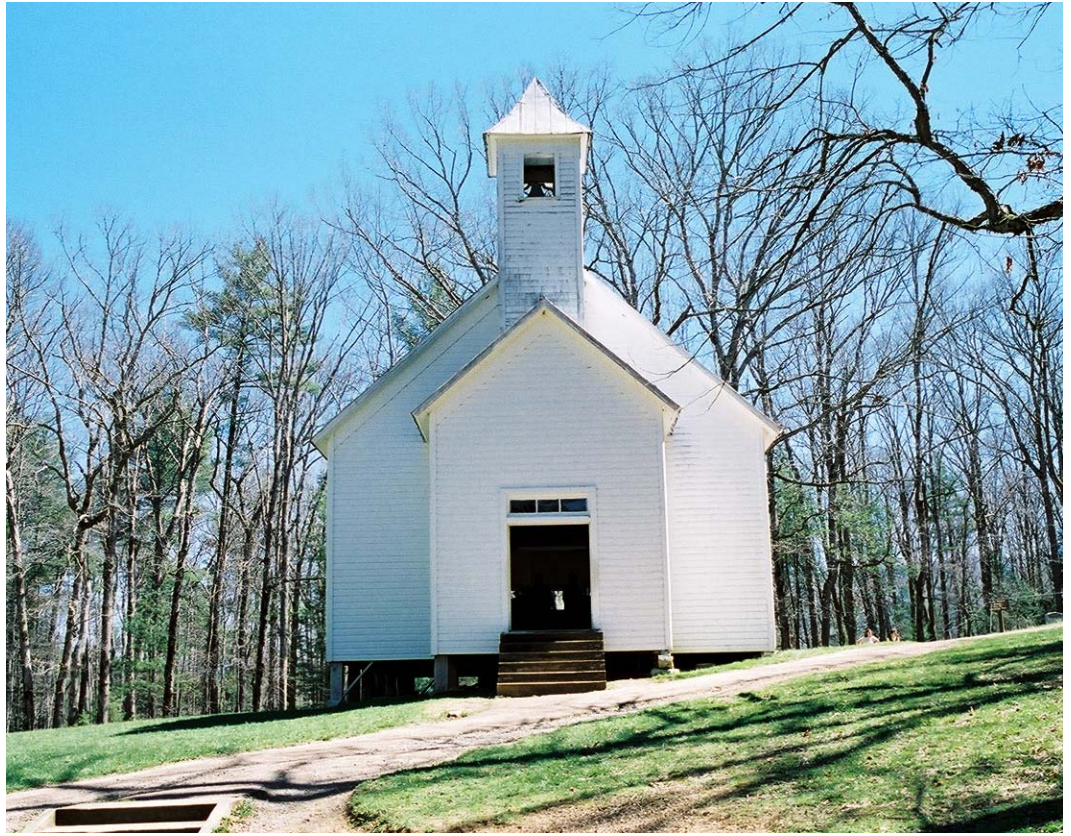
Figure 38. Vandalism is common on a number of the buildings in the Cove.