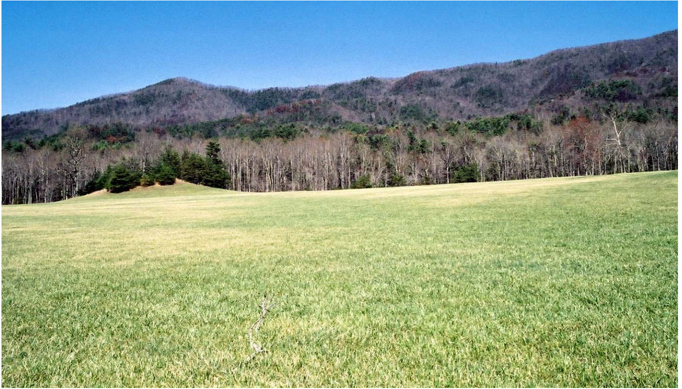
Figure 48. View from northern section of Loop Road looking north. JMA 2003