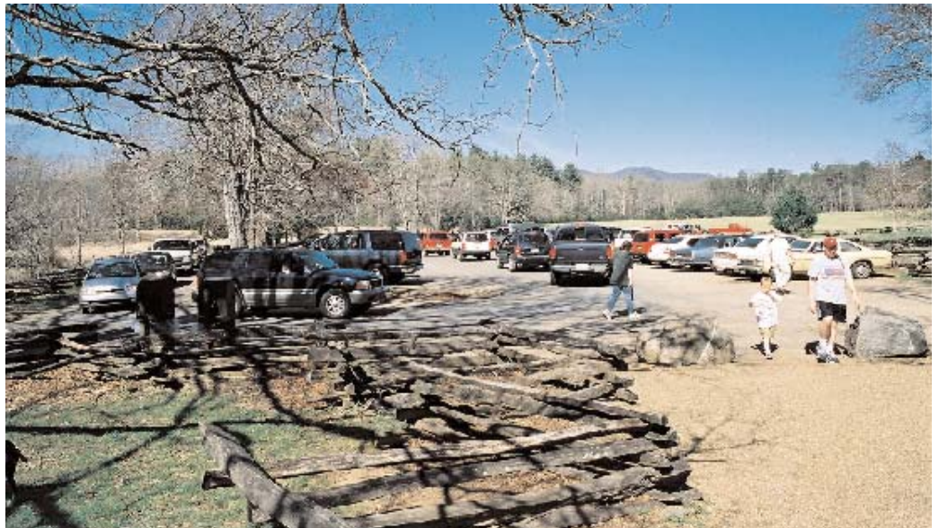
Figure 17. Cable Mill Parking Lot with bookstore in back- ground. JMA 2003