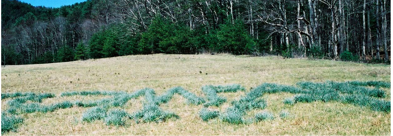
Figure 35. Remnants of CCC planting spelling company name. JMA 2003