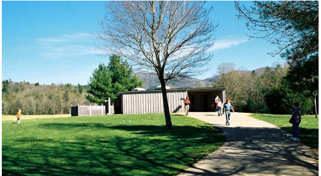
Figure 19. Campground Store. JMA 2003