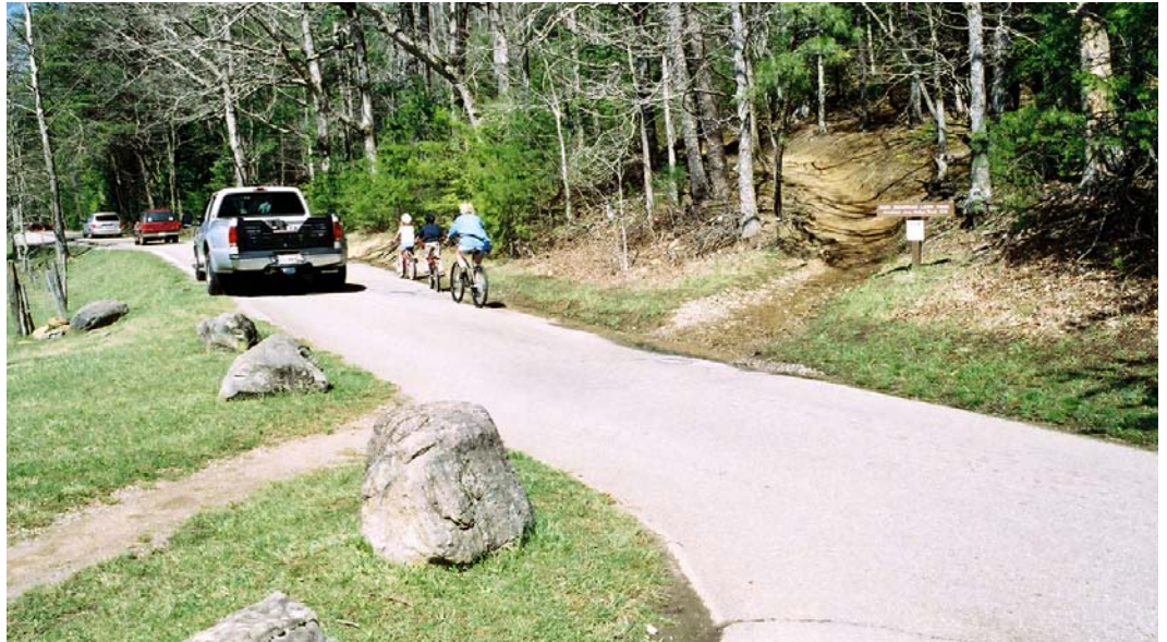
Figure 31. Unplanned pull-off area in foreground with a graveled pull-off visible in top right corner. JMA 2003