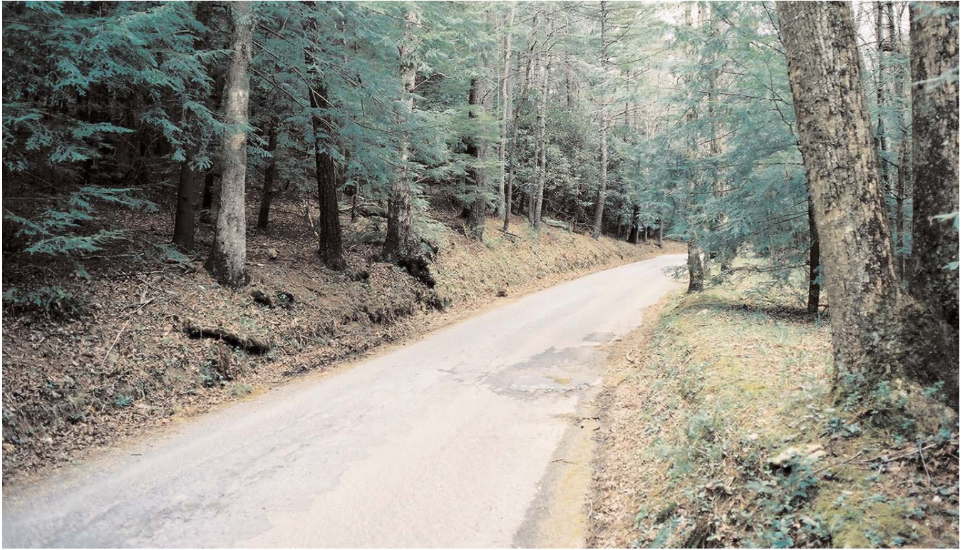
Figure 10. Road corridor through thick forest. JMA 2003