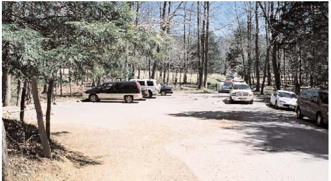
Figure 29. Trail to John Oliver Cabin looking back to Loop Road, note line of automobiles and ero- sion. JMA 2003