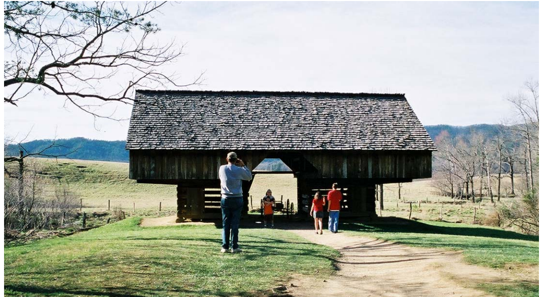
Figure 36. Drive through barn at Tipton-Oliver site. JMA 2003