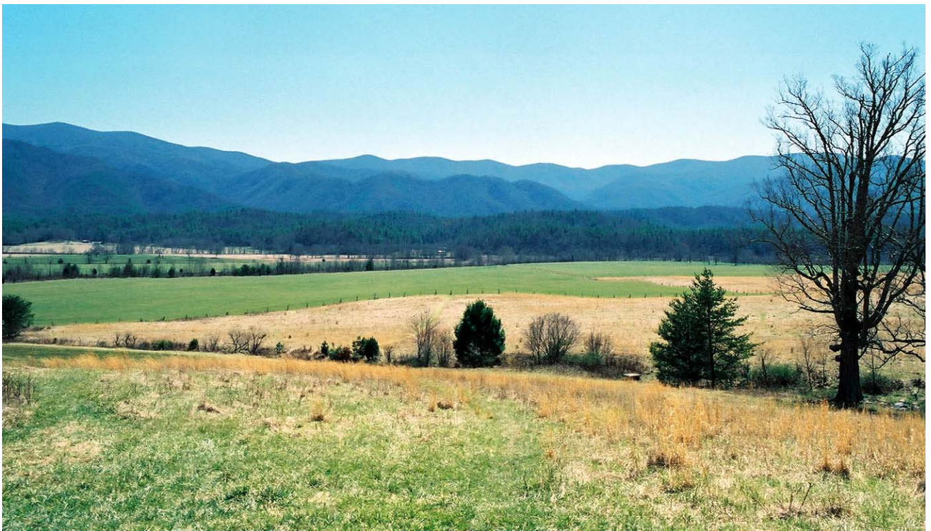
Figure 47. View from northern section of Loop Road looking south. JMA 2003