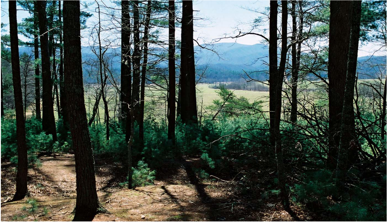
Figure 46. View through tree line to Cove floor looking south. JMA 2003