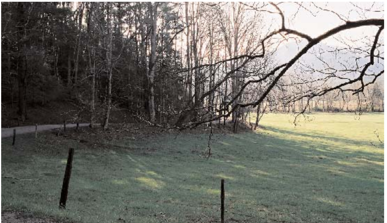
Figure 11. Road corridor with forest on one side and field on the other. JMA 2003