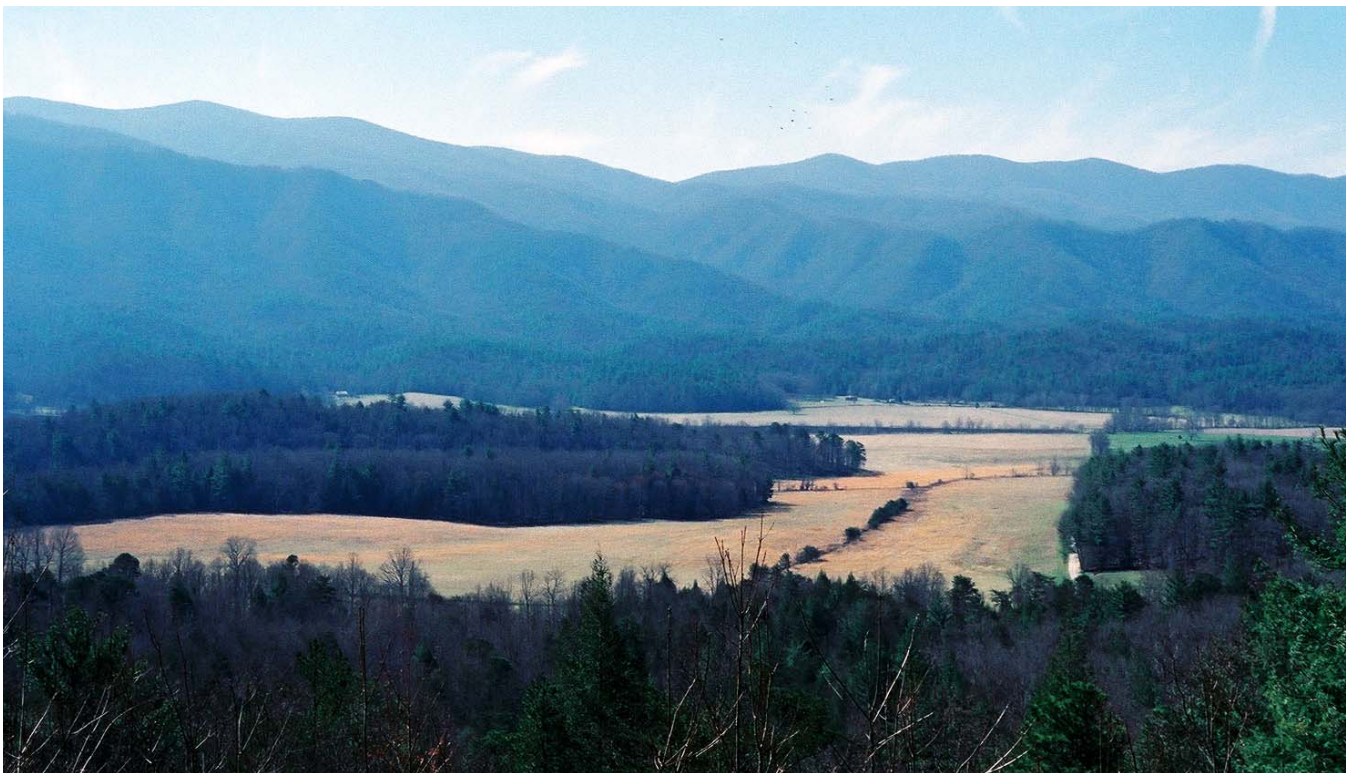
Figure 49. View from Rich Mountain Road looking down to Cove floor. JMA 2003