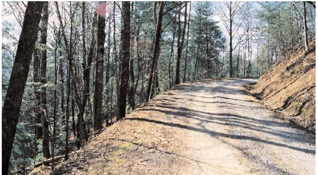
Figure 33. Section of Rich Mountain Road. JMA 2003