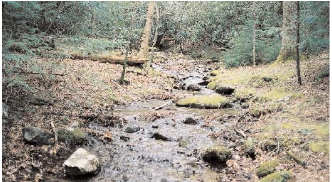
Figure 6. Wetland area with cane break. JMA 2003