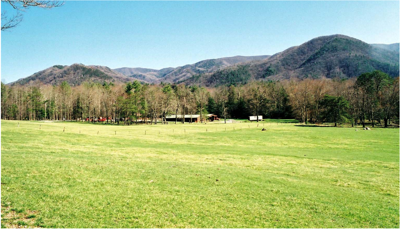
Figure 2. View of cove floor facing southeast, note horse rental area in background. JMA 2003