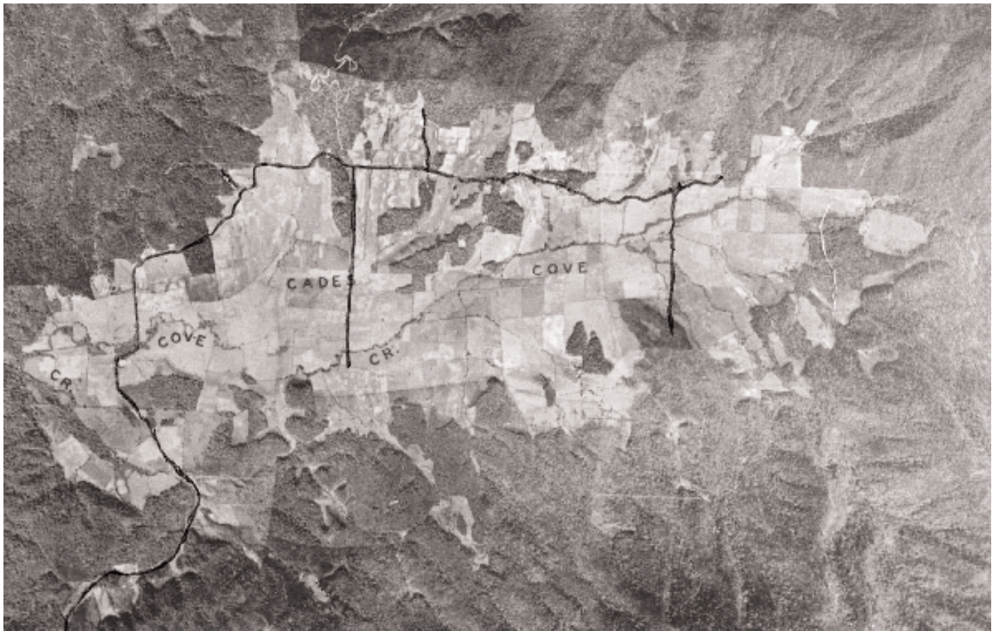
Figure 34. 1936 aerial photo of Cades Cove.