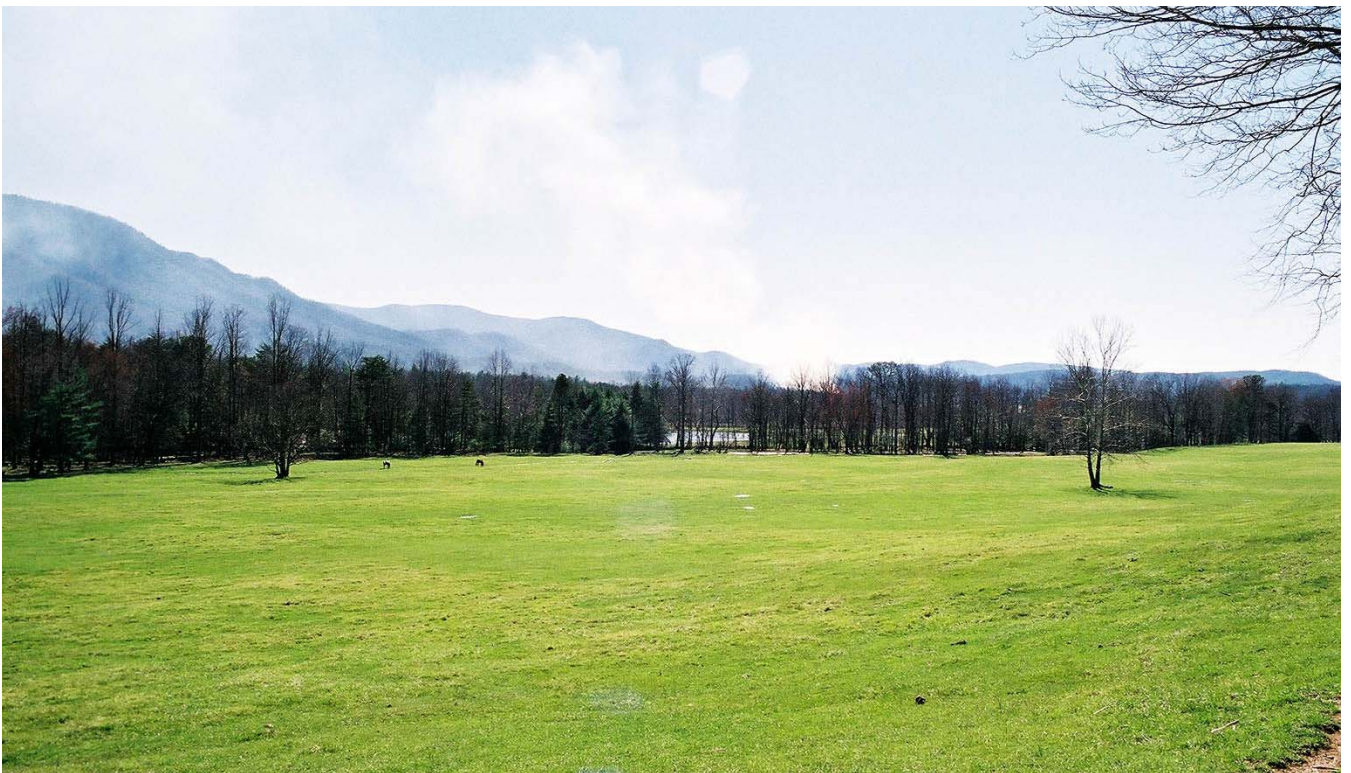
Figure 3. View of cove floor facing west. JMA 2003