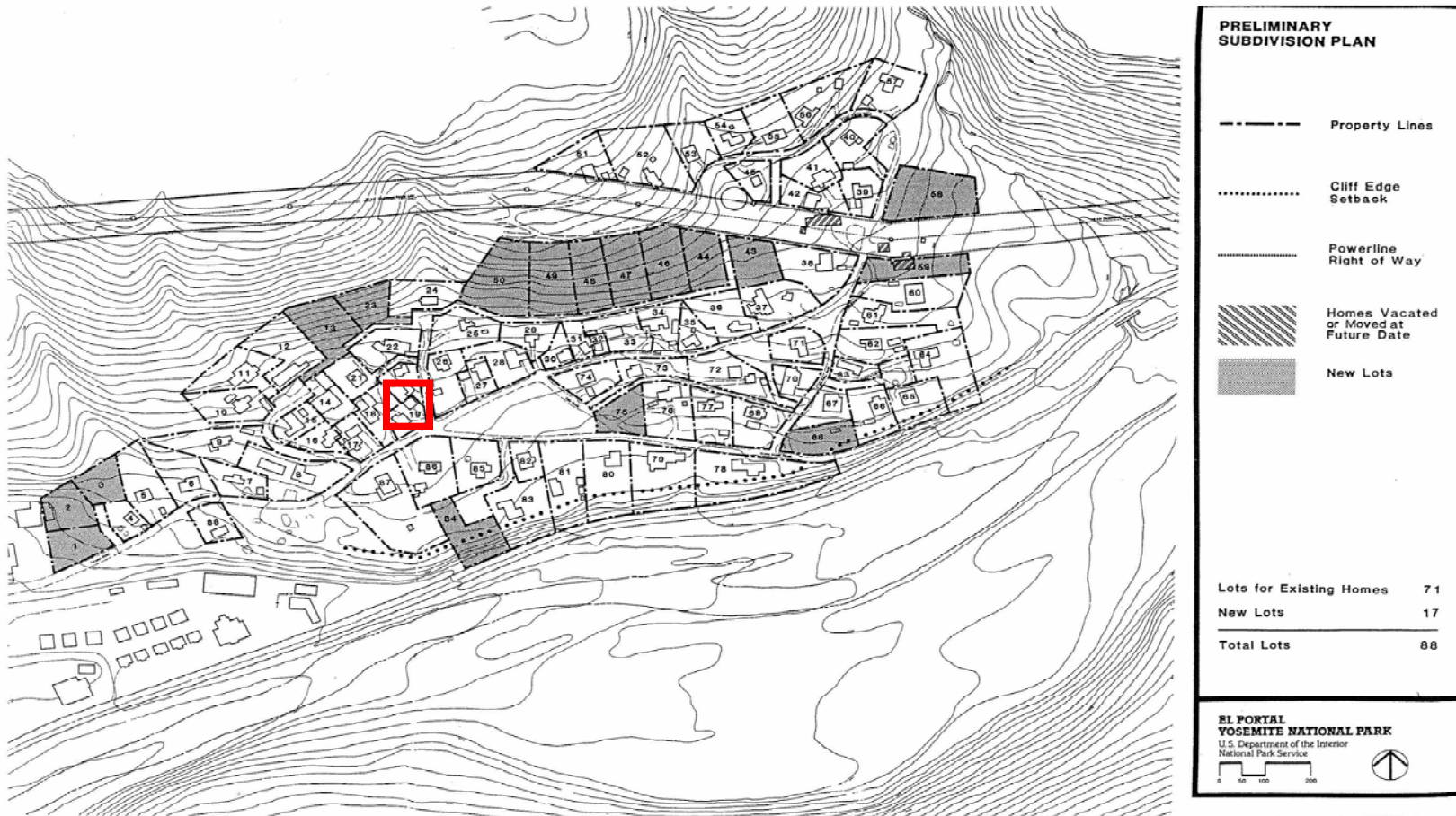
Map - El Portal