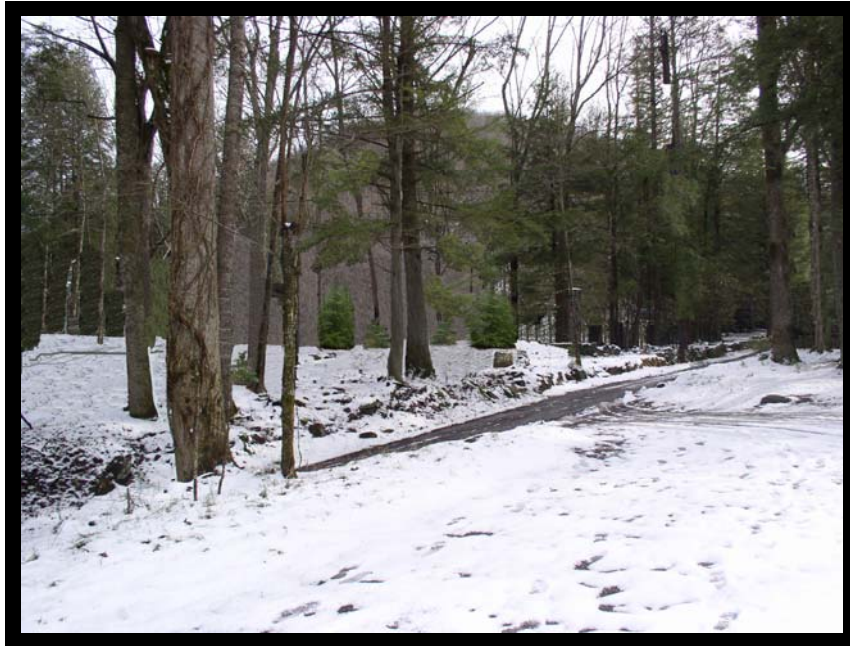
Photo 5A: Viewing Platform from Parking Area at Appalachian Clubhouse

This photo depicts the existing Sneed (#1), Higdon (#3), Addicks (#5), and Smith (#2) cabins in Daisy Town.