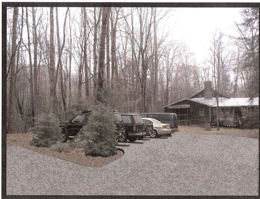
Photo 1A: Proposed Parking Area at the Appalachian Clubhouse This simulation demonstrates mitigation of adverse visual impacts. The technique minimizes the negative effect of the parking area by screening the views of vehicles. Proposed vegetative screens would enhance the parking area at the Appalachian Clubhouse and assist in reducing the amount of visible parking area. Transplanted evergreen vegetation would provide year round screening. Pervious concrete would allow for accessibility and reduce the potential for impacts to the environment.