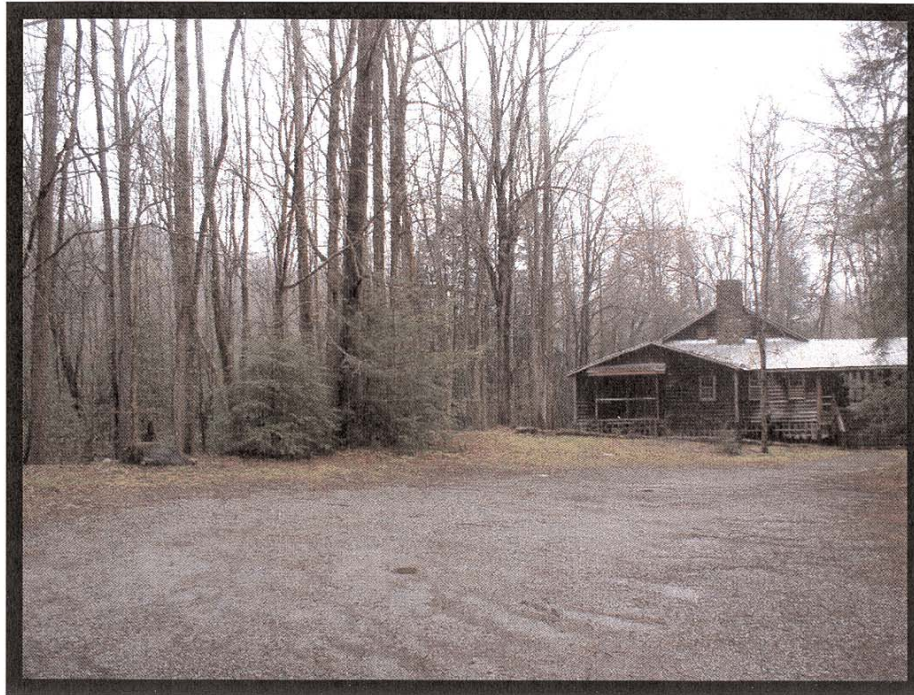
Photo 1: Parking Area at the Appalachian Clubhouse This photo shows the existing Appalachian Clubhouse and parking area. Most of the alternatives propose restoring the Clubhouse for day use.