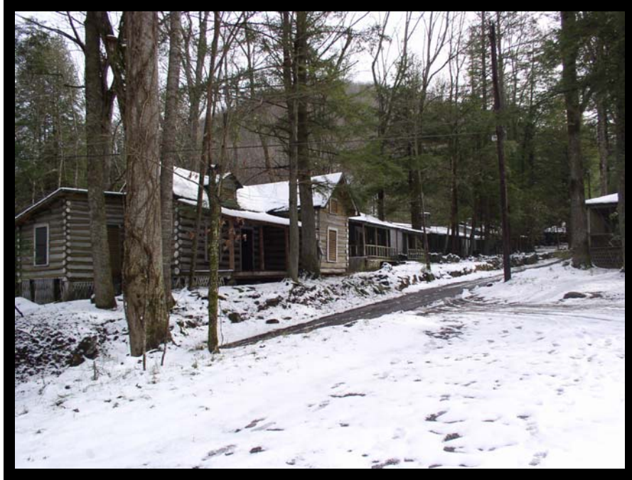
Photo 5: Viewing Platform from Parking Area at Appalachian Clubhouse

This photo depicts the existing Sneed (#1), Higdon (#3), Addicks (#5), and Smith (#2) cabins in Daisy Town.