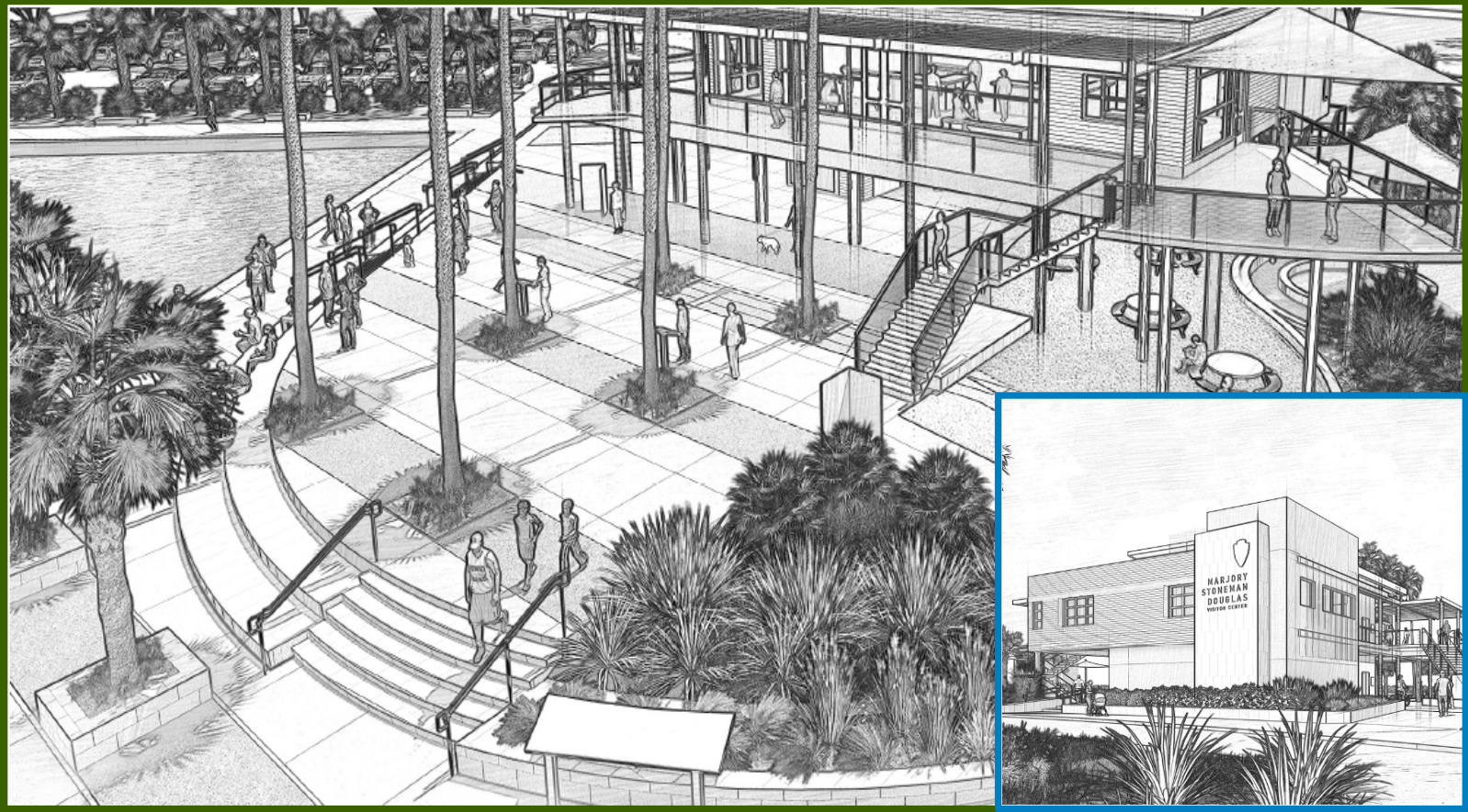
Visitor Center Concept Views