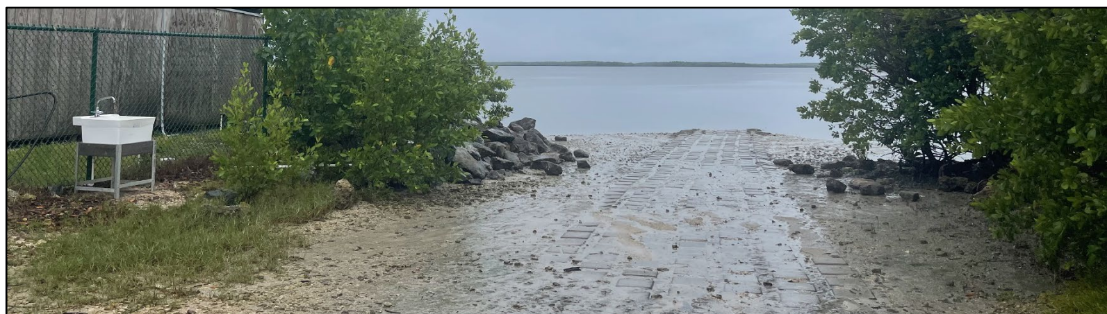
The deposition of sediment have filled in the marina basin, access channels, and canoe/kayak launch/NPS administrative boat ramp making them unusable during low tides and/or inefficient.