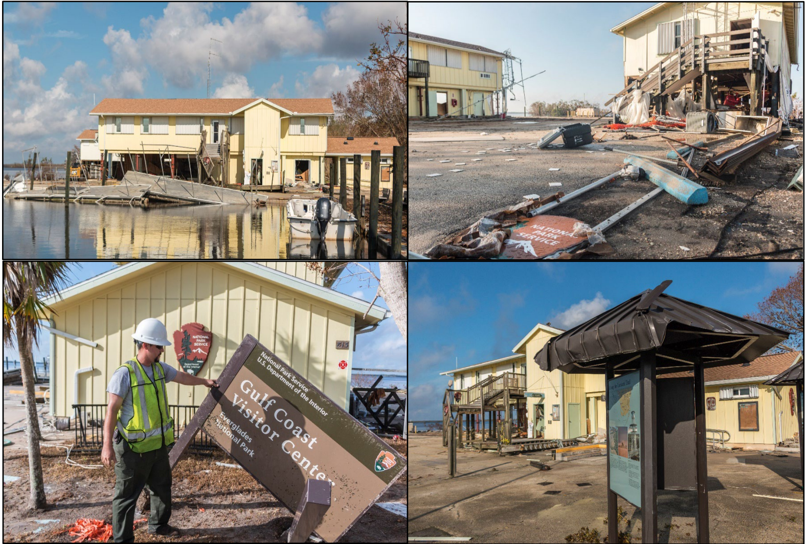
Post-Irma damages to facilities