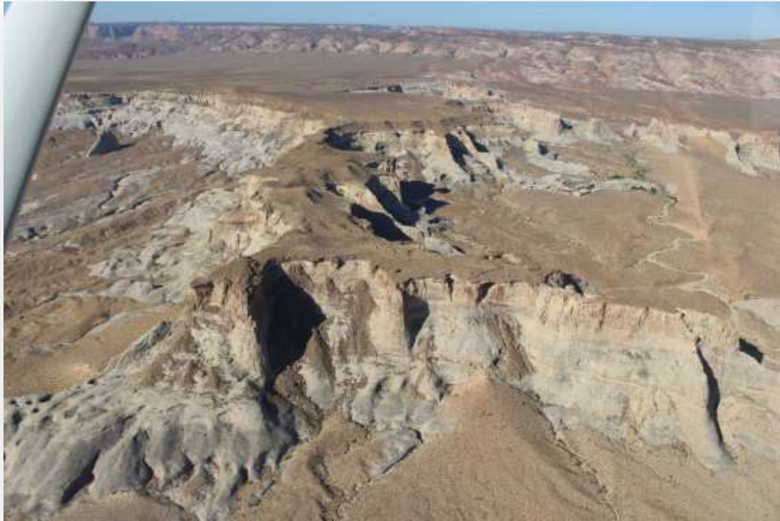
Aerial View of Stud Horse Mesa