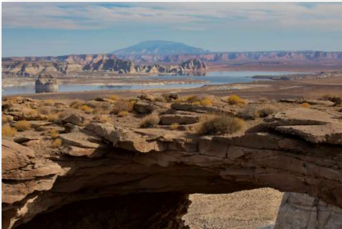
Skylight Arch on Stud Horse Mesa