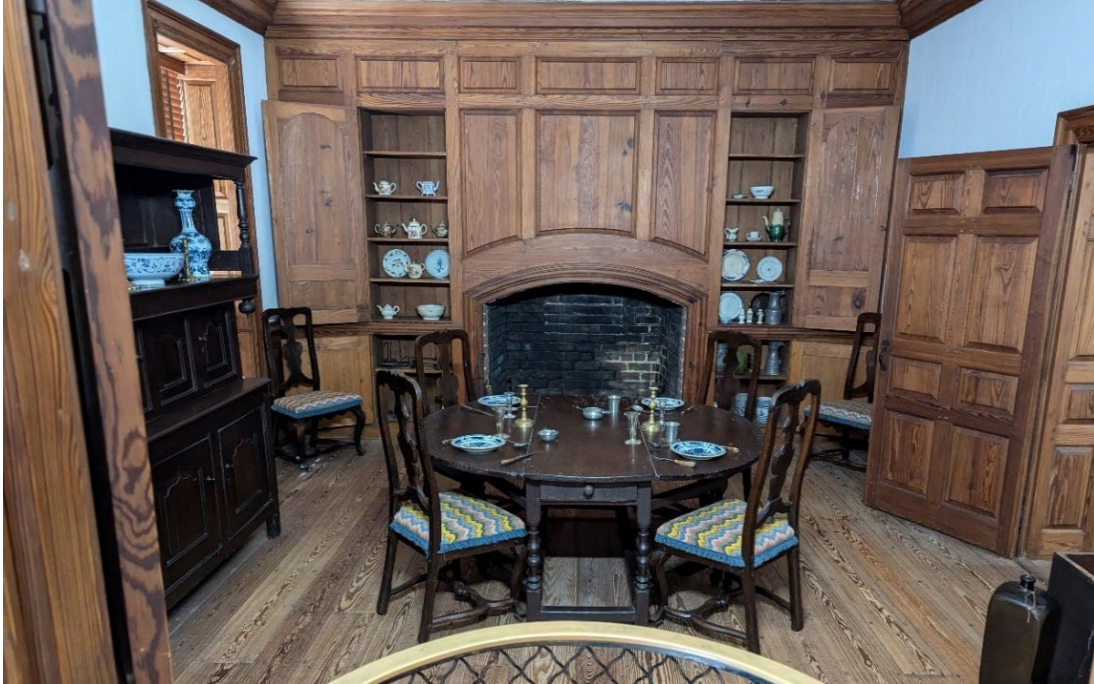
Figure 3. View of Dining room in its current configuration.