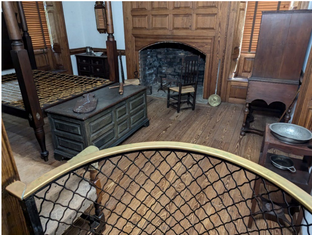
Figure 4. View of Guest Bedroom in its current configuration.