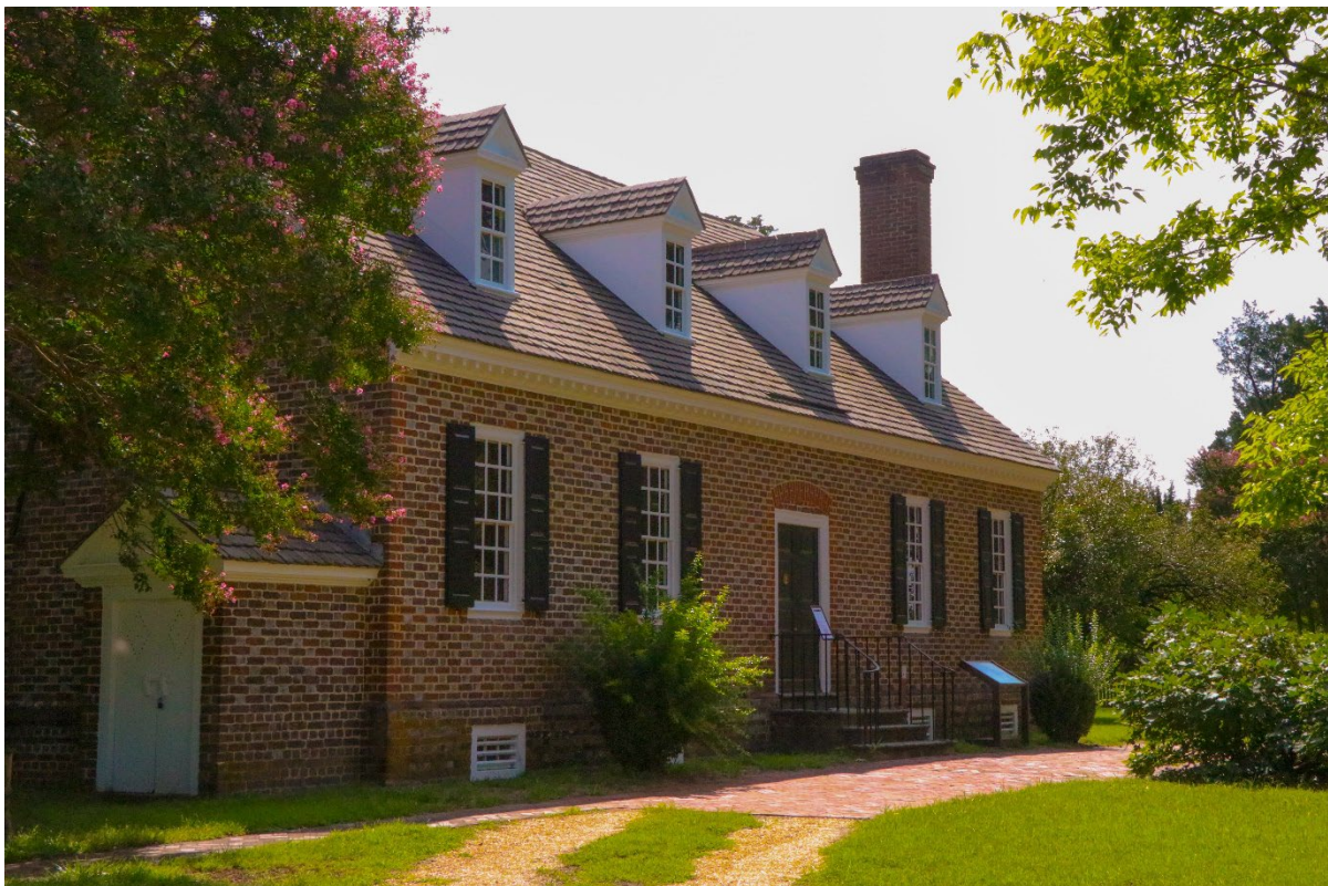
Figure 1. View of Memorial House Museum visitor entrance.