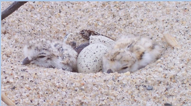
Piping Plover Chicks