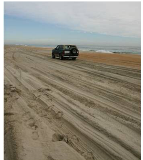
Beach Driving at the Seashore

The purpose of the hearing-style public meetings is to provide additional opportunities for public comment on the Plan/EIS. Upon entering the meeting you will be asked to sign in and to indicate if you request time to make a public comment at the meeting. The meeting will begin with a brief presentation on the process to date and an explanation of the format for the meeting. Once the presentation has concluded, the public comment portion of the meeting will begin. Participants who have indicated that they would like to speak will be called to come forward to speak. A court reporter will be on hand to record the comments. To ensure that all who would like to speak are provided the opportunity, the time available will be divided among the number of speakers signed up, but all speakers will be allotted at least 3 minutes to provide their comments. Written comments will also be accepted at the public meetings, on-line through the NPS Planning, Environment and Public Comment website, or through the mail, as described in this newsletter.