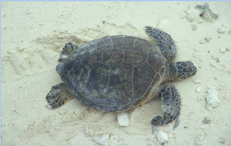
Green Turtle

and the Superintendent's Compendium 2007, as well as elements from the 1978 draft interim ORV Management Plan that were incorporated in Superintendent's Order 07.