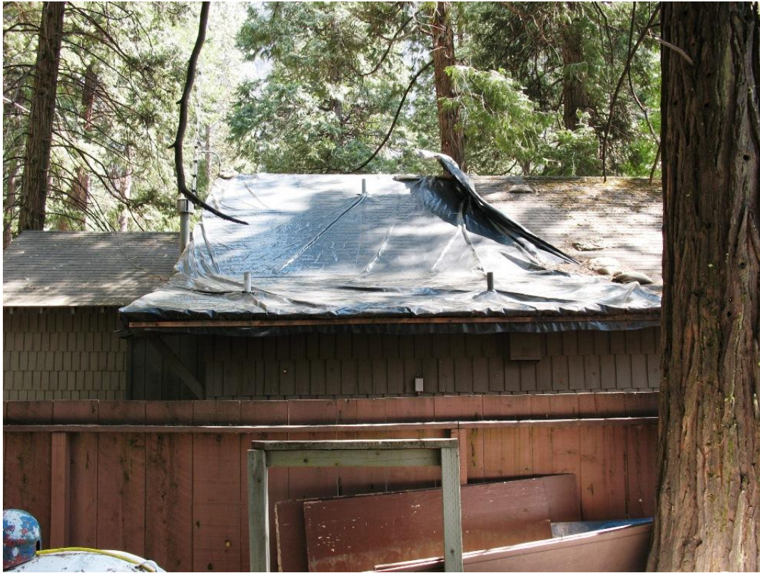
Photo #1 – Huff House roof from the north. Brown tarp covering eastern side of roof.