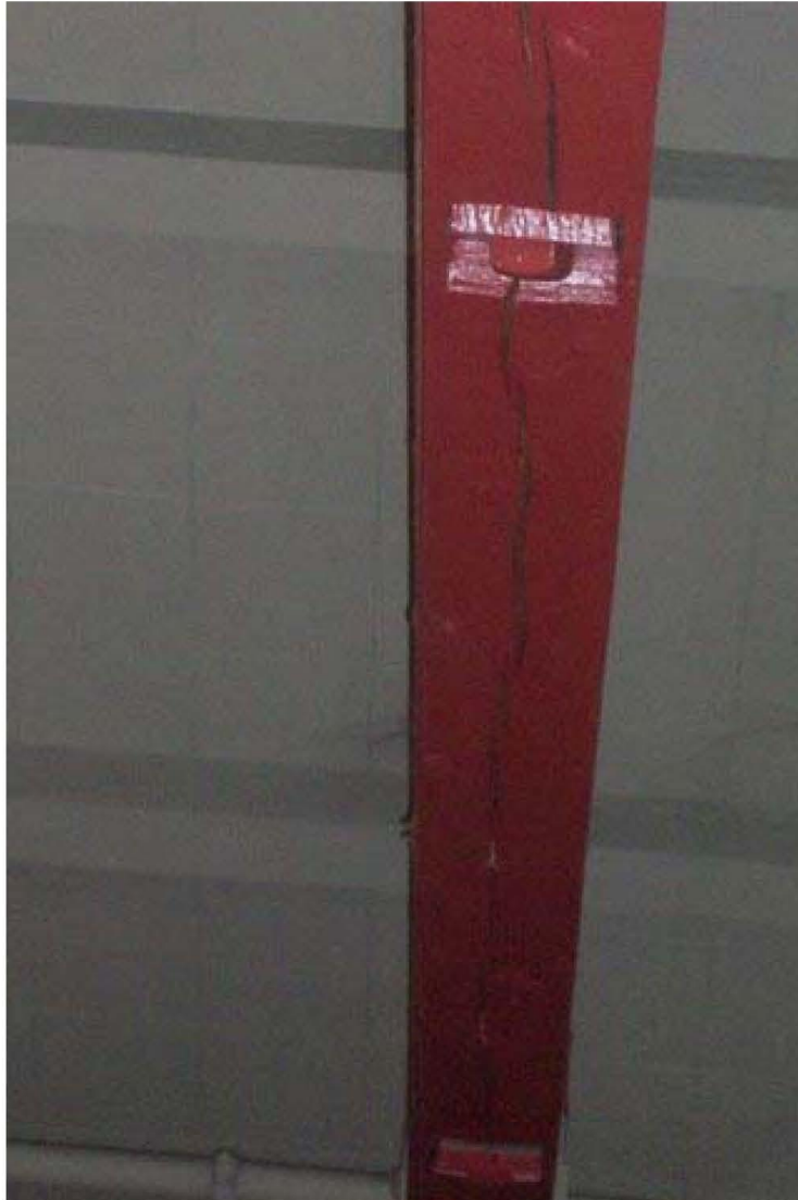
Curry Village Store truss with signs of stress.