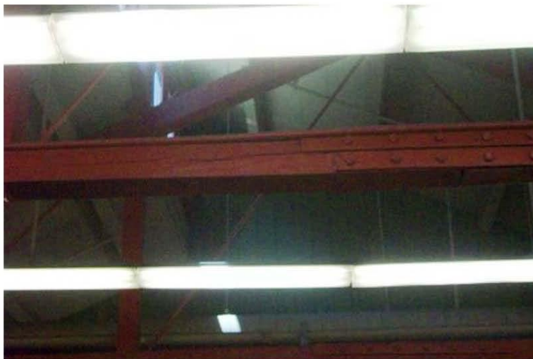
Curry Village Store Trusses to be assessed for structural integrity.