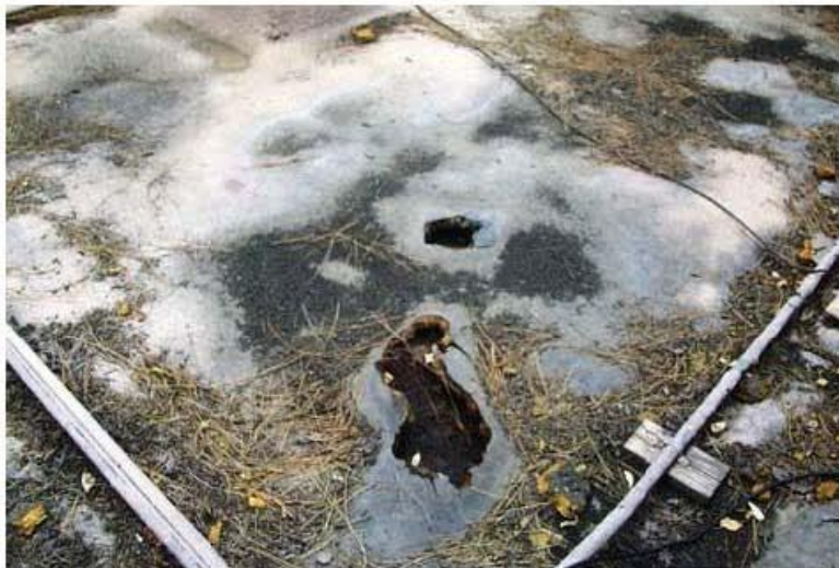
Areas of significant deterioration on the roof causing leaking into the complex.