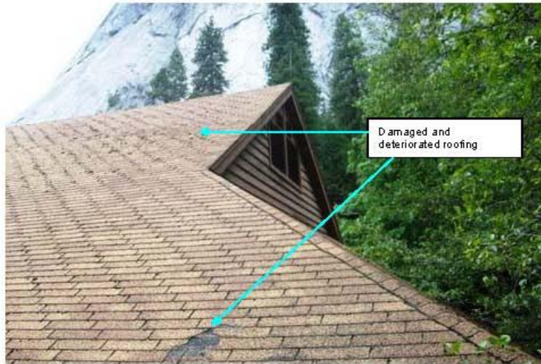
Damaged and deteriorated roofing in need of replacement.