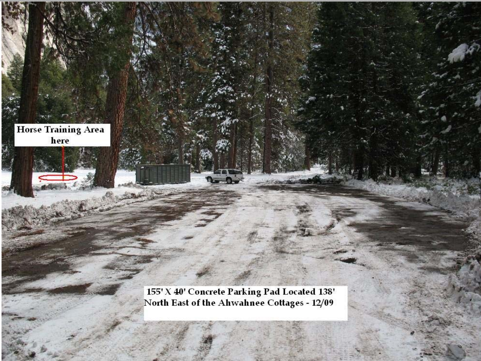
155' X 40' Concrete Parking Pad Located 138' North East of the Ahwahnee Cottages - 12/09