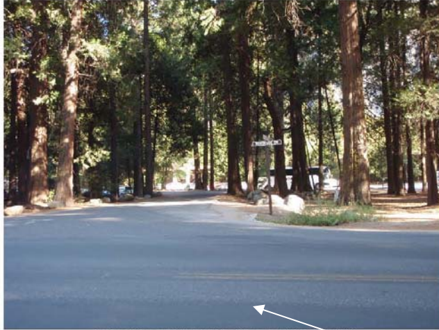
Lodge Drive and North Side Drive near Camp 4.JPG 9/23/2009