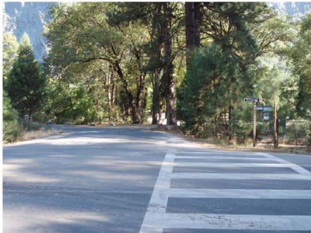
Meadow Lane and North Side Drive.JPG 9/23/2009