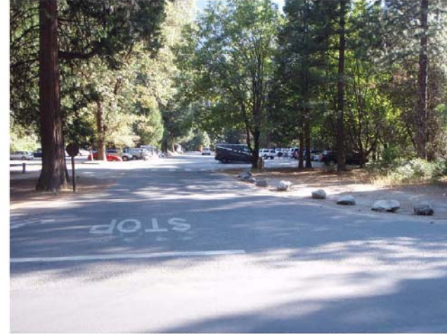
Lodge Drive and North Side Drive near Lower Falls.JPG 9/23/2009