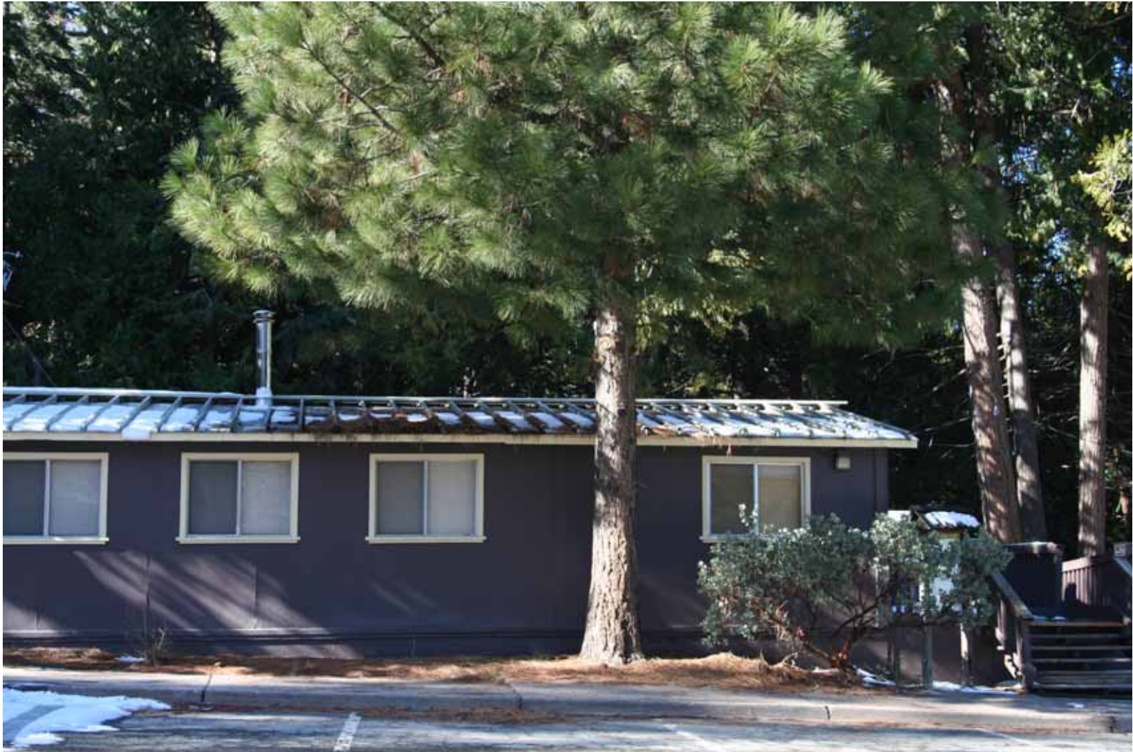
Big Oak Flat Contact Station