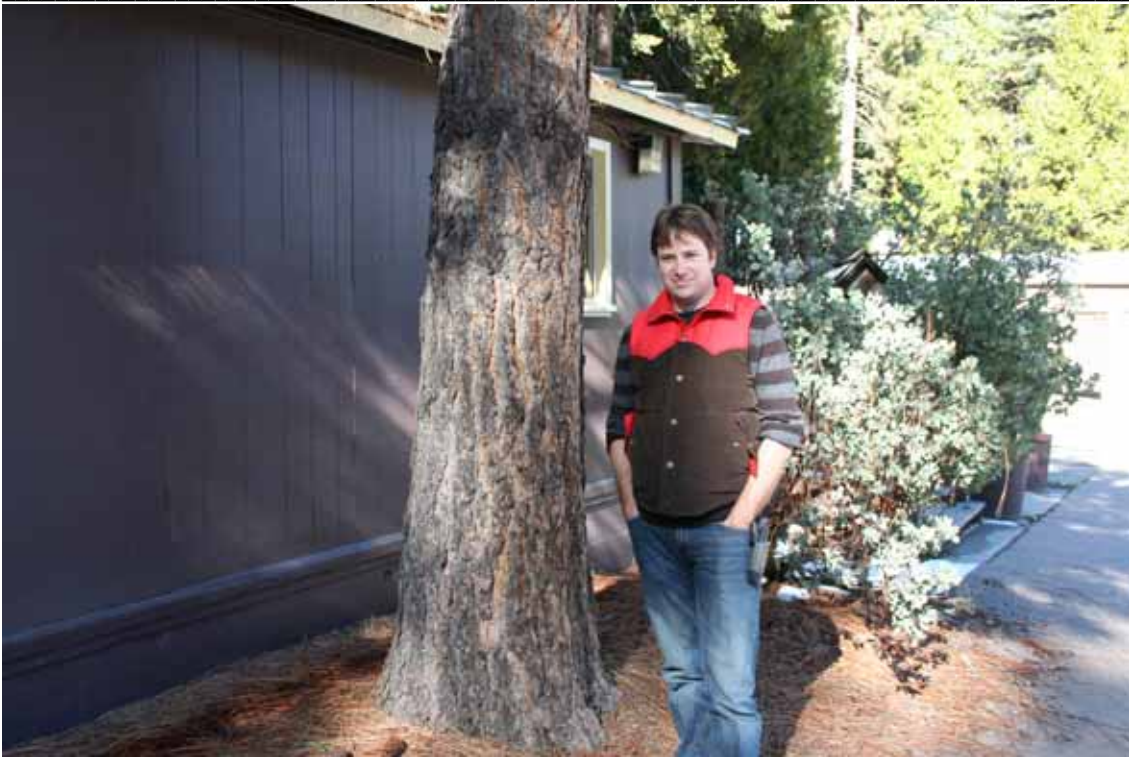
Tree to Be Removed