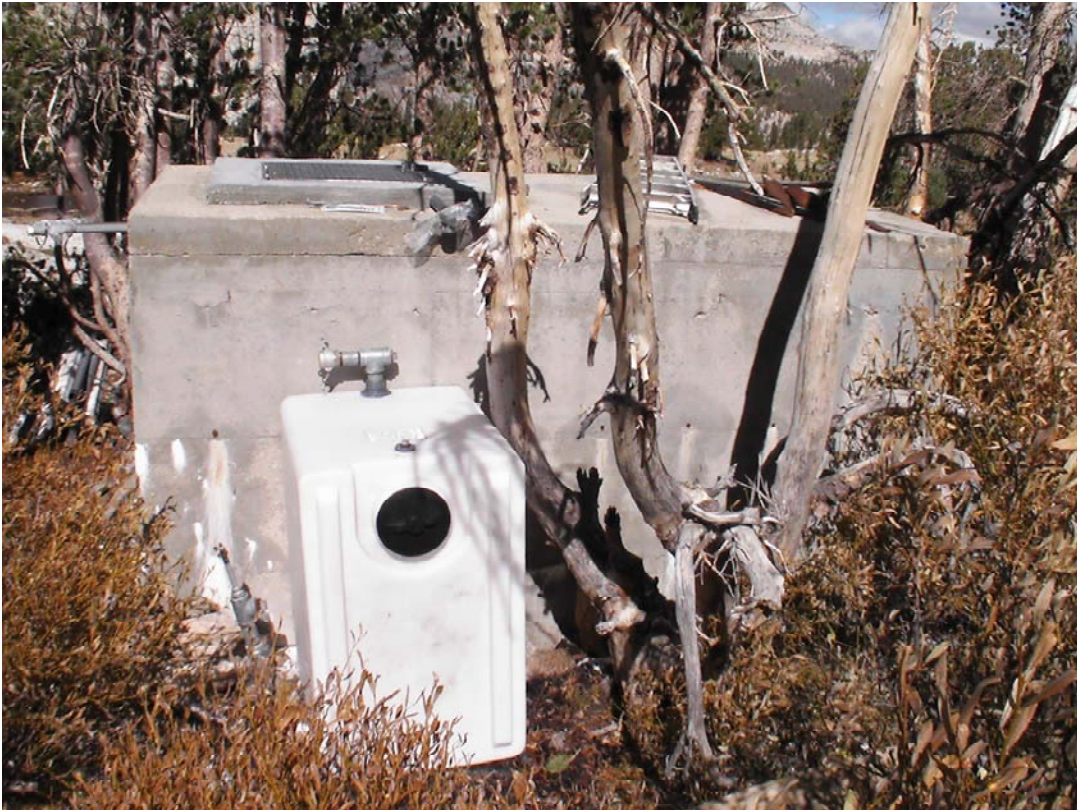
Photo #1: Concrete water tanks with temporary 300 gallon polyethylene tank in front.