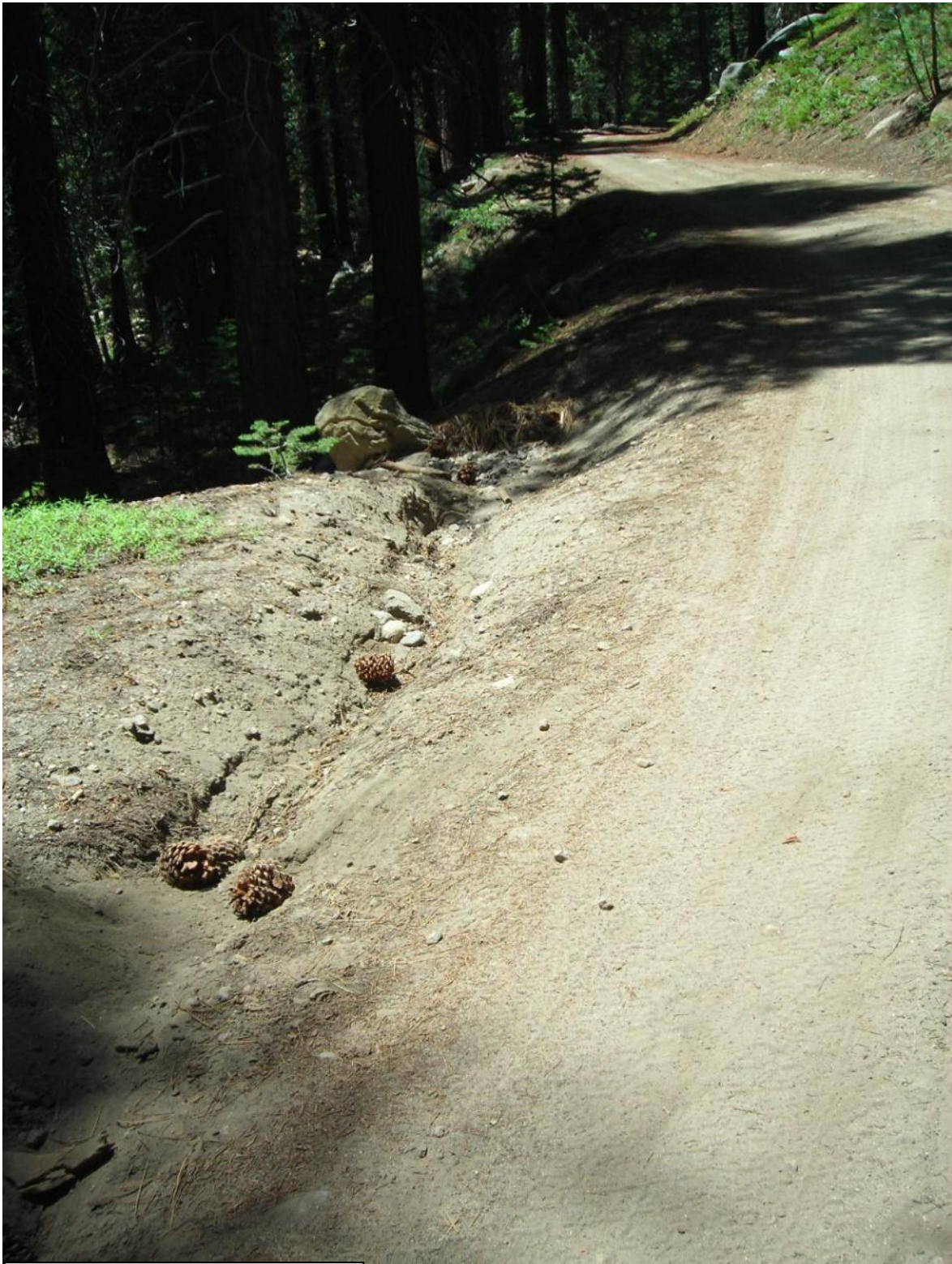
GREAT SIERRA WAGON ROAD EROSION 1 PROJECT: HARDEN 2