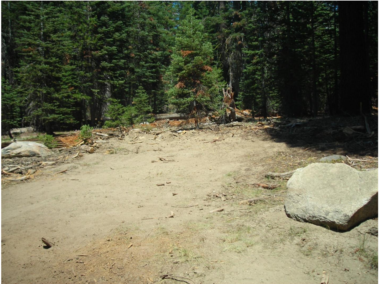
STAGING AREA 4 PROJECT: HARDEN 2