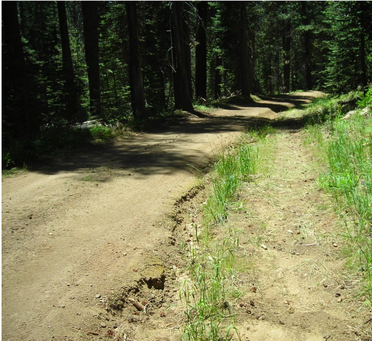
GREAT SIERRA WAGON ROAD EROSION 2 PROJECT: HARDEN 2