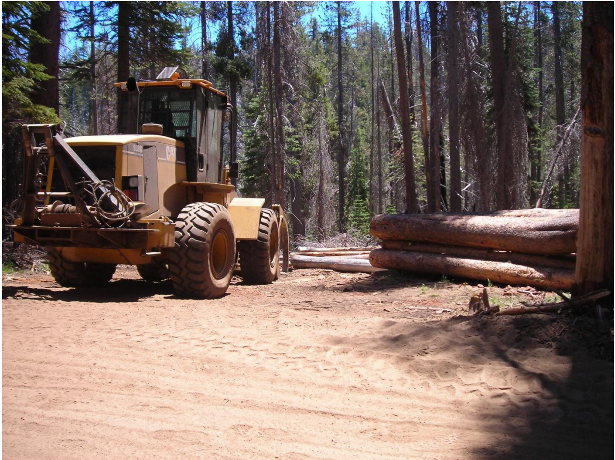
STAGING AREA 1 PROJECT: HARDEN 2