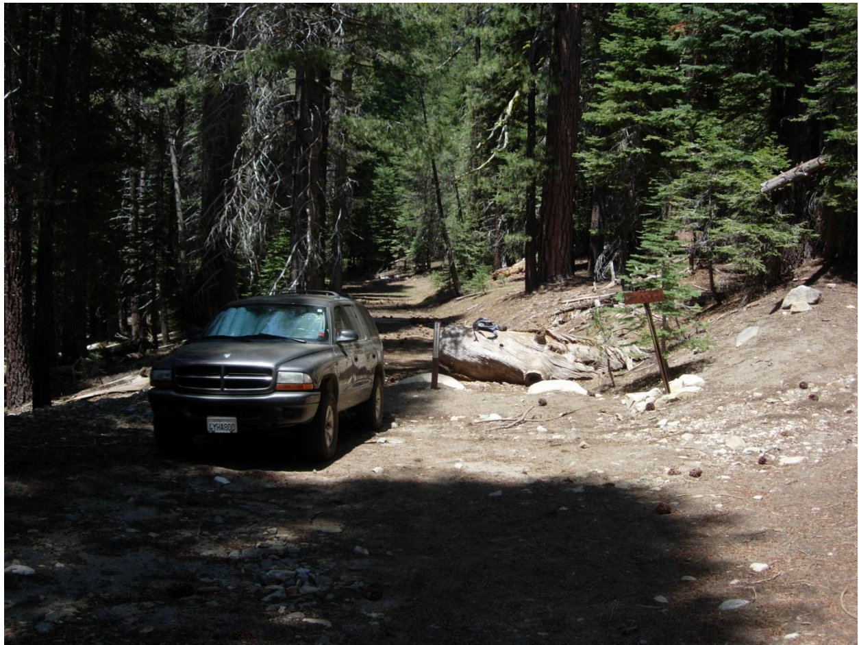
Staging Area 2 Project: Harden 2