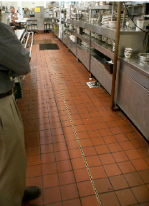
A. KITCHEN FLOOR FROM ABOVE