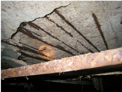
C. KITCHEN FLOOR FROM BELOW