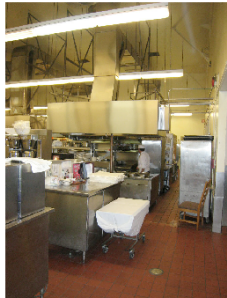
B. KITCHEN FLOOR FROM ABOVE