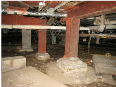
D. KITCHEN FLOOR FROM BELOW